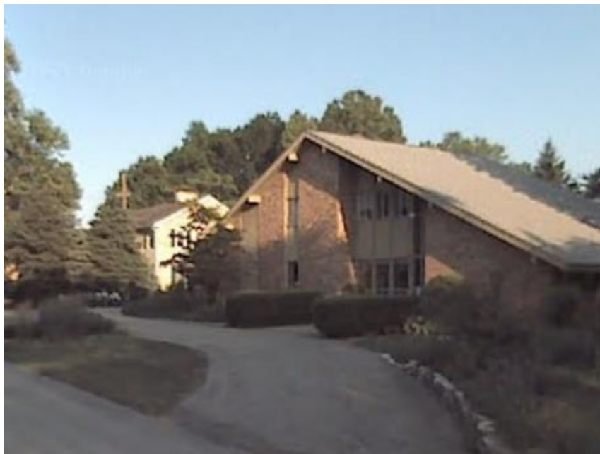
Photo 6: Driveway/Parking Area in Front Yard (taken September 2007)