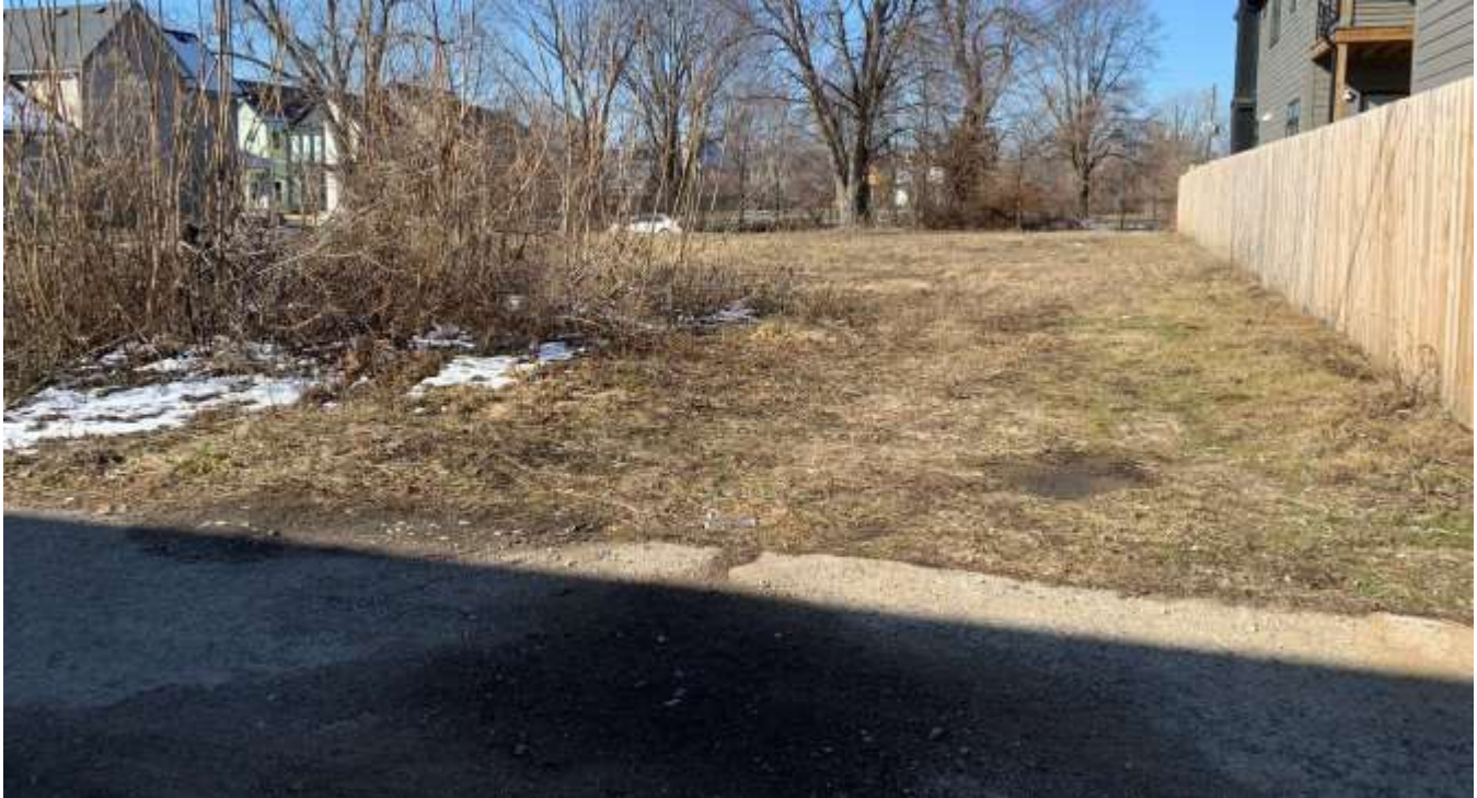
Photo of the rear of the property looking west.