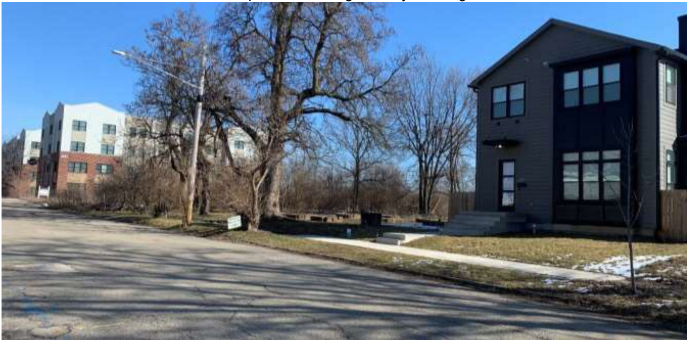
Photo of the single-family dwelling north of the site.