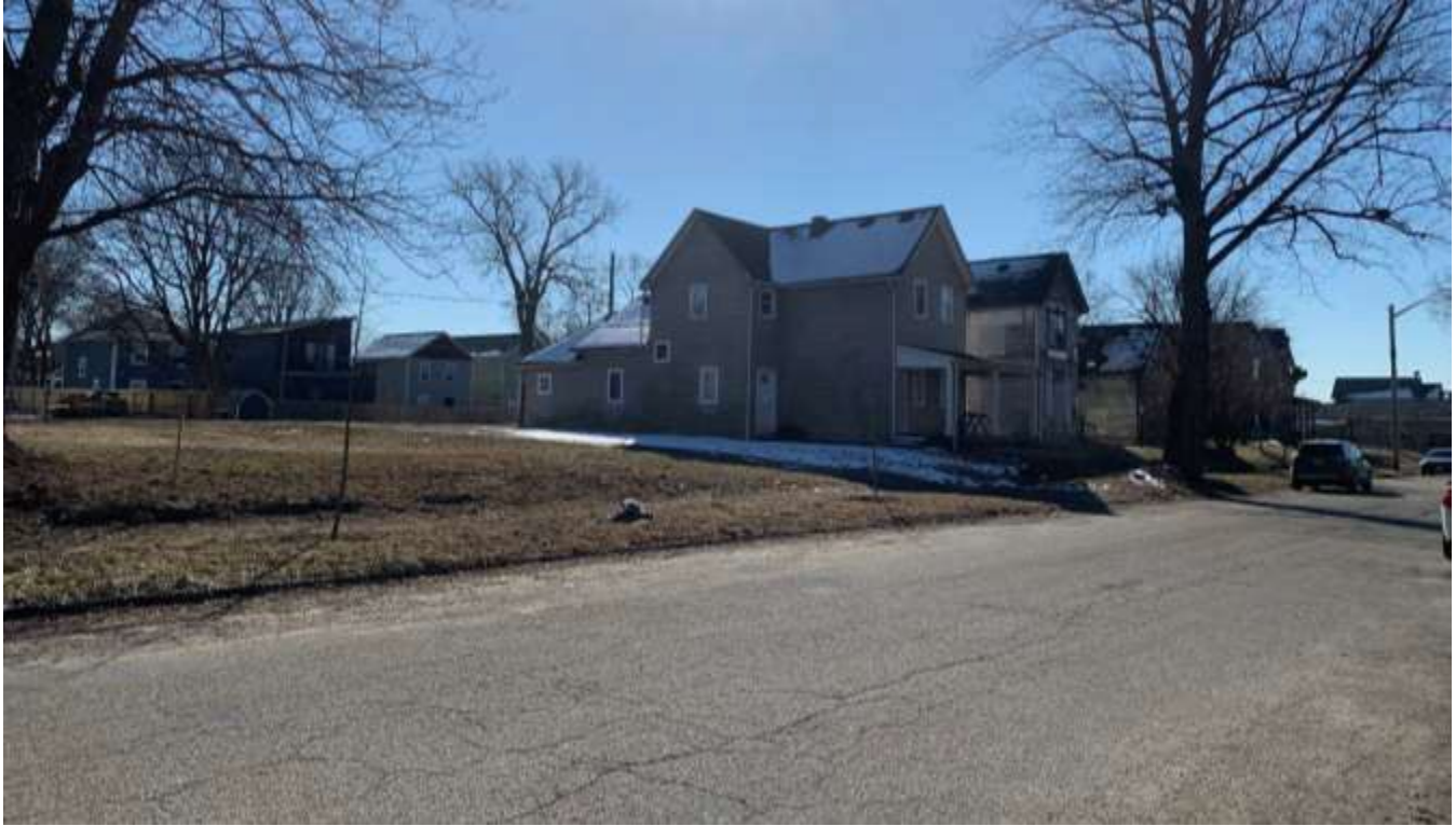
Photo of the undeveloped lot and single-family dwellings south of the site.