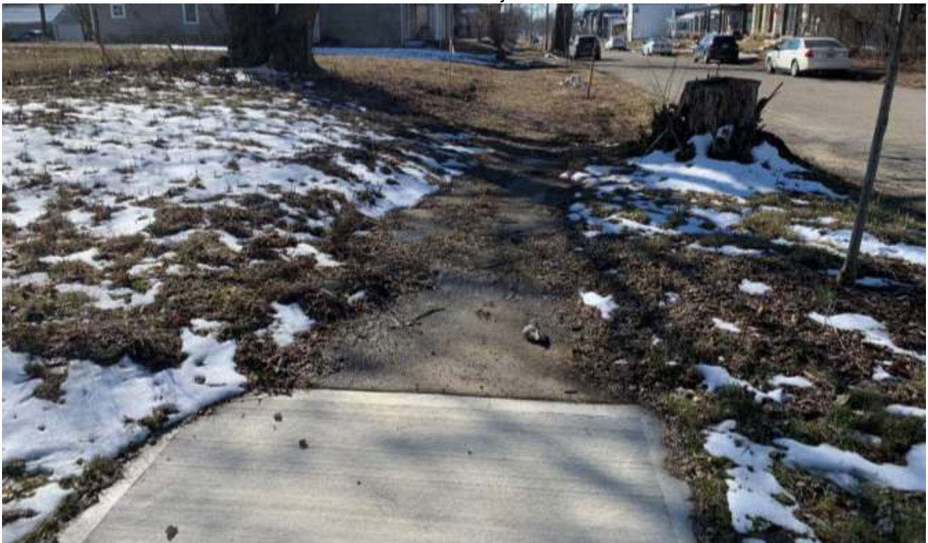
Photo of the sidewalk conditions in front of the property.