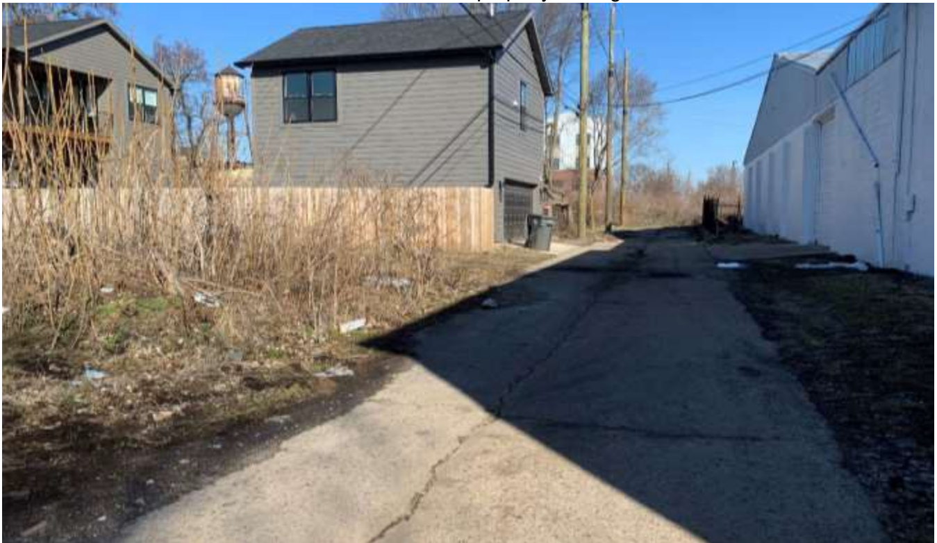
Photo of the alley east of the site.