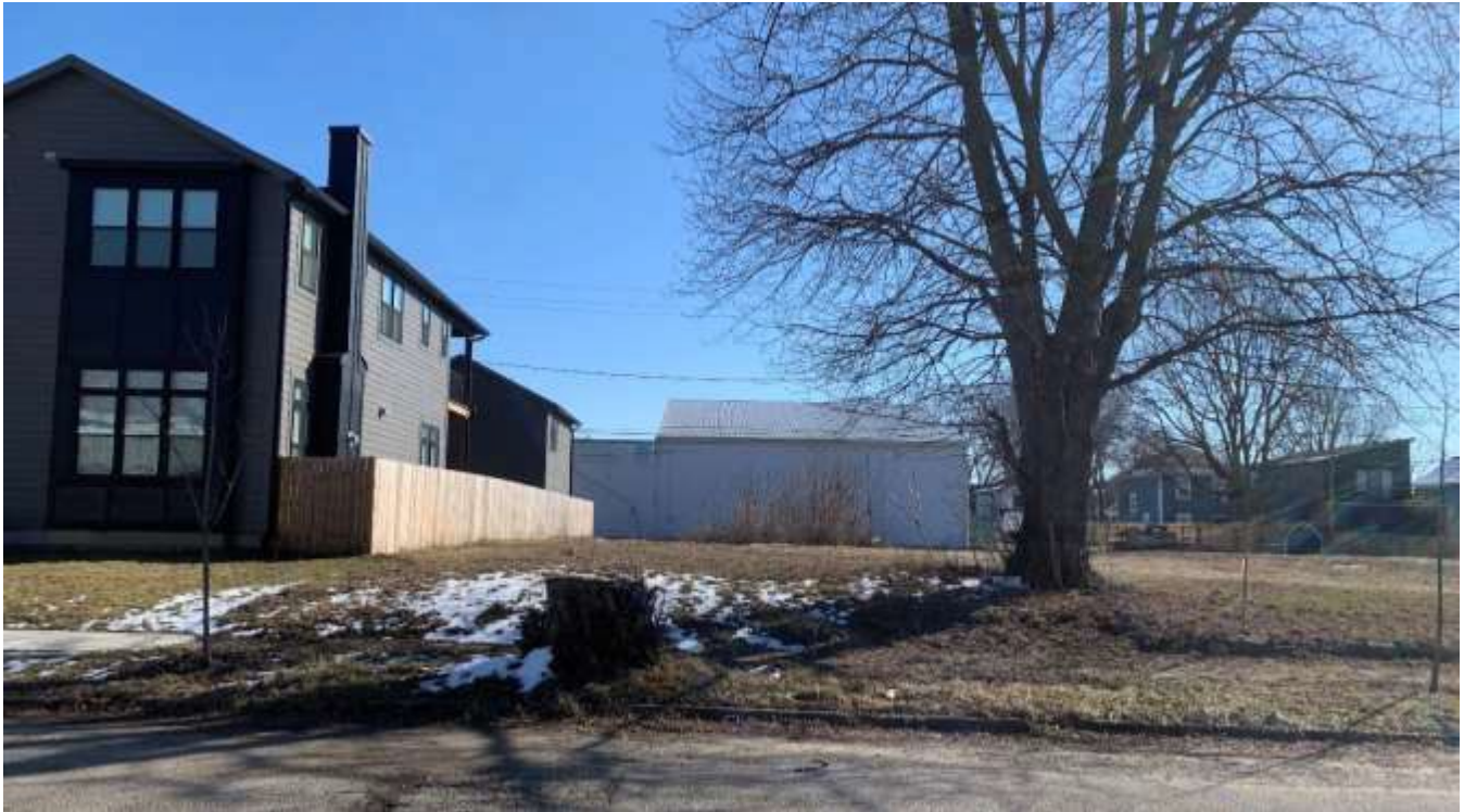
Photo of the subject site.