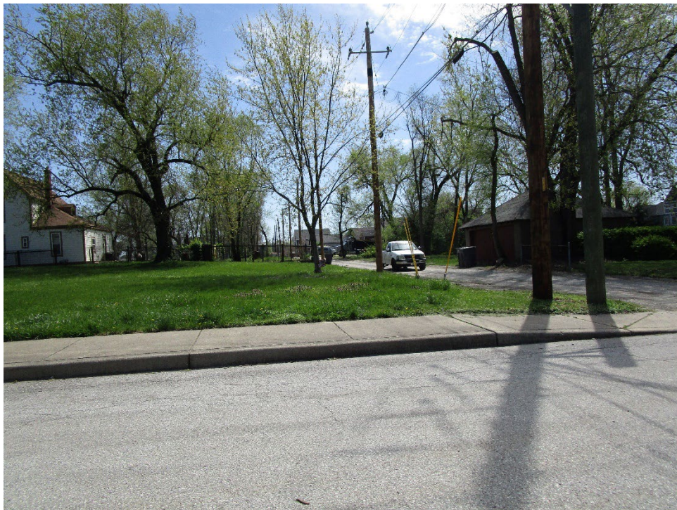
View looking south on north/south alley west of Winthrop Avenue