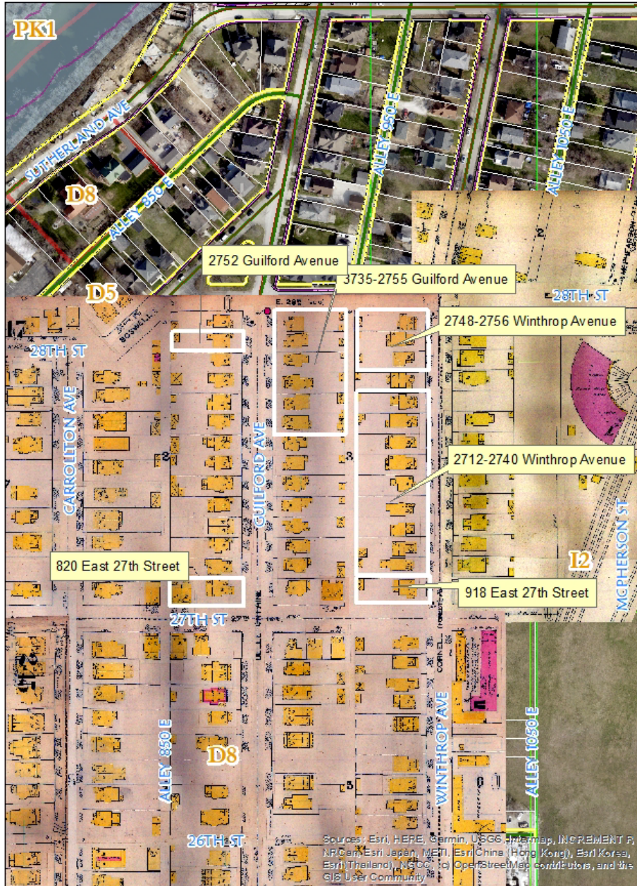
918 and 820 East 27th Street, 2735-2755 Guilford Avenue and 2712-2756 Winthrop Avenue