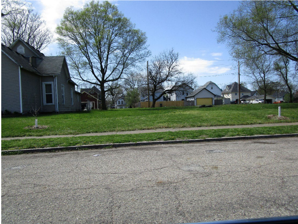
View of site looking west across Winthrop Avenue