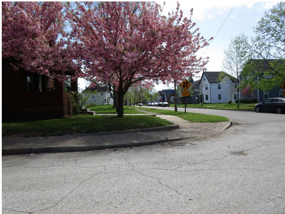
View looking south along Guilford Avenue