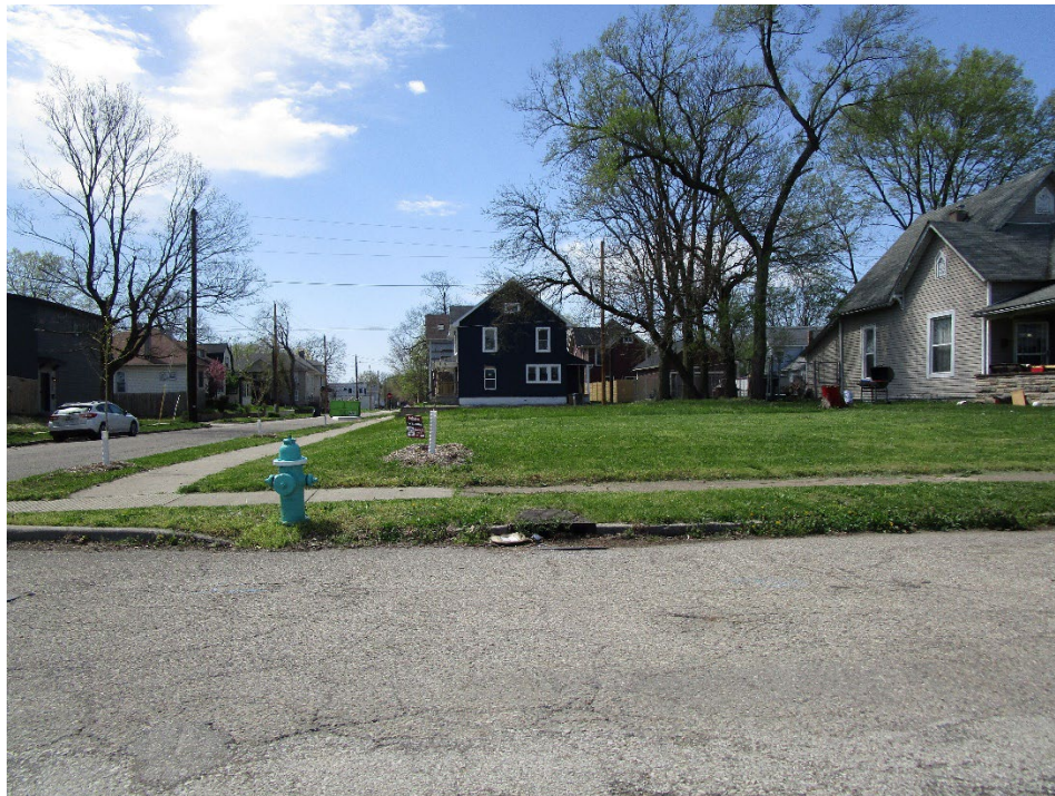
View of site looking west across Winthrop Avenue