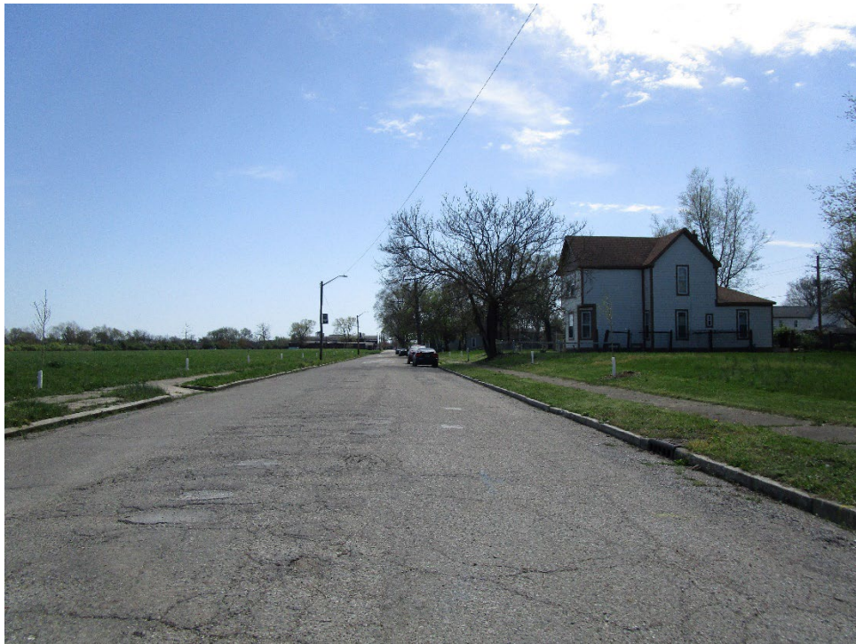
View looking south along Winthrop Avenue