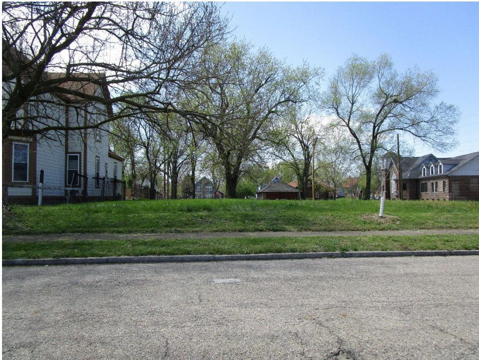
View of site looking west across Winthrop Avenue