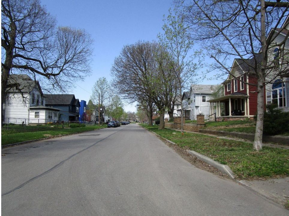
View looking north along Guilford Avenue