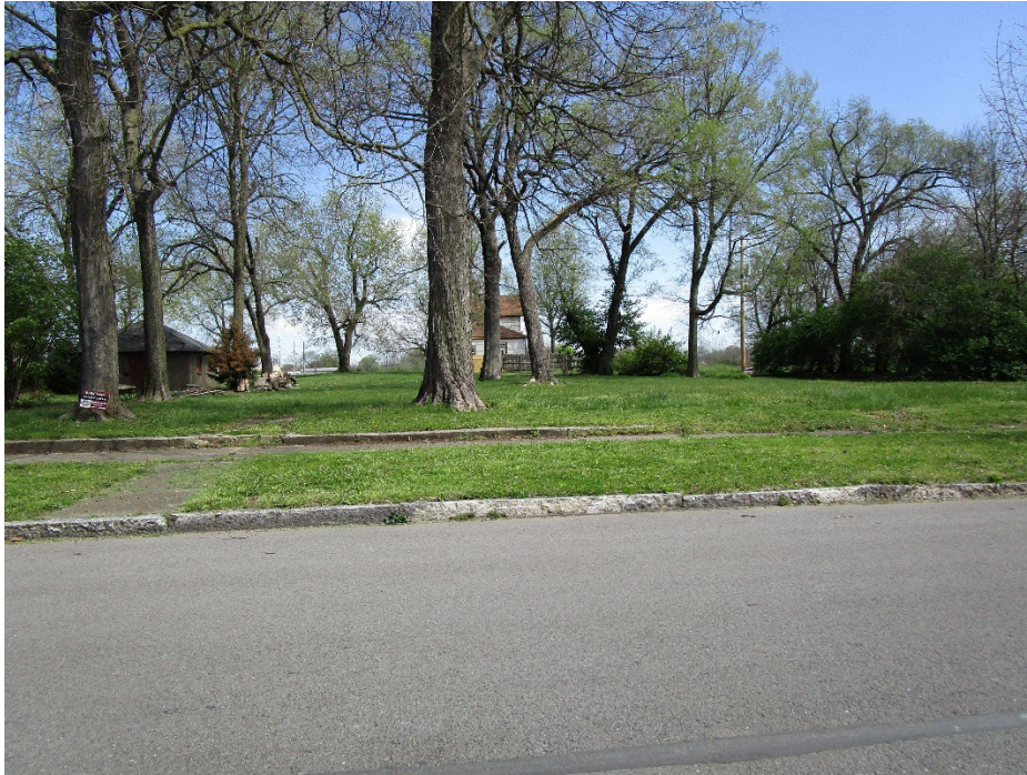
View of site looking east across Guilford Avenue