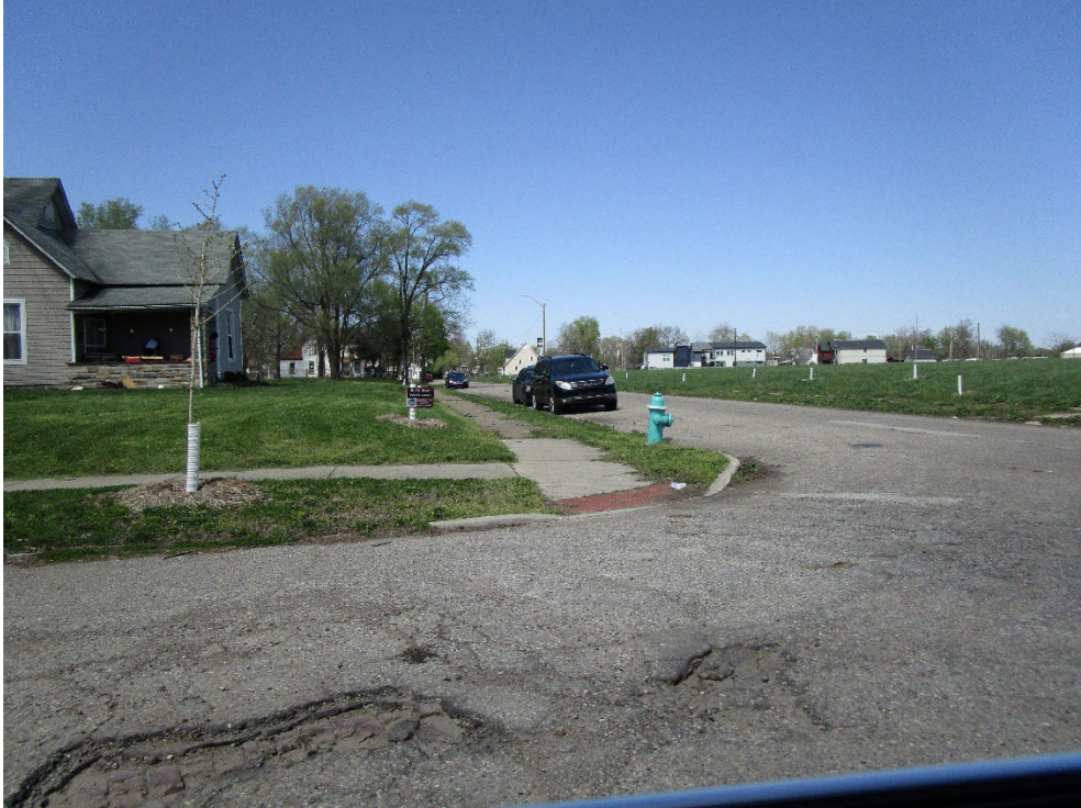
View looking north along Winthrop Avenue