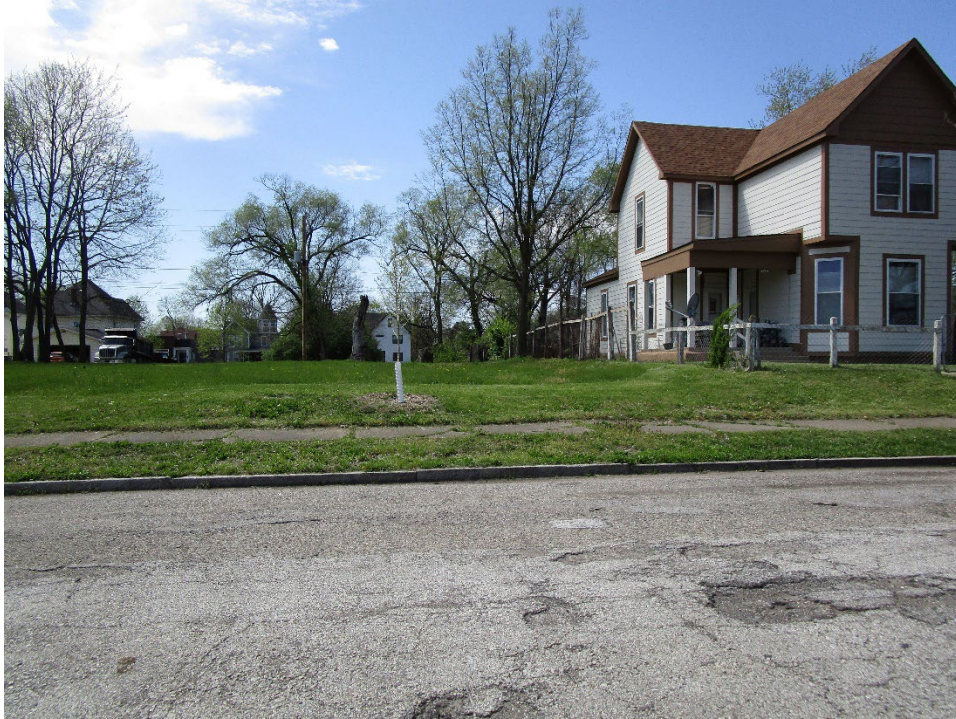
View of site looking west across Winthrop Avenue