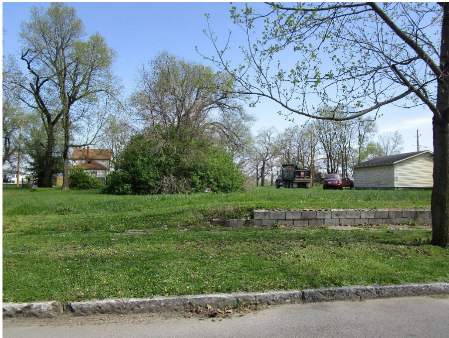
View of site looking east across Guilford Avenue