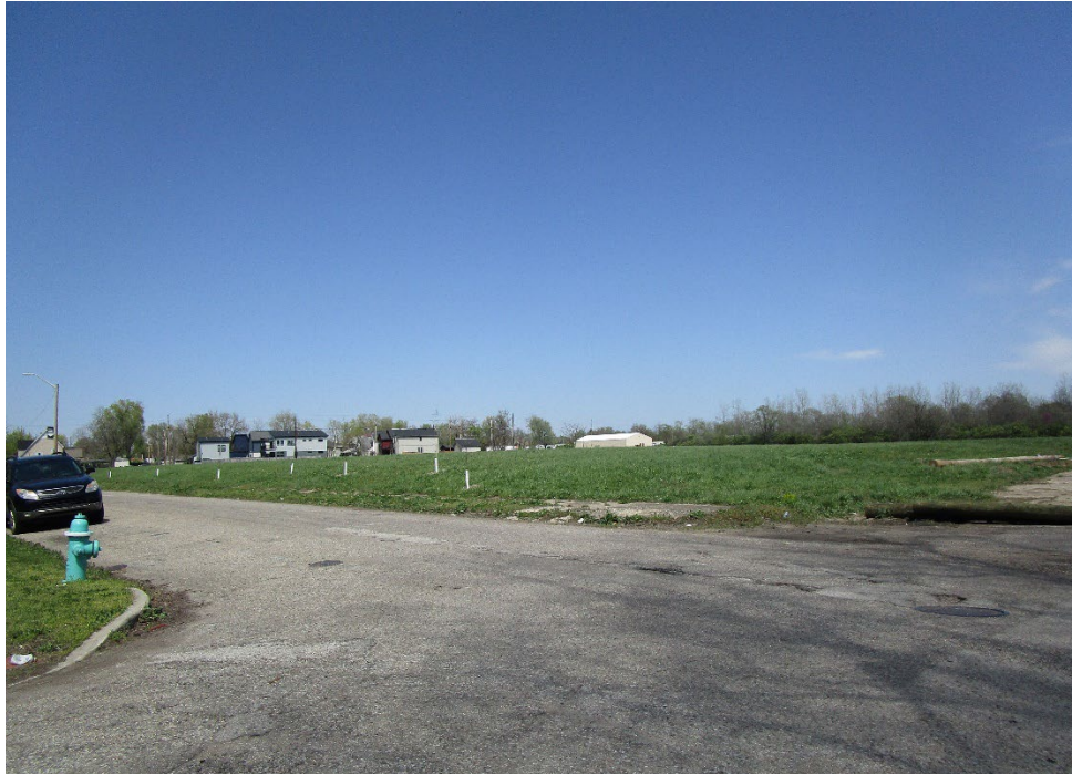
View looking northeast across intersection of Winthrop Avenue and East 27th Street