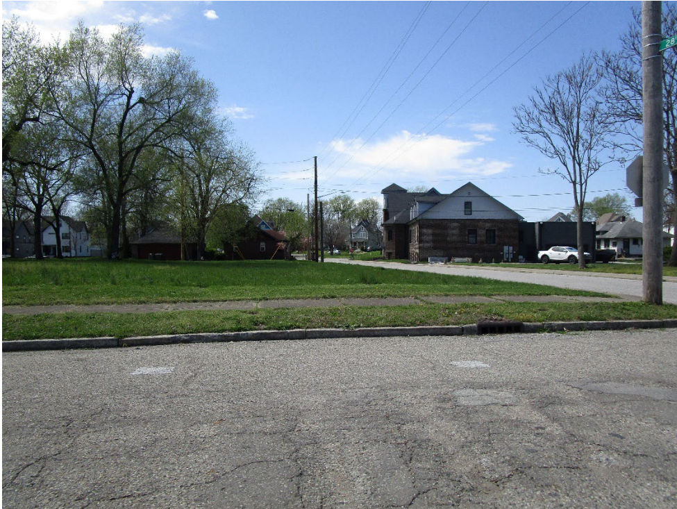
View looking northwest across intersection of Winthrop Avenue and East 28th Street