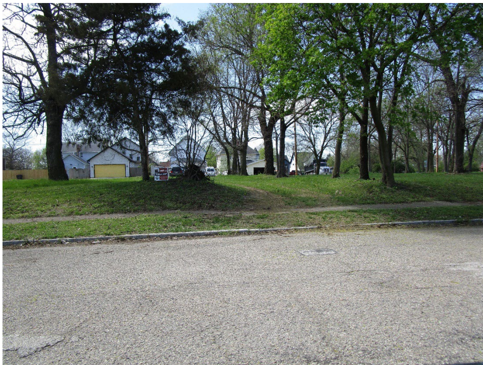
View of site looking west across Winthrop Avenue