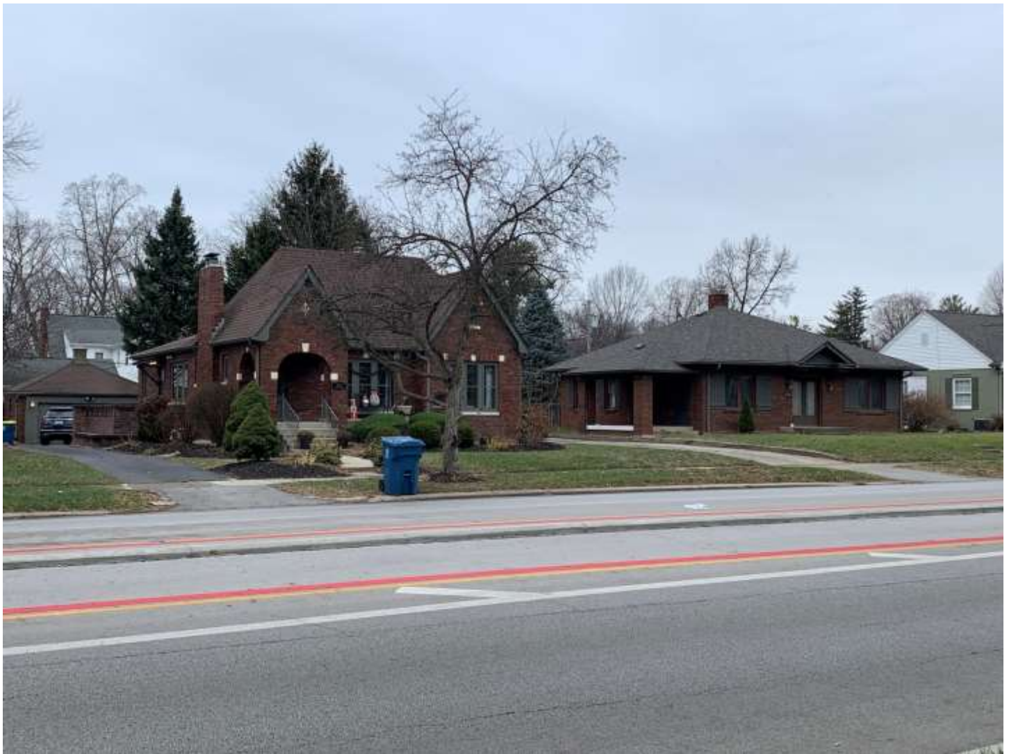
Photo of the single-family dwelling north of the site.