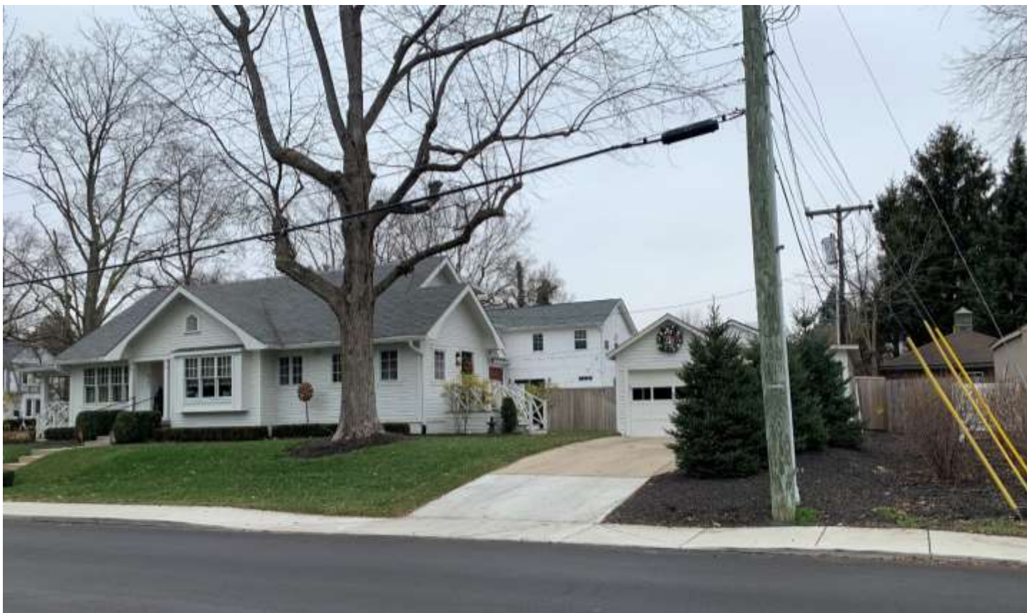
Photo of the single-family dwelling west of the site.