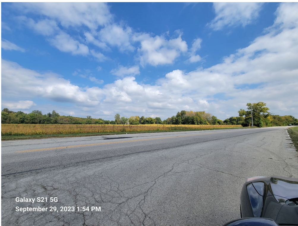
Figure 2 - Subject site looking northeast from 38th St