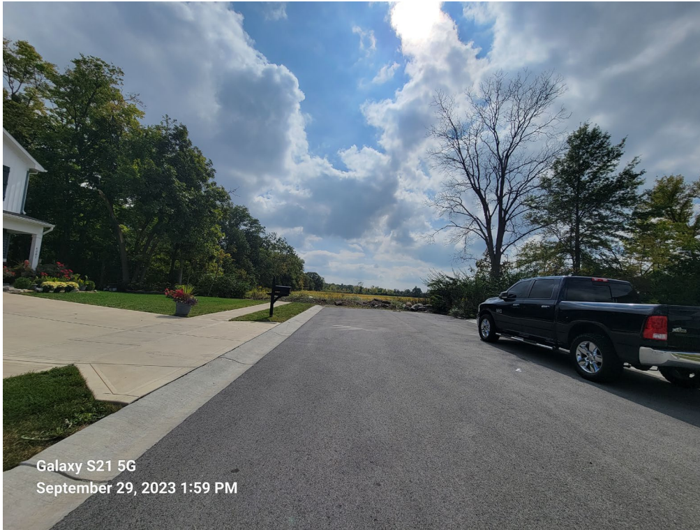
Figure 3 - Stub of Denali Street from the north