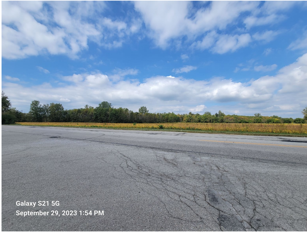
Figure 1 - Subject site looking northwest from 38th St