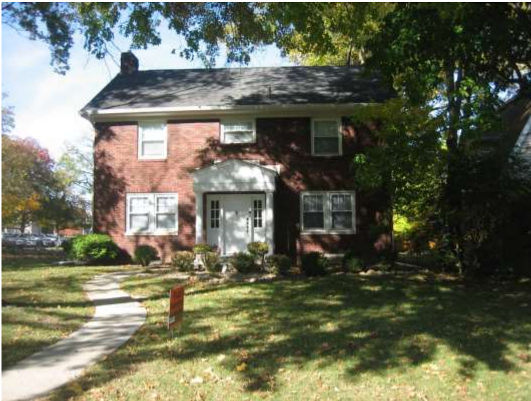
Subject site, existing single-family dwelling, looking north.