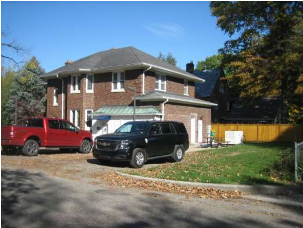
Adjacent university office to the north, looking northeast.