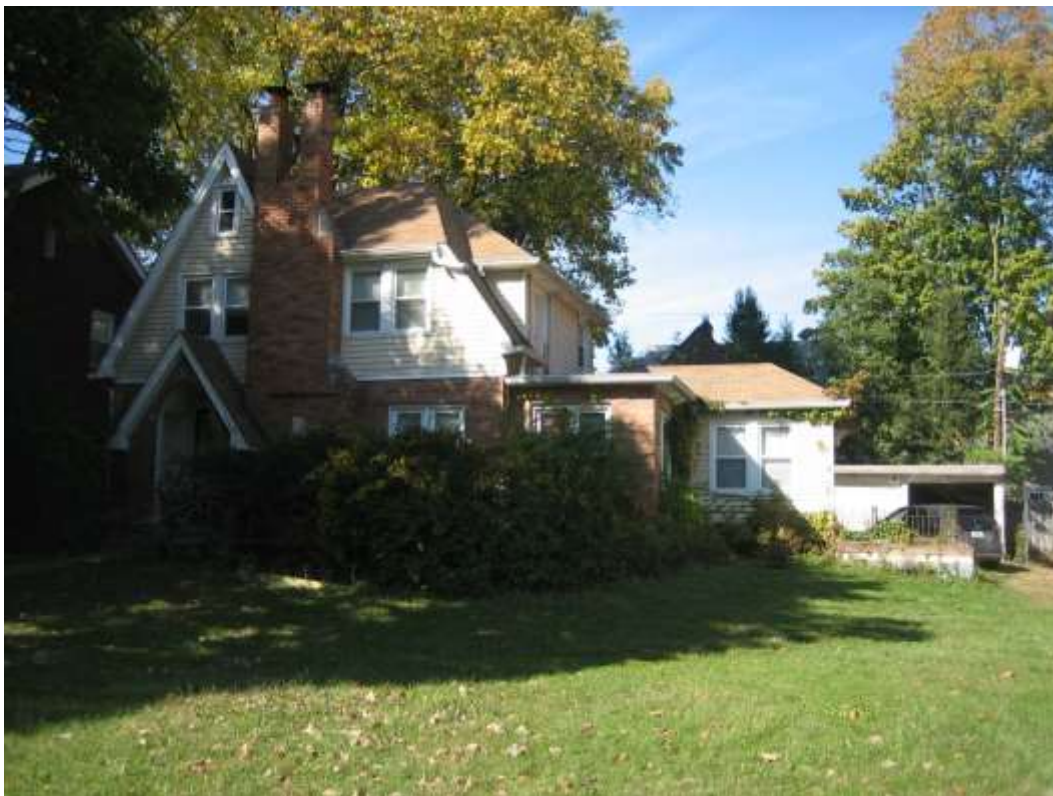
Adjacent single-family dwelling to the east, looking north.