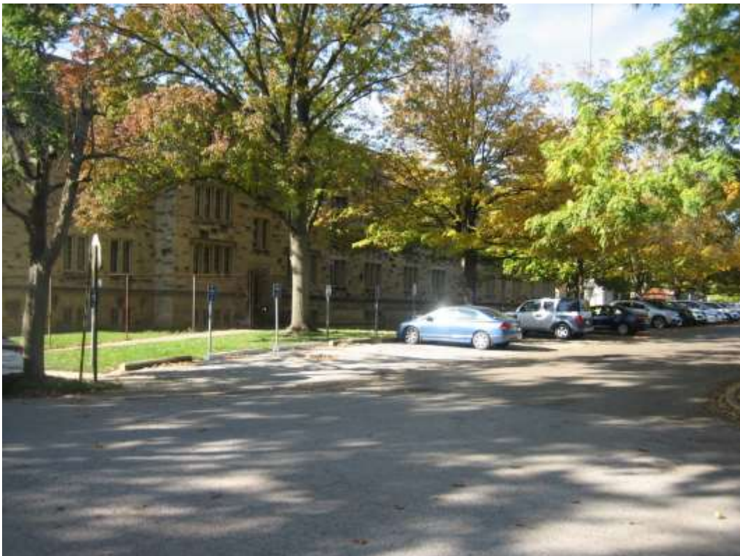
Adjacent university building and parking to the west, looking northwest.