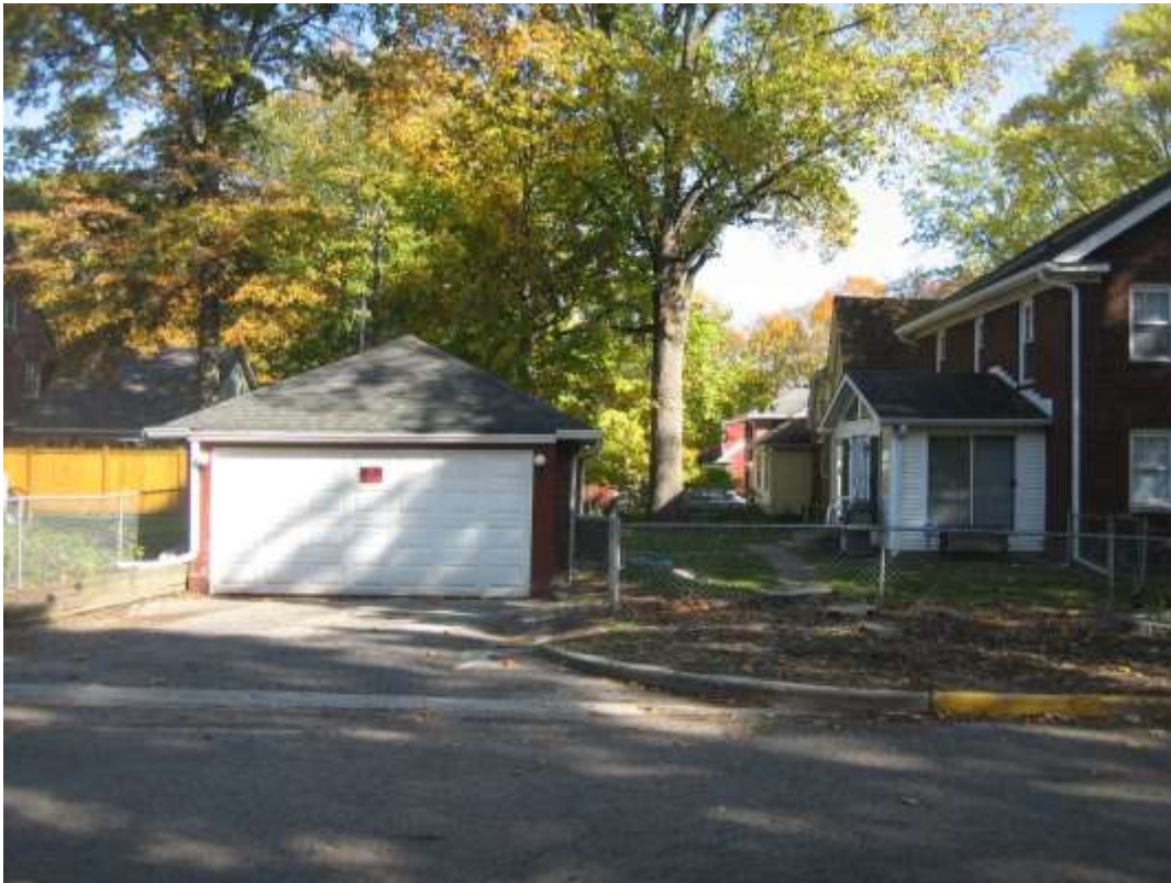
Subject site, existing garage and location for the proposed new garage with a secondary dwelling unit, looking east.