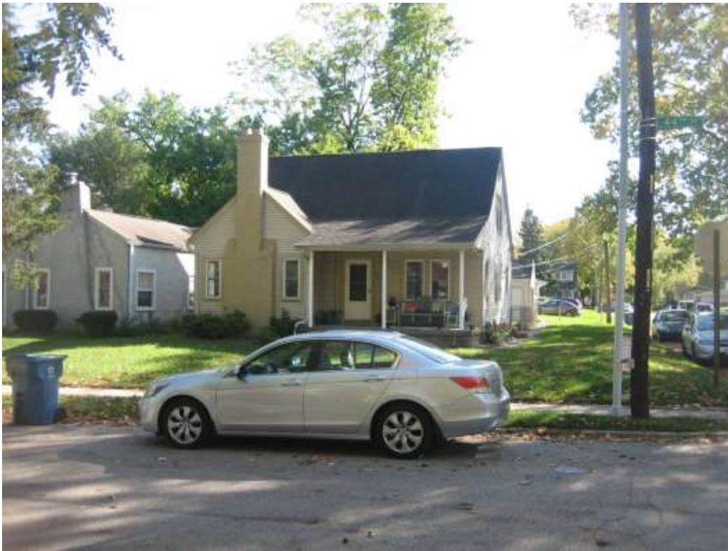
Adjacent single-family dwelling to the south.