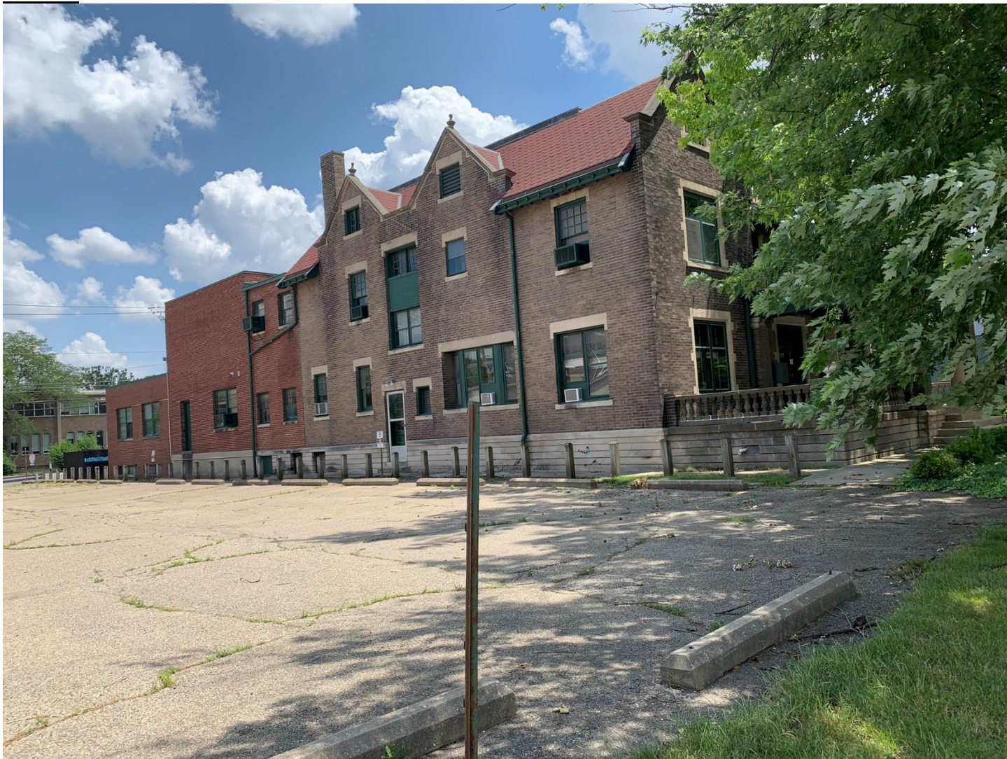
View of site from Meridian Street