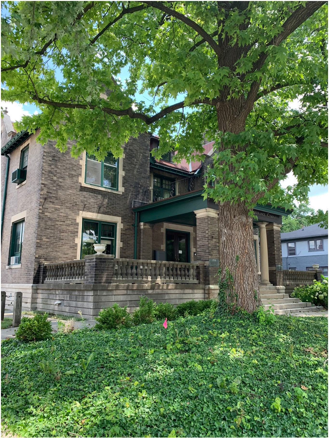
View of building from Meridian Street