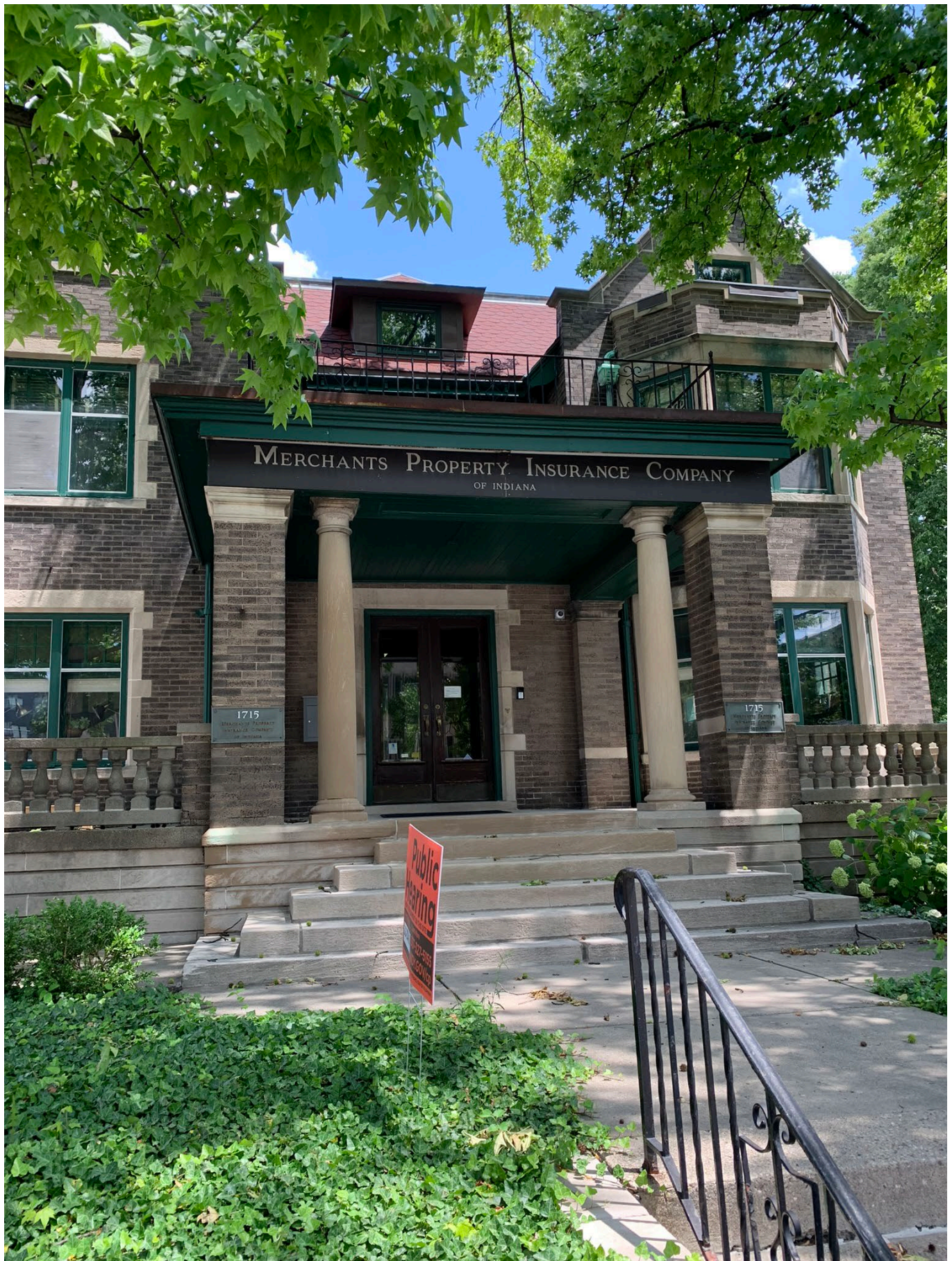
View of front entrance to the building