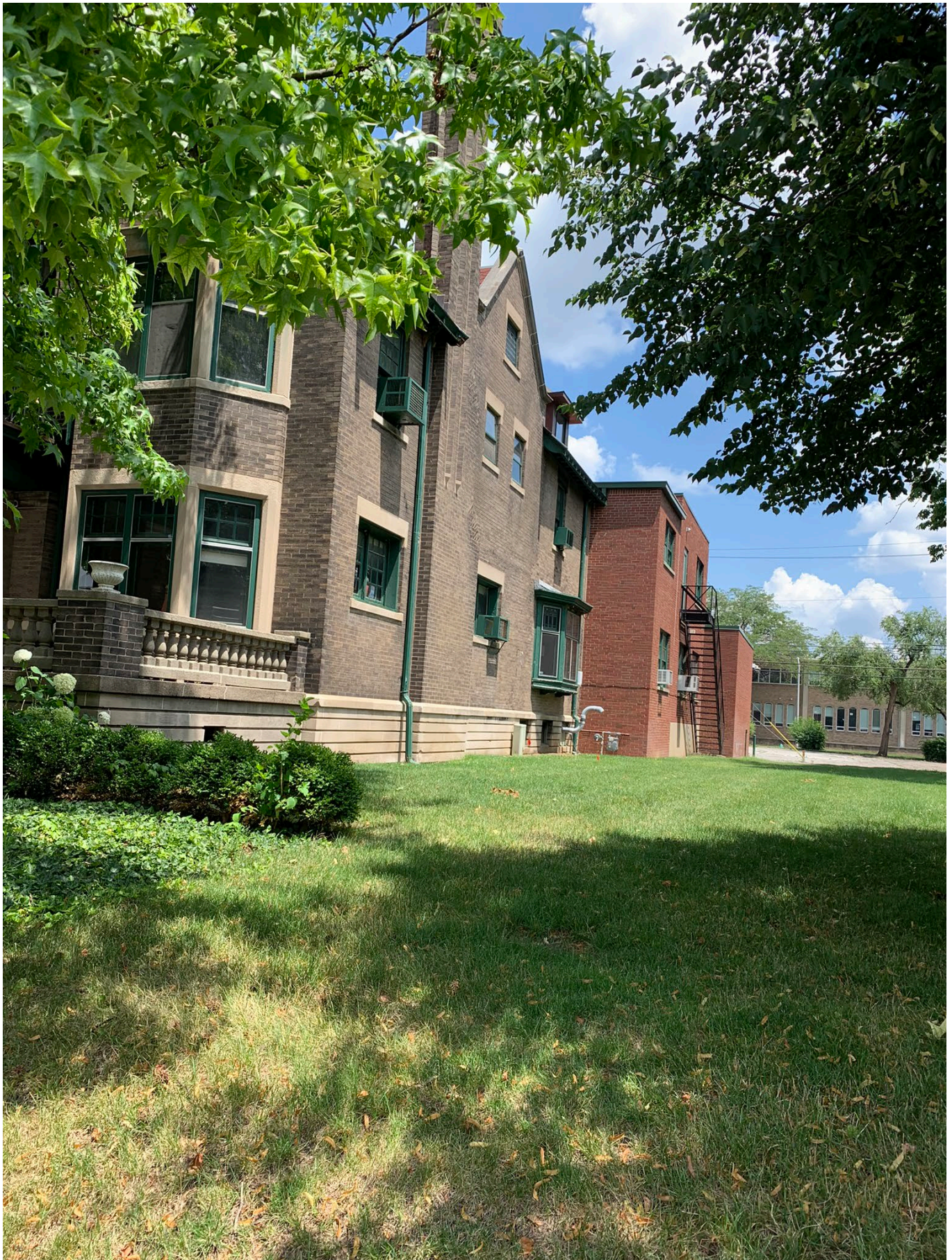
View of south elevation of the building