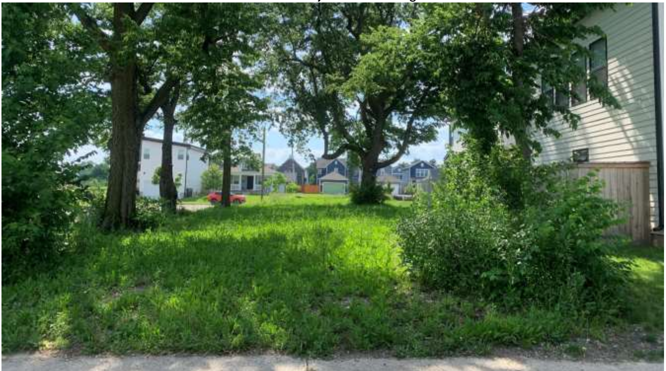
Photo of the subject site looking west.