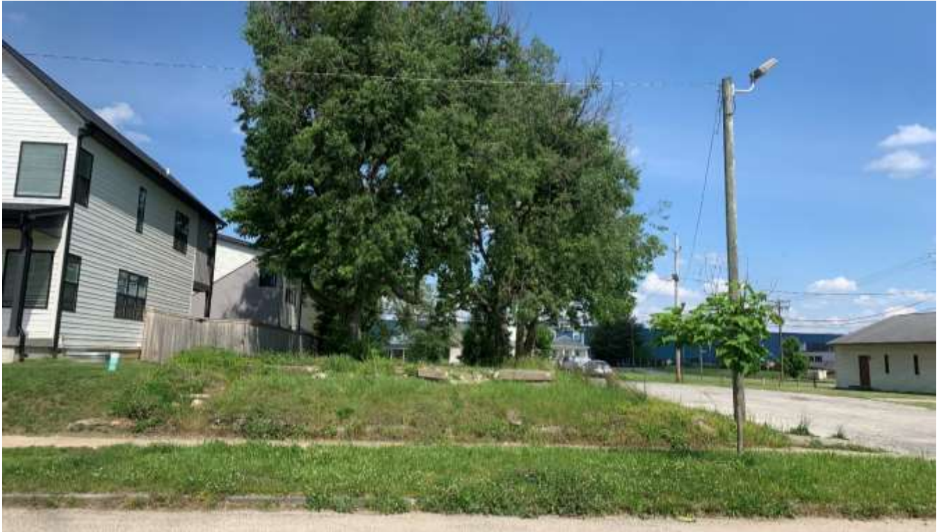
Photo of the subject site looking east.