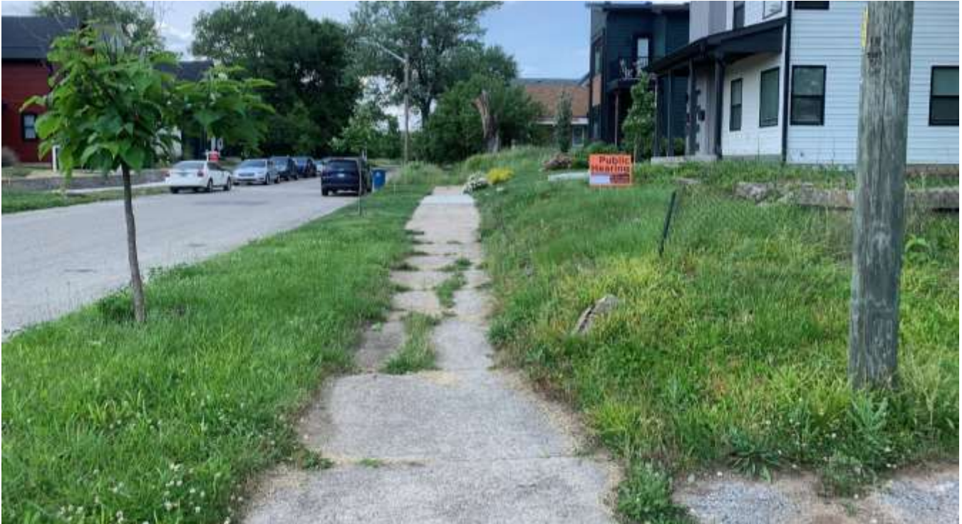
Condition of the sidewalk along the street frontage.