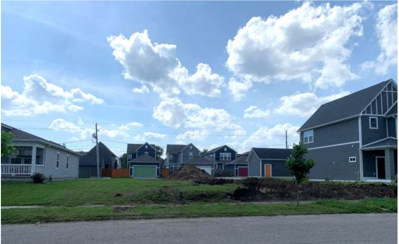
Photo of the undeveloped lots west of the site with one being under construction.