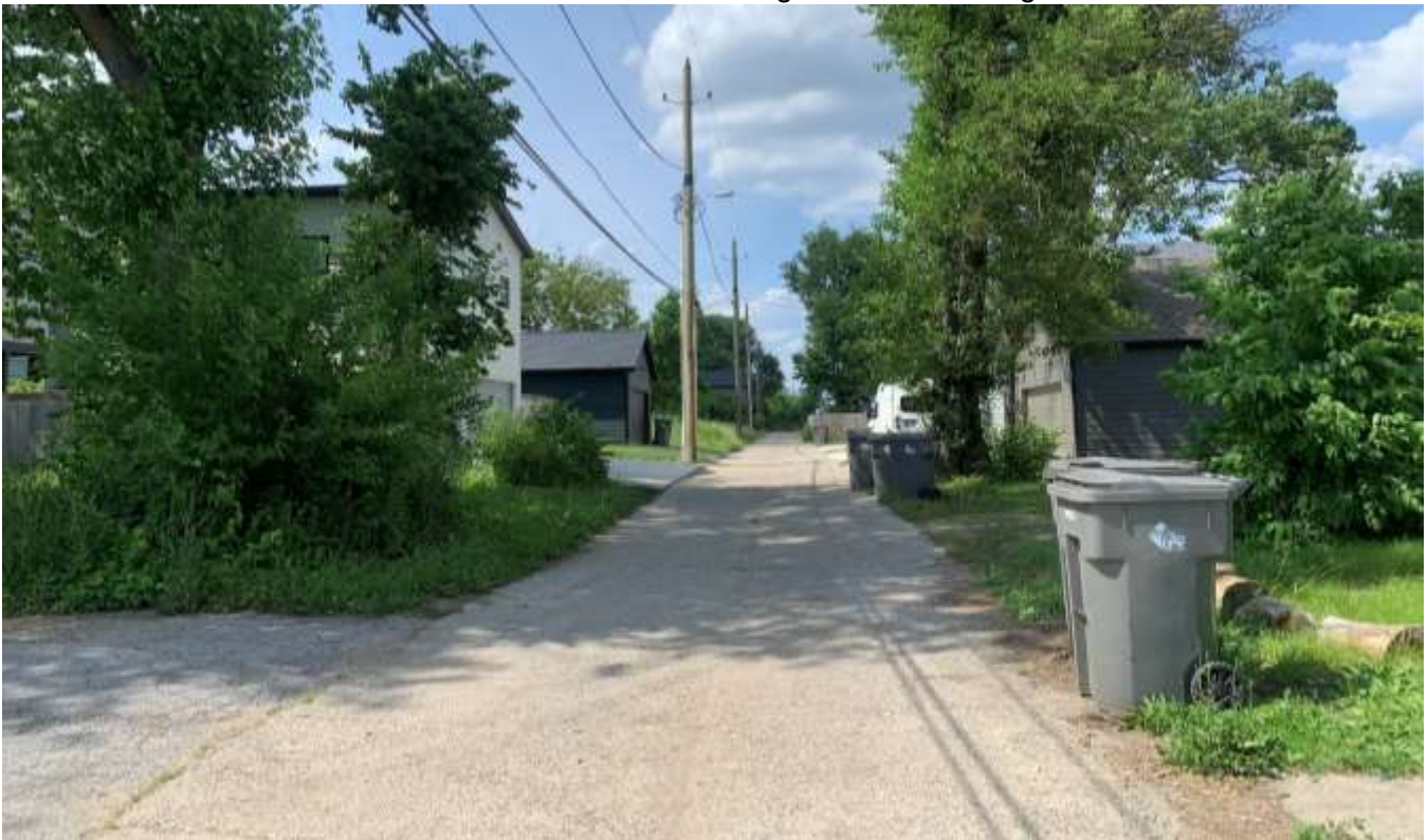
Photo of the alley east of the site.