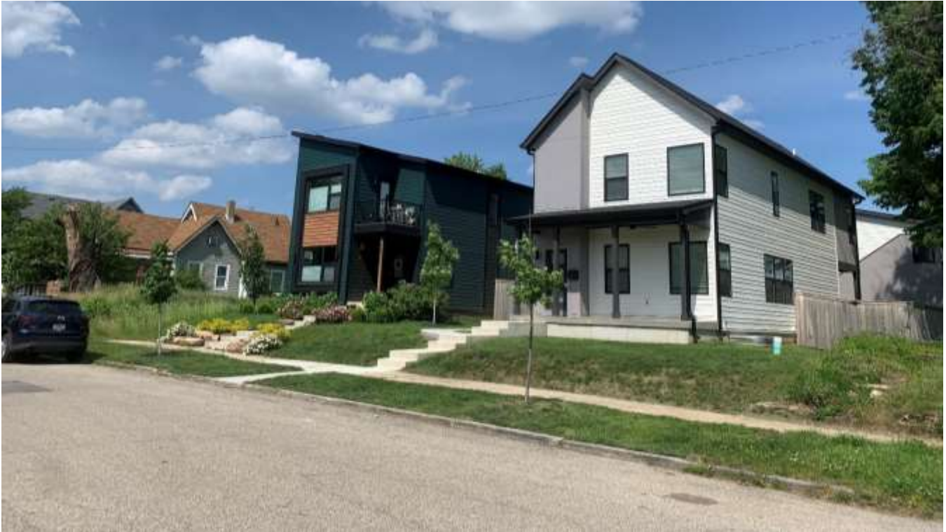
Photo of single-family dwellings north of the site.