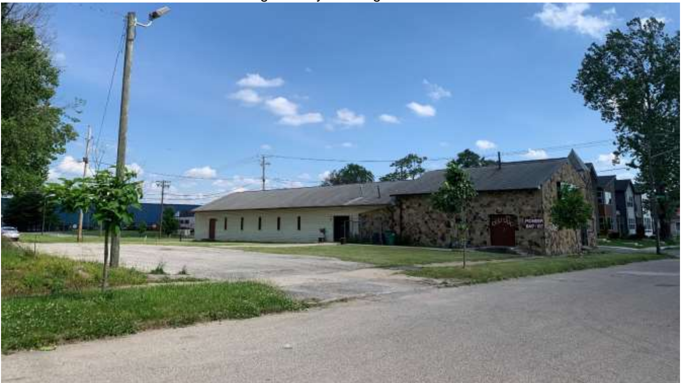
Photo of the church and associated parking lot south of the site.