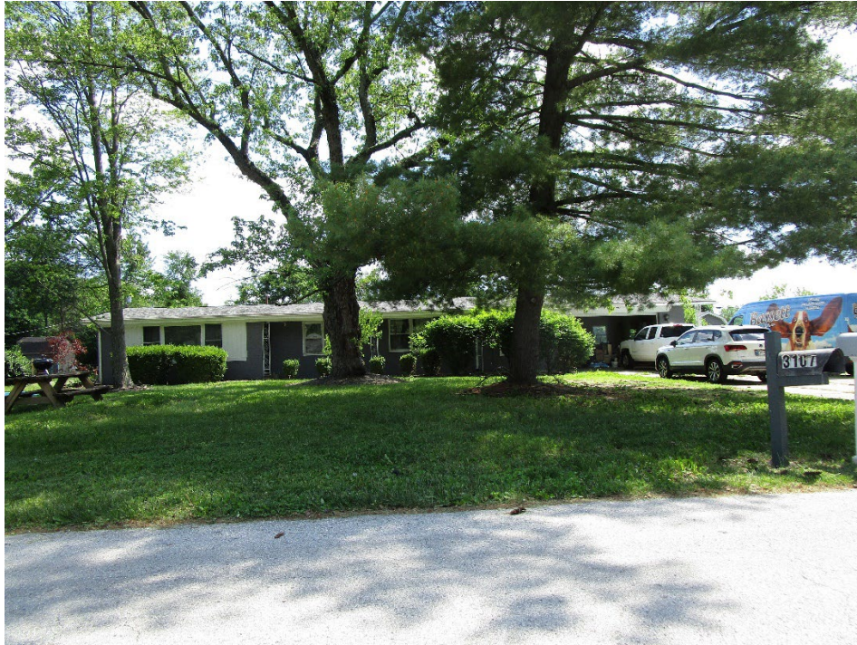
View of proposed Lot 2 looking south across East Sumner Avenue