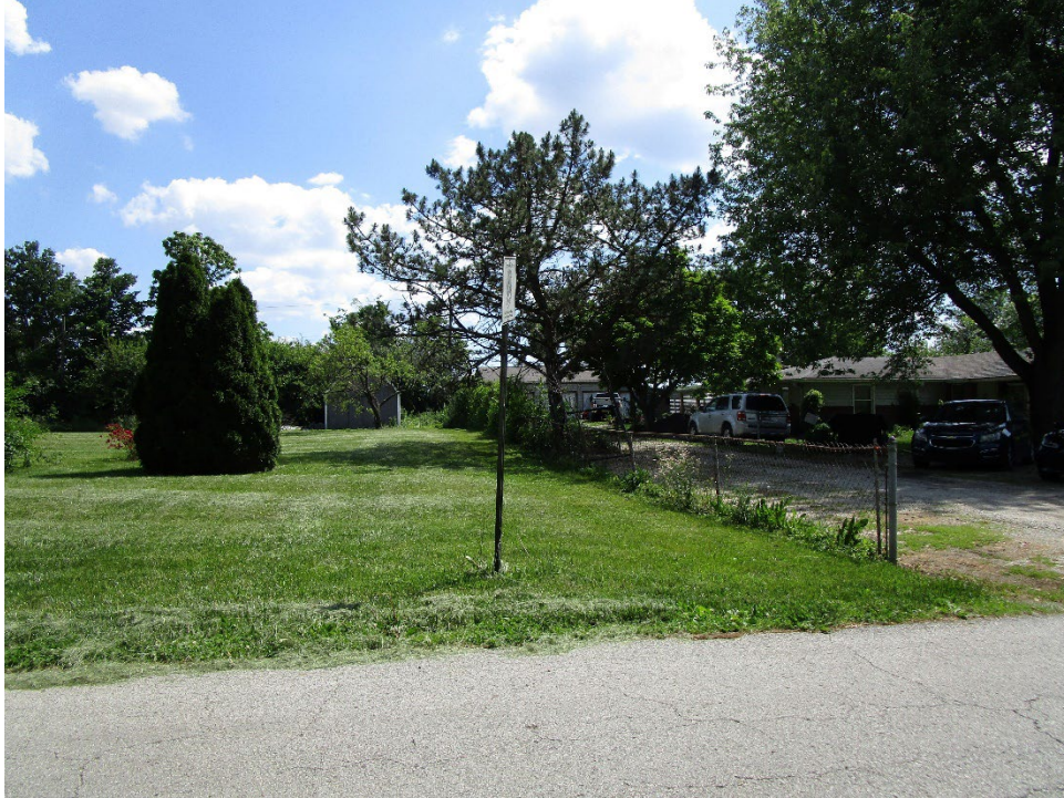
View of western boundary looking south across East Sumner Avenue