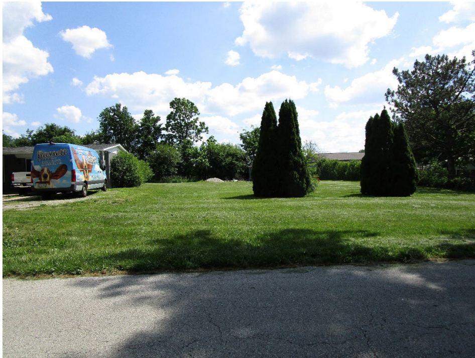
View of proposed Lot 1 looking south across East Sumner Avenue