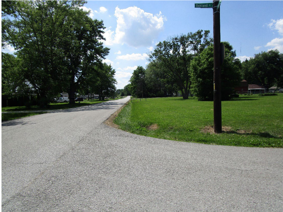
View looking west along East Sumner Avenue