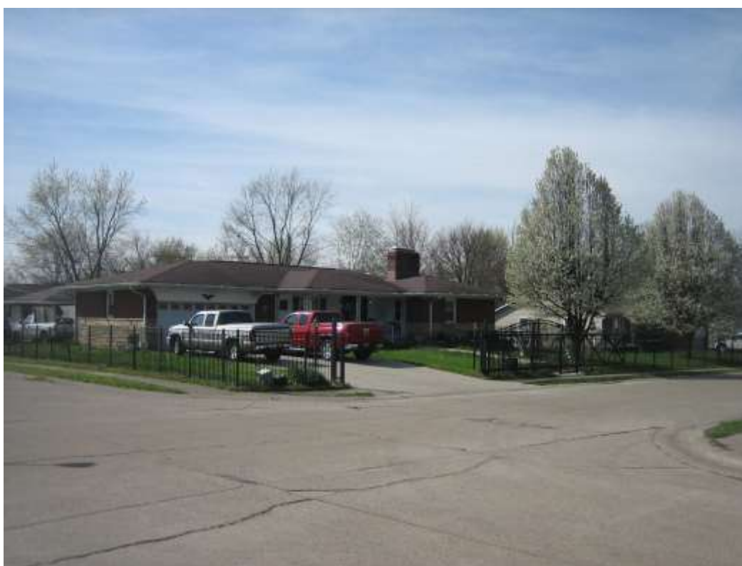
Adjancet single-family dwellign to the west, with existing curb cut that pre-dates current Ordiance, looking northwest.