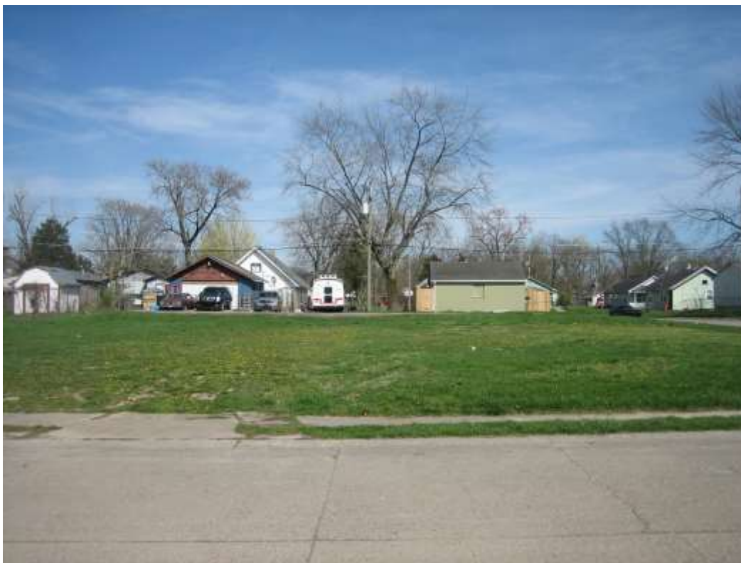
Subject site looking east.