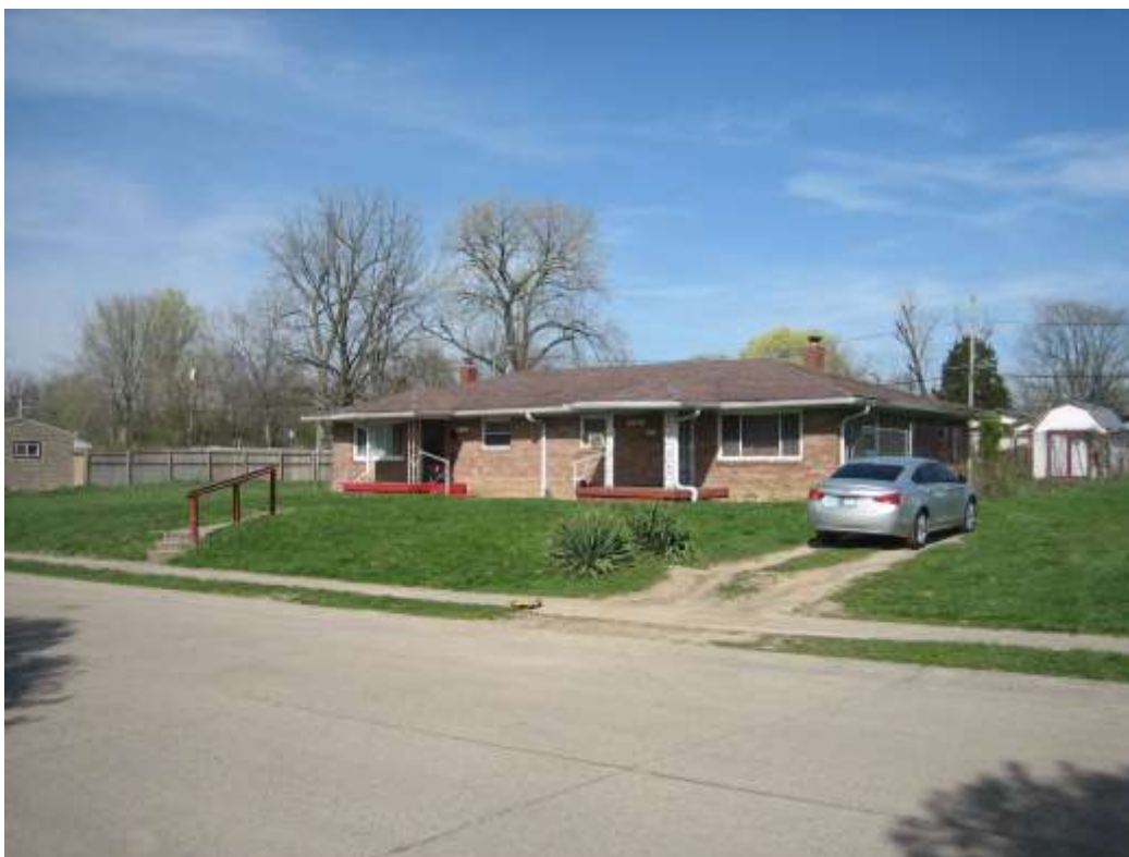
Adjacent duplex to the north (with non-permitted curbcut), looking east.