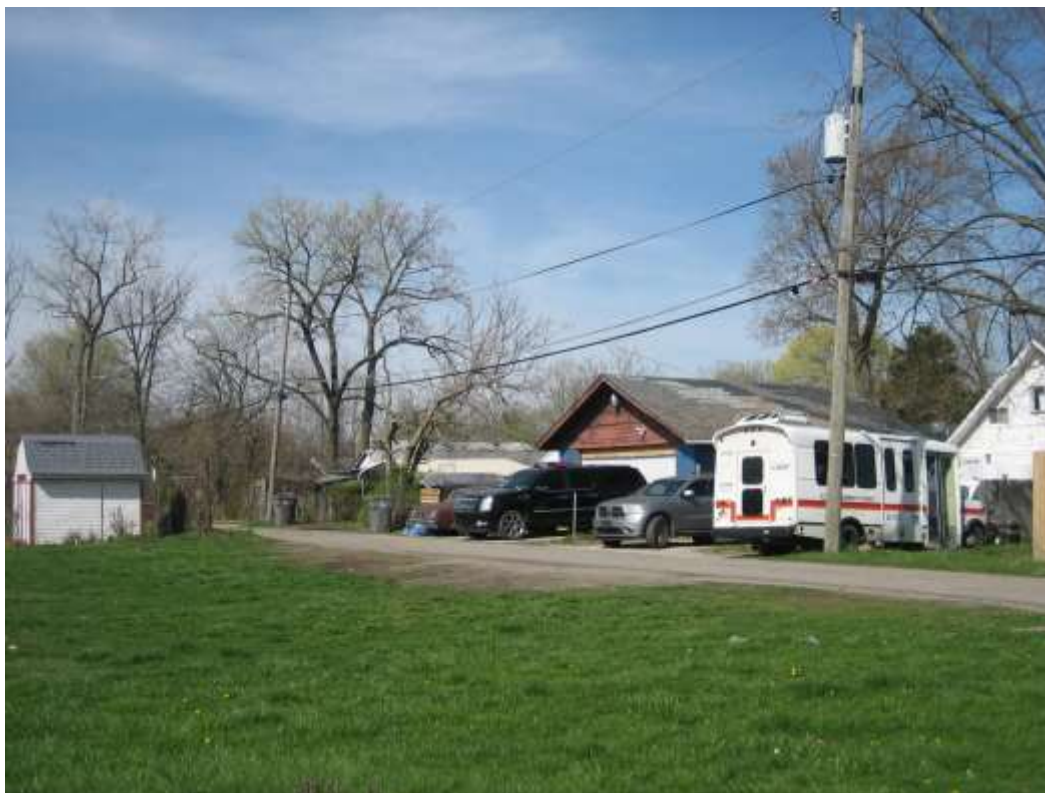
Existing improved north-south alley to the rear of subject site, with adjacent properties having alley access as well.