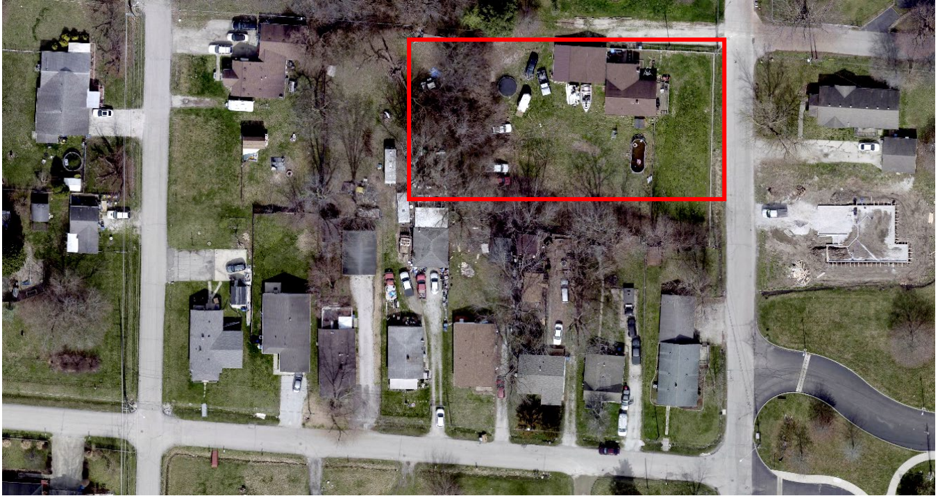
Exhibit 1: Aerial image of 1502 Dunlap Avenue and the surrounding area from DMD's ArcGIS. 1502 Dunlap Avenue is shown in red.