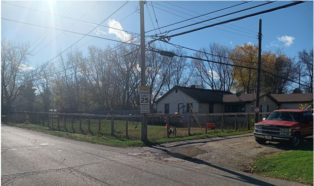
Exhibit 4: Looking South 1502 Dunlap Avenue.