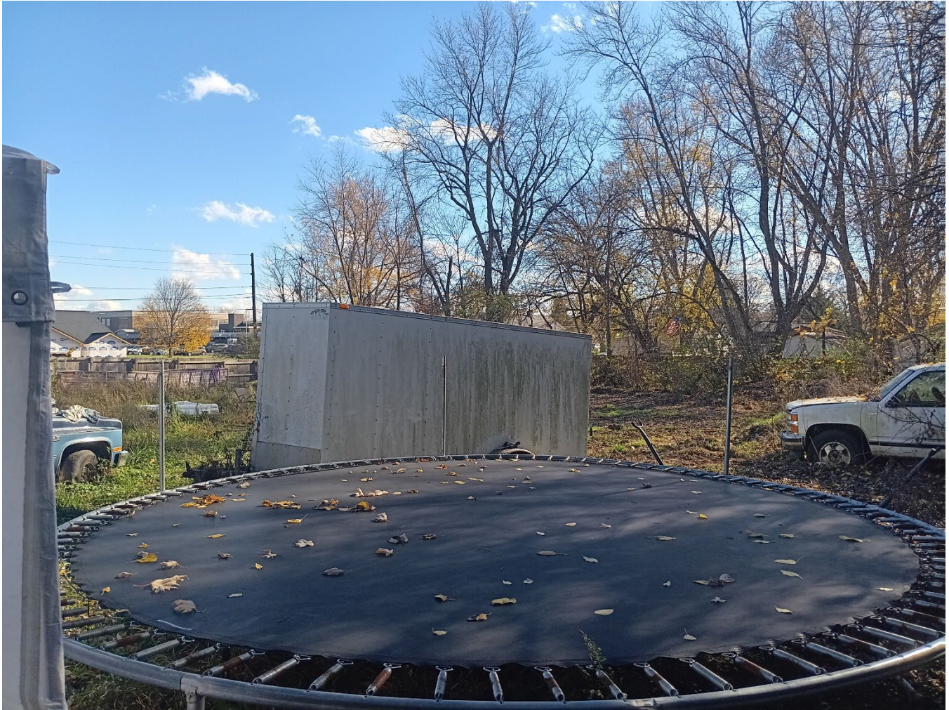
Exhibit 6: General area where the two dwellings will be built if this plat petition is approved.