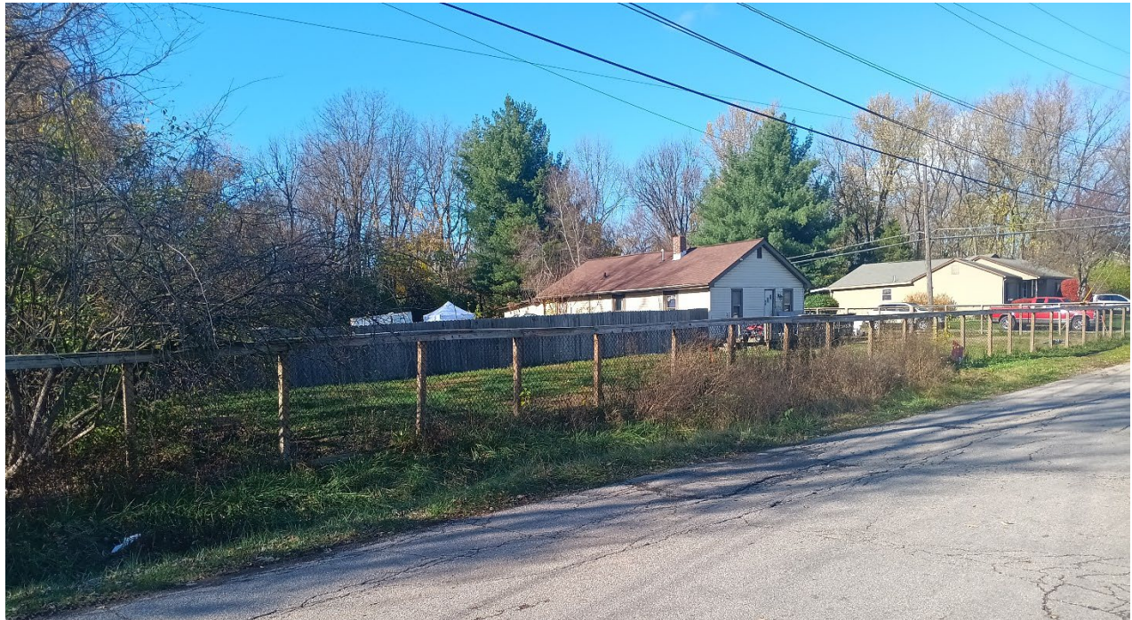
Exhibit 5: Looking North 1502 Dunlap Avenue.