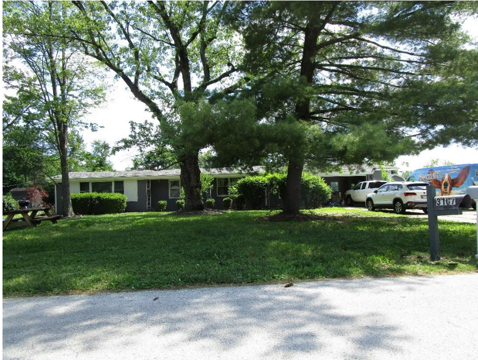
View of proposed Lot 2 looking south across East Sumner Avenue