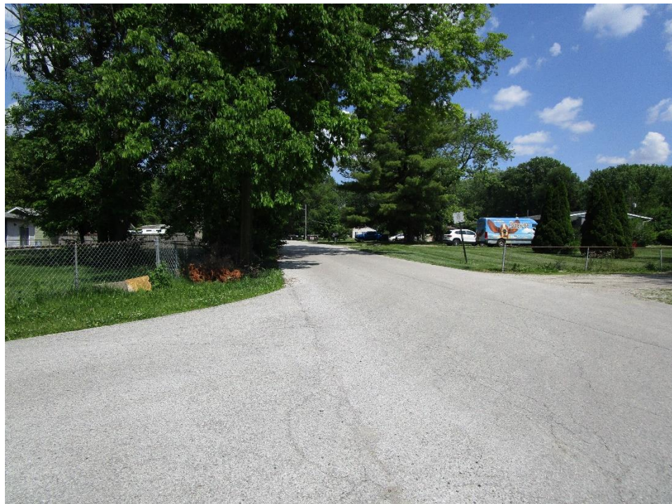
View looking east along East Sumner Avenue