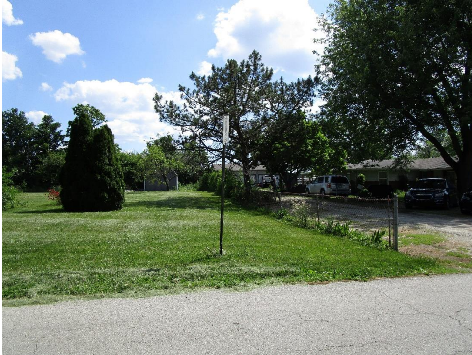
View of western boundary looking south across East Sumner Avenue