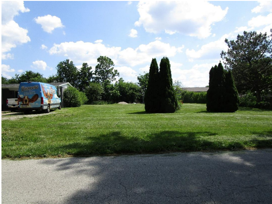
View of proposed Lot 1 looking south across East Sumner Avenue