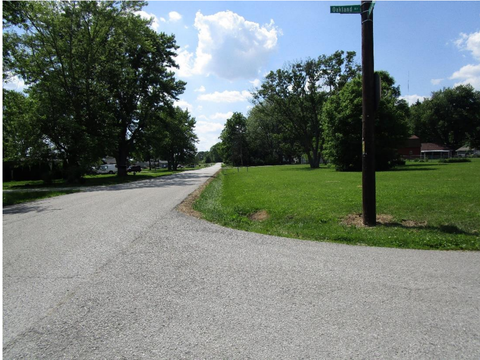
View looking west along East Sumner Avenue