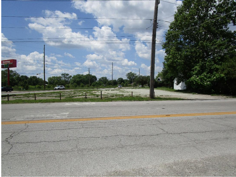
View from site looking west across South Arlington Avenue