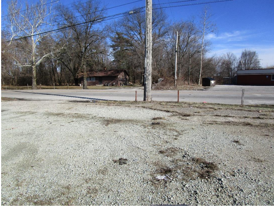
View of site looking northeast across South Arlington Avenue