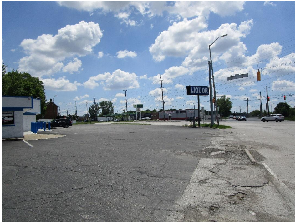
View from site looking south at adjacent property