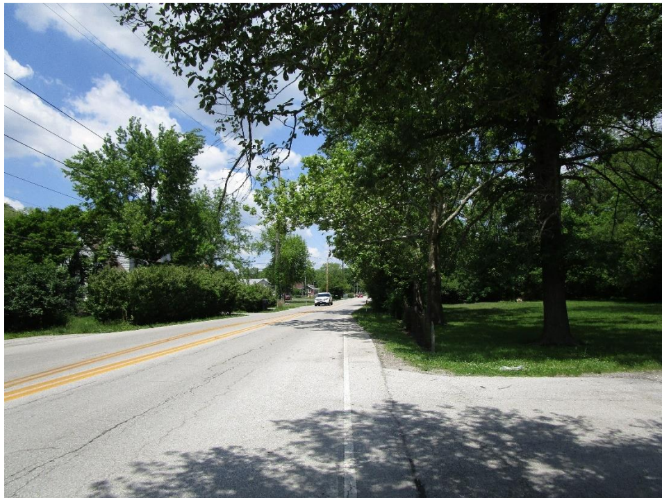
View looking north along South Arlington Avenue