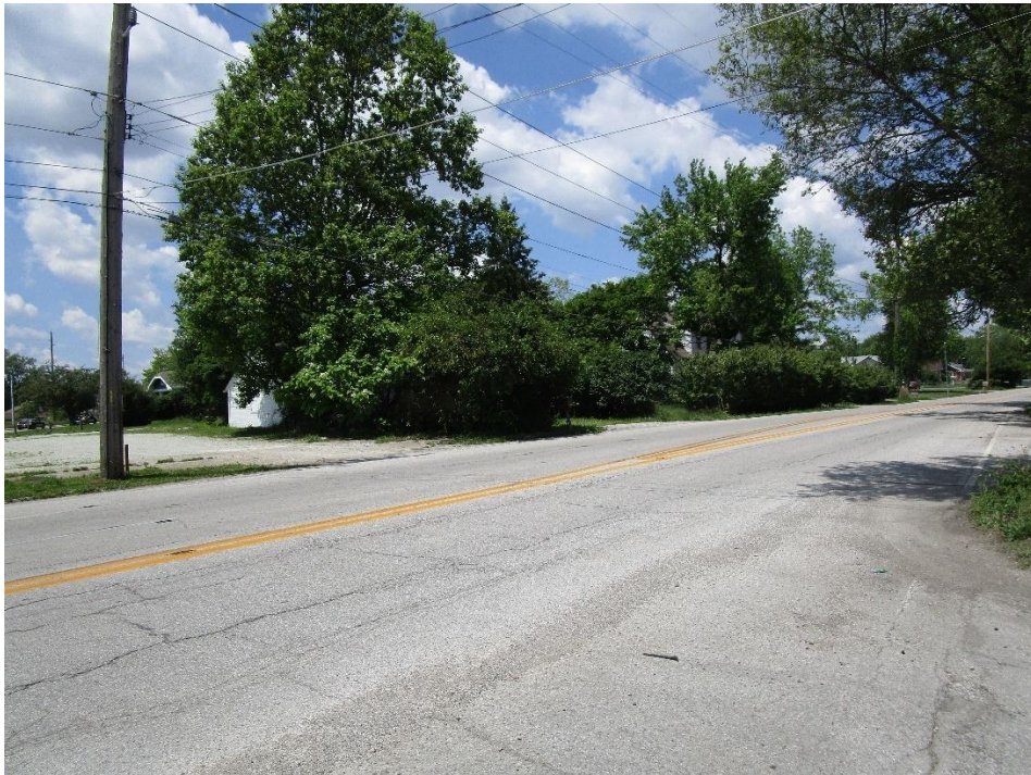
View from site looking northwest across South Arlington Avenue