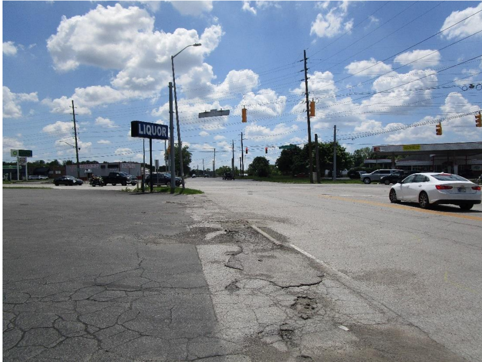
View looking south along South Arlington Avenue