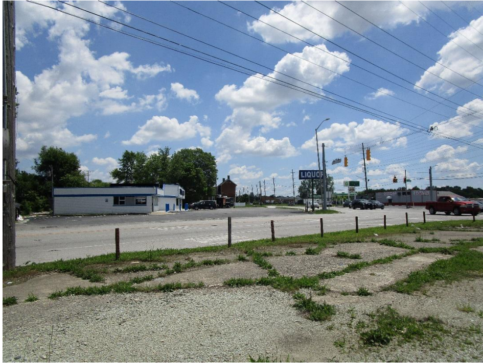
View looking east at intersection of South Arlington Avenue and Southeastern Avenue