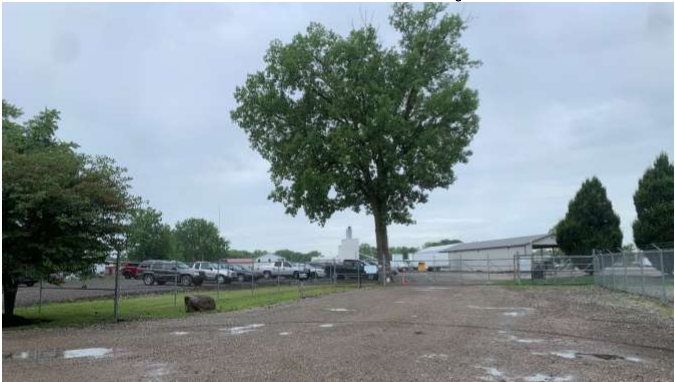
Photo of the concrete contractor business to the west.