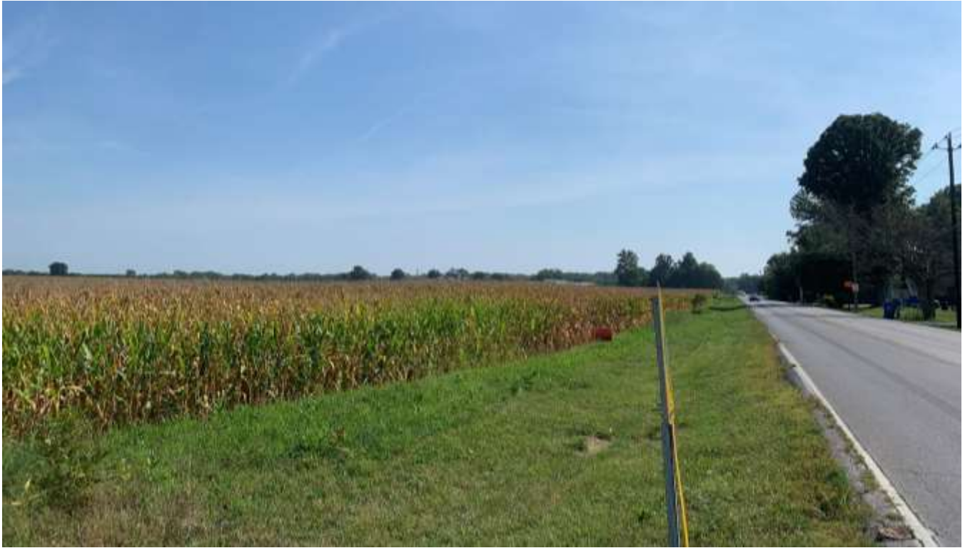
Photo of Mooresville Road looking south.