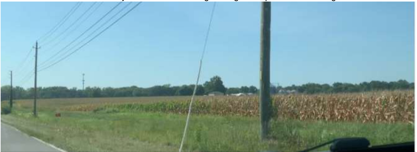
Photo of the subject site street frontage along Southport Road looking west.