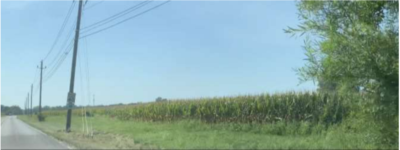
Photo of the subject site street frontage along Southport Road looking west.