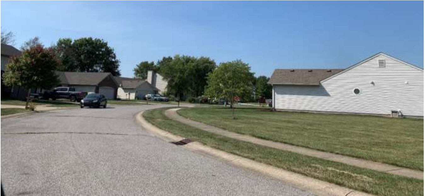
Photo of the single-family dwellings east of the site on Jackie Court.