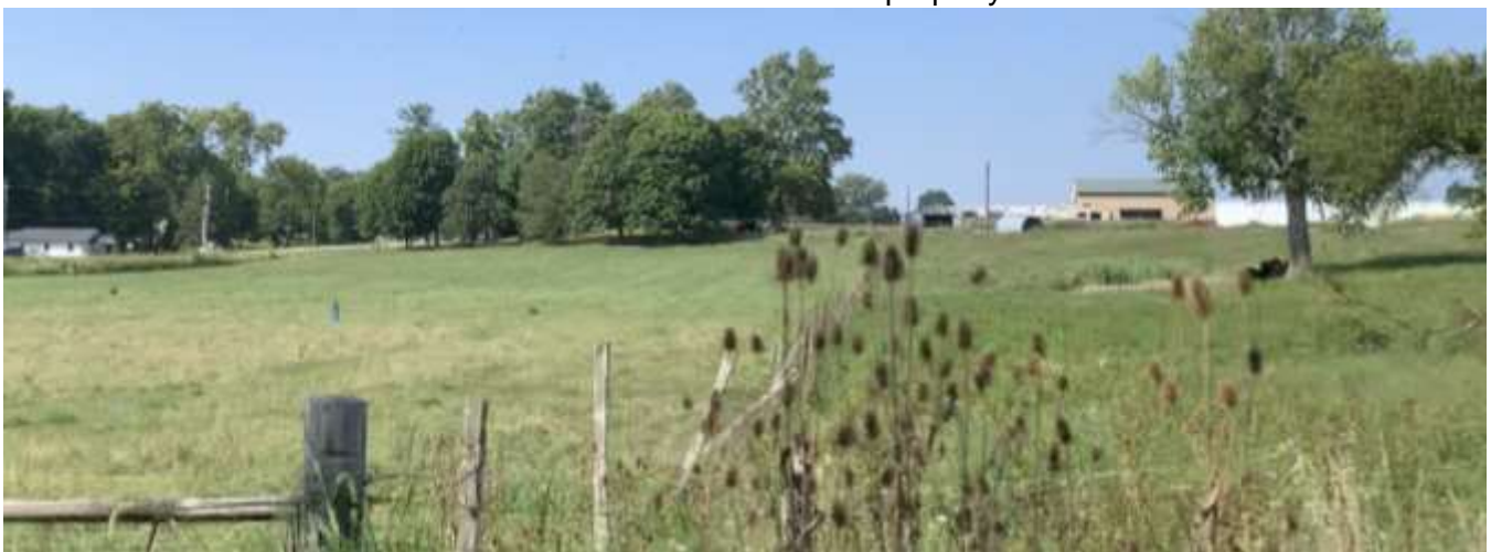
Photo of the site west of the property.