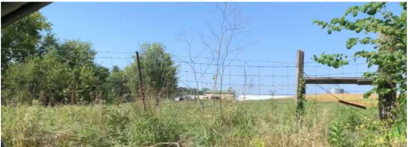
Photo of the site west of the property.