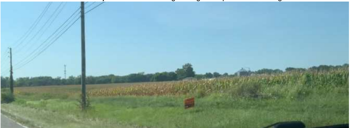
Photo of the subject site street frontage along Southport Road looking west.