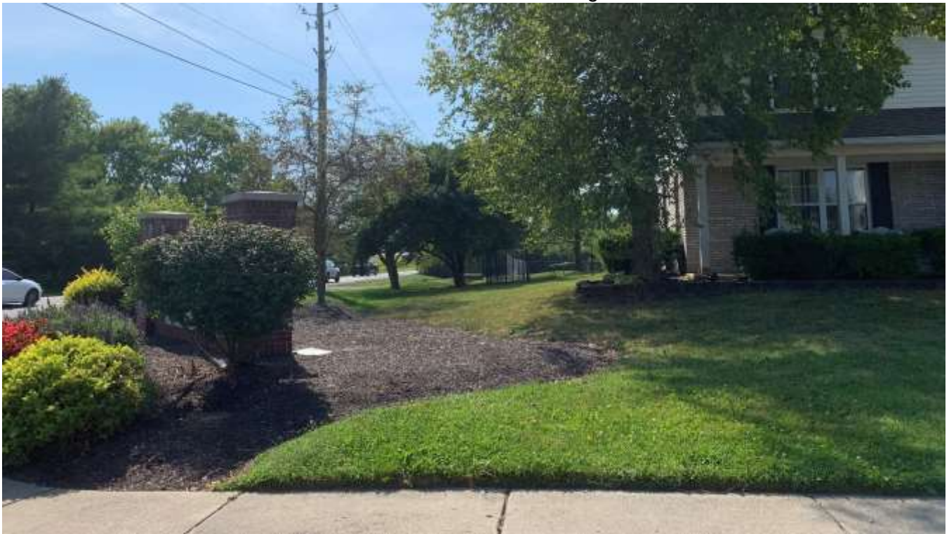
Street frontage of the subdivision east of the site looking west on Southport Road.