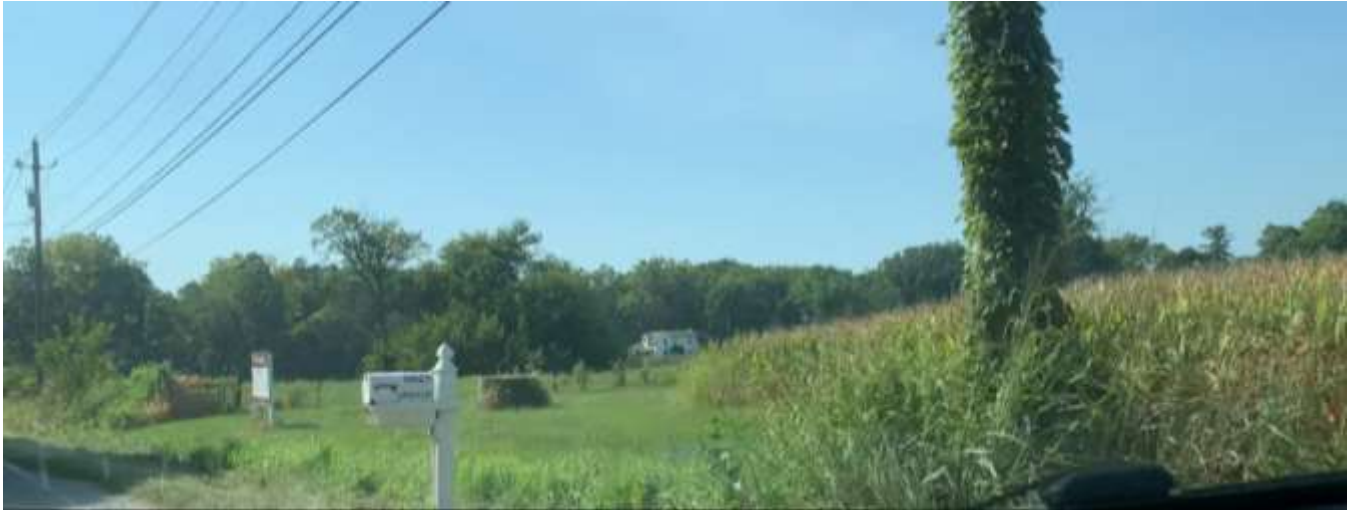
Photo of the subject site street frontage along Southport Road looking west.