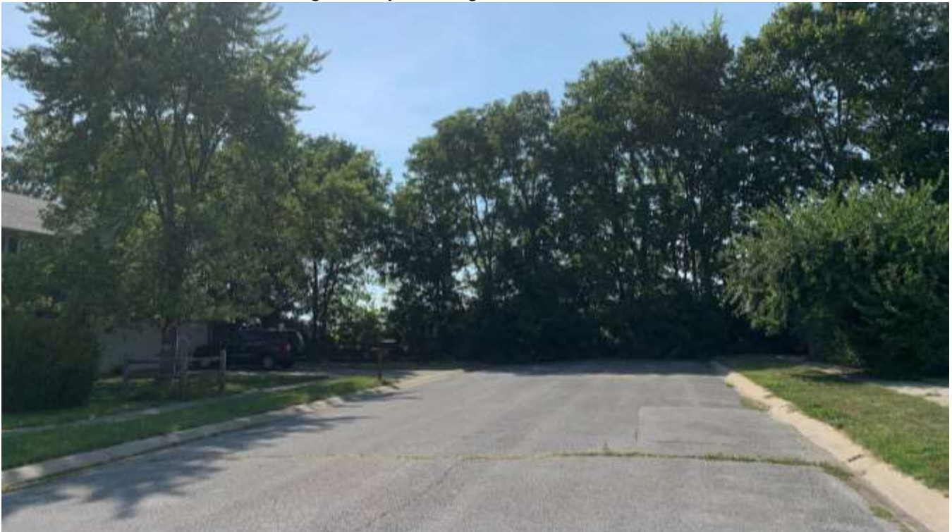
Photo of Denise Drive located northeast of the subject site looking west.