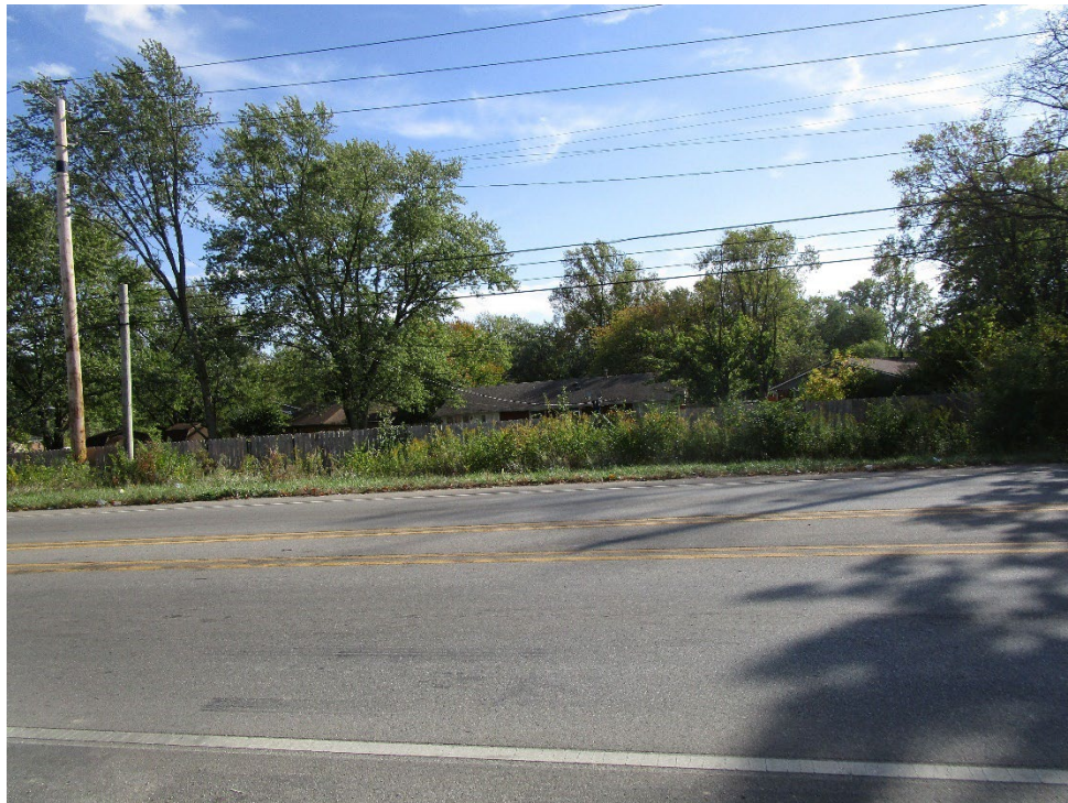
View from site looking south across East 21 st Street