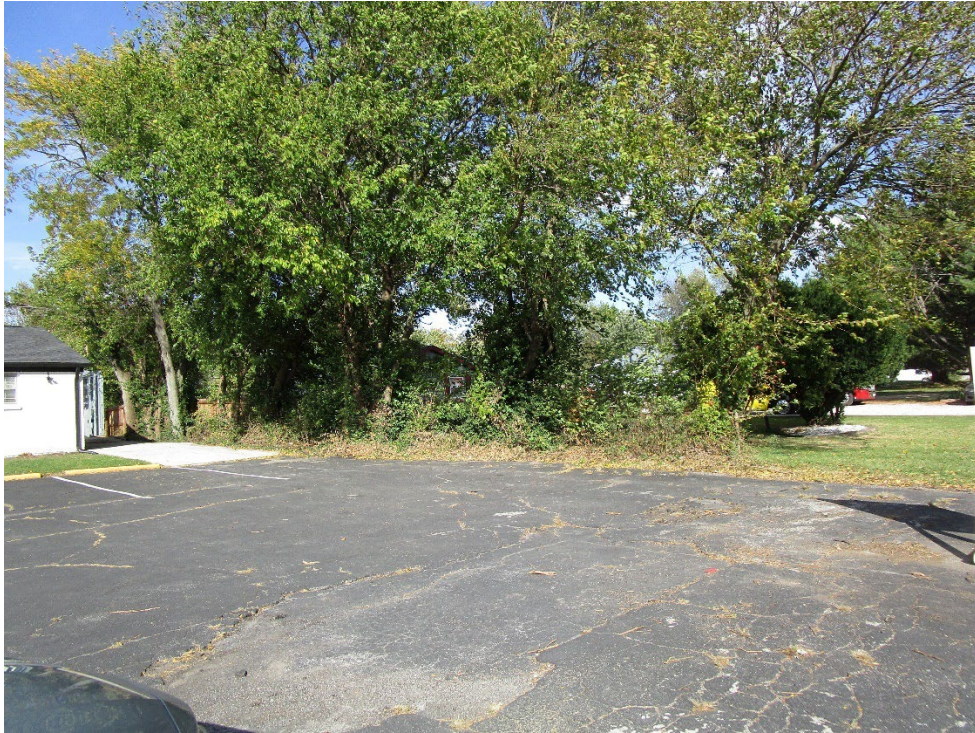
View of site looking northeast