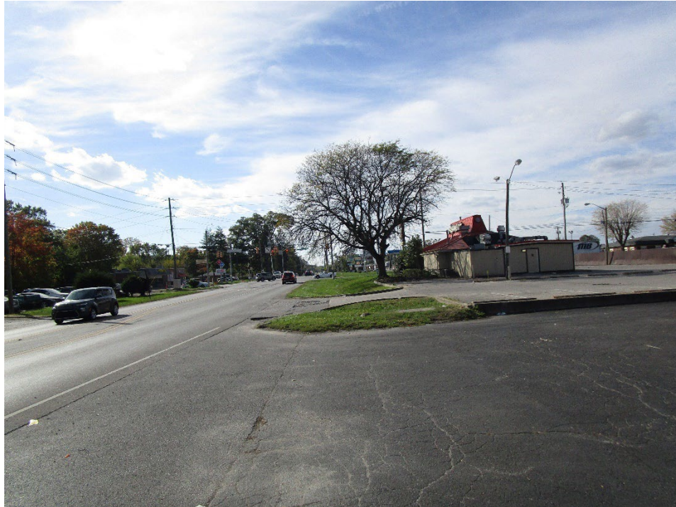
View looking west along East 21 st Street