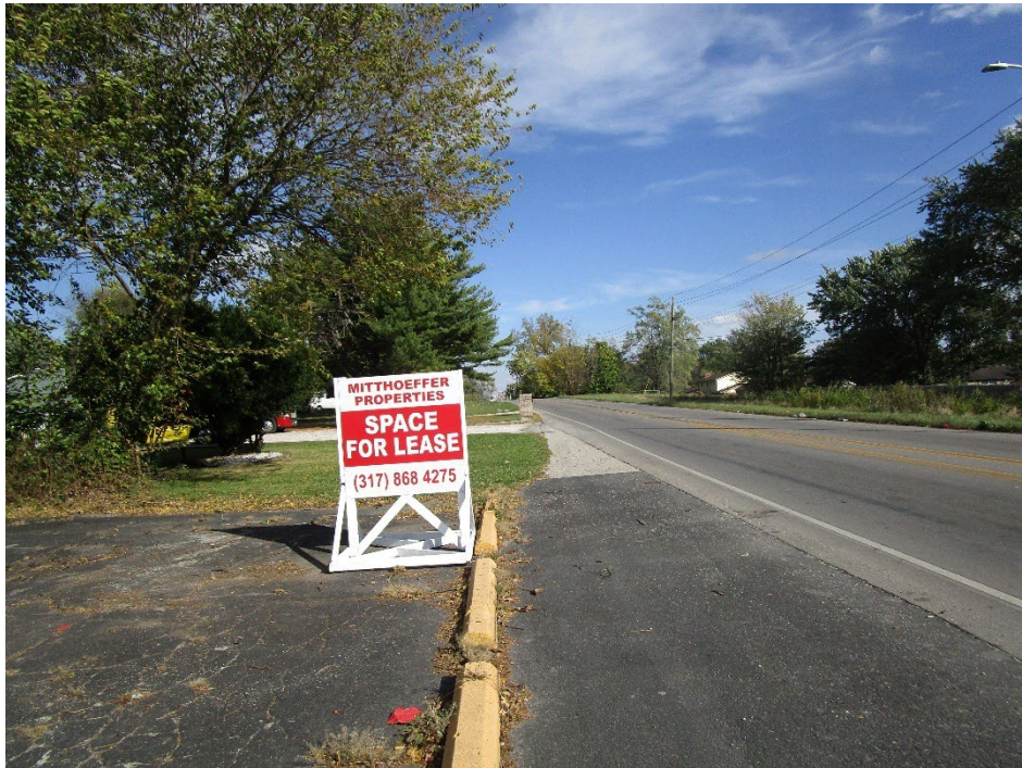
View looking east along East 21 st Street