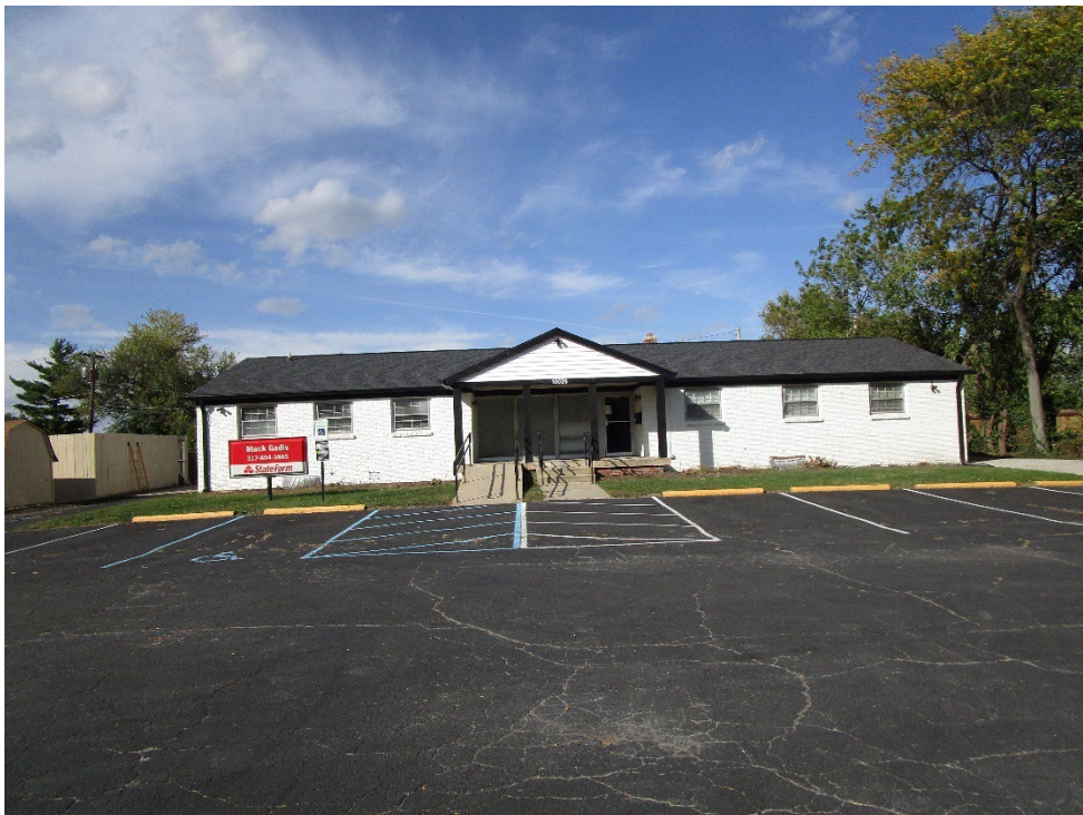
View of site looking north