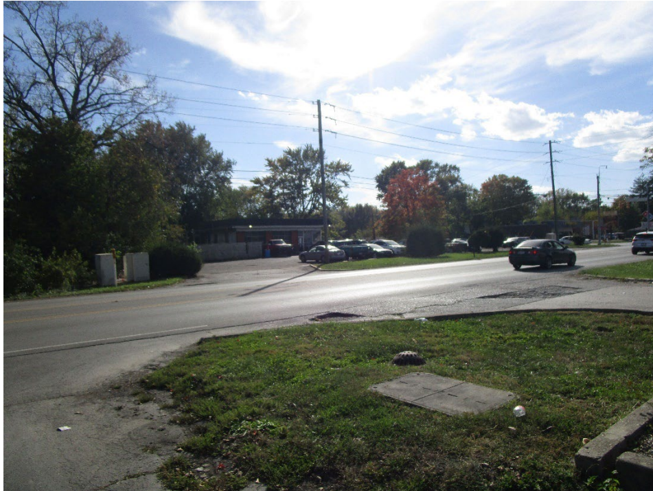
View from site looking southwest across East 21 st Street