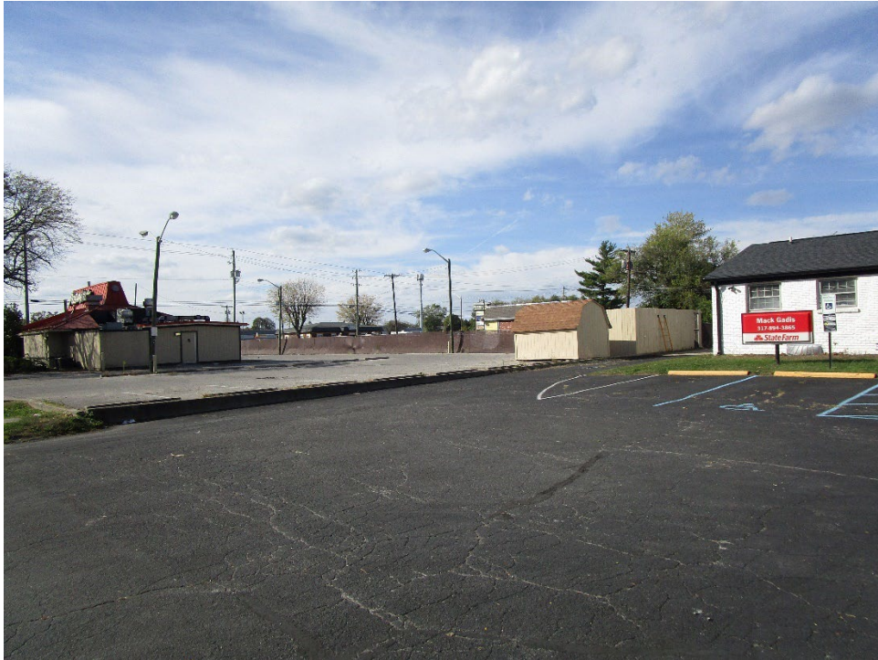
View of site looking northwest