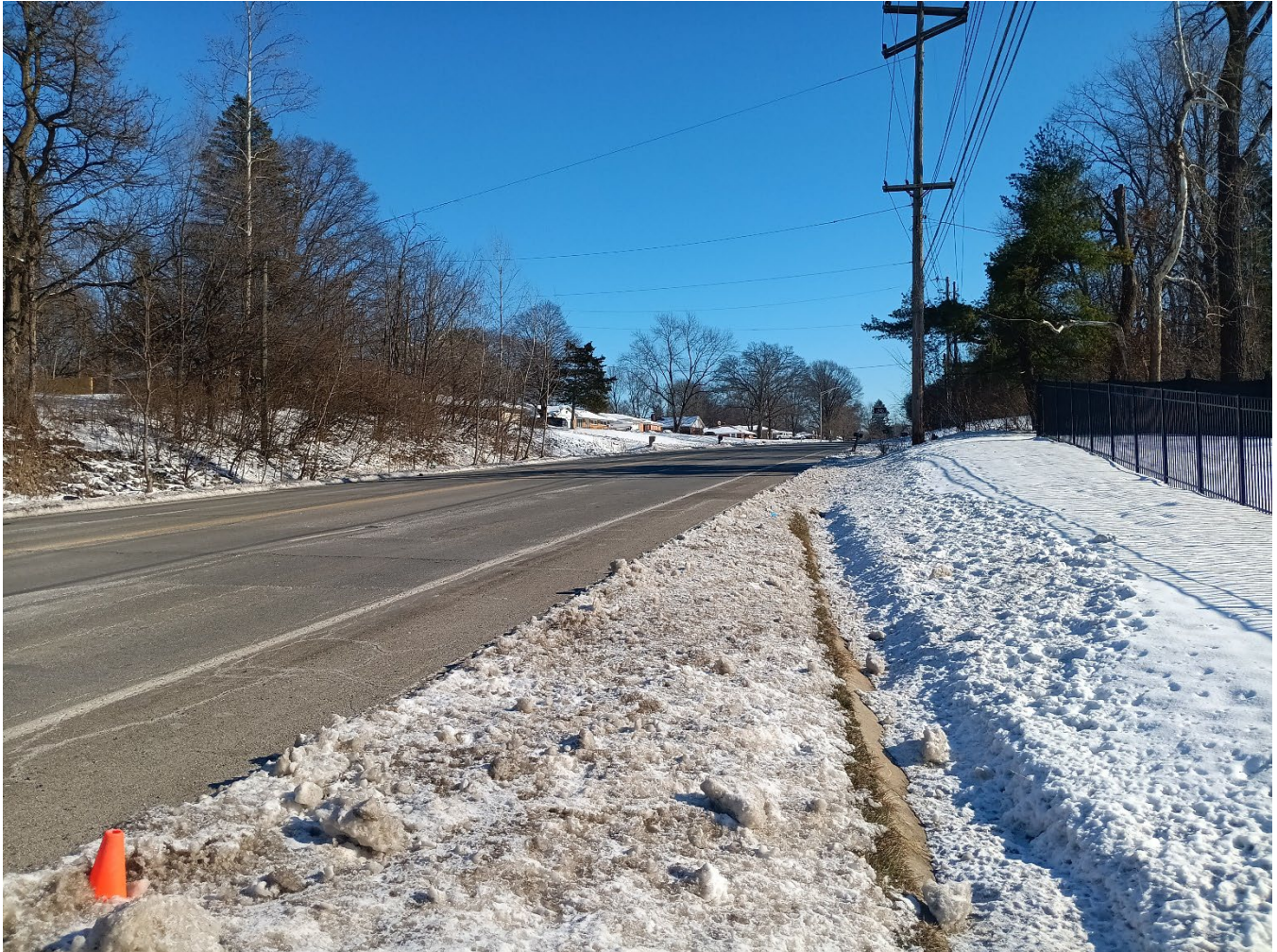
Exhibit 9: Looking east down 46 th Street.