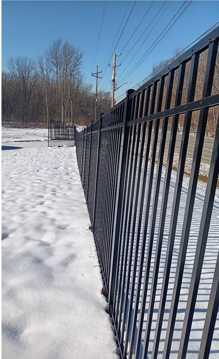
Exhibit 8: Looking down the length of the fence.