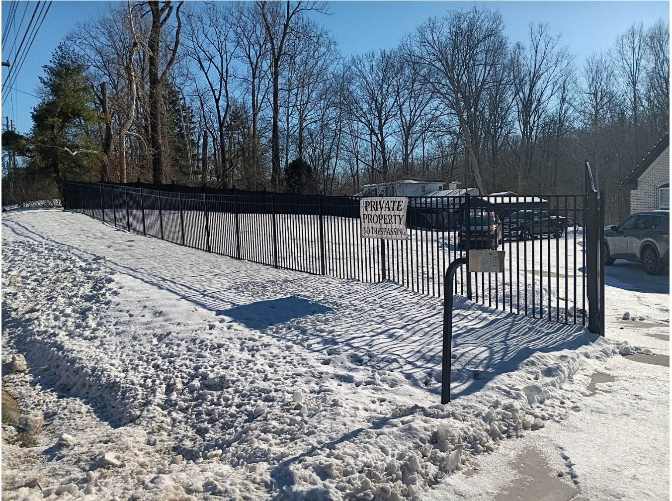
Exhibit 6: The fence.