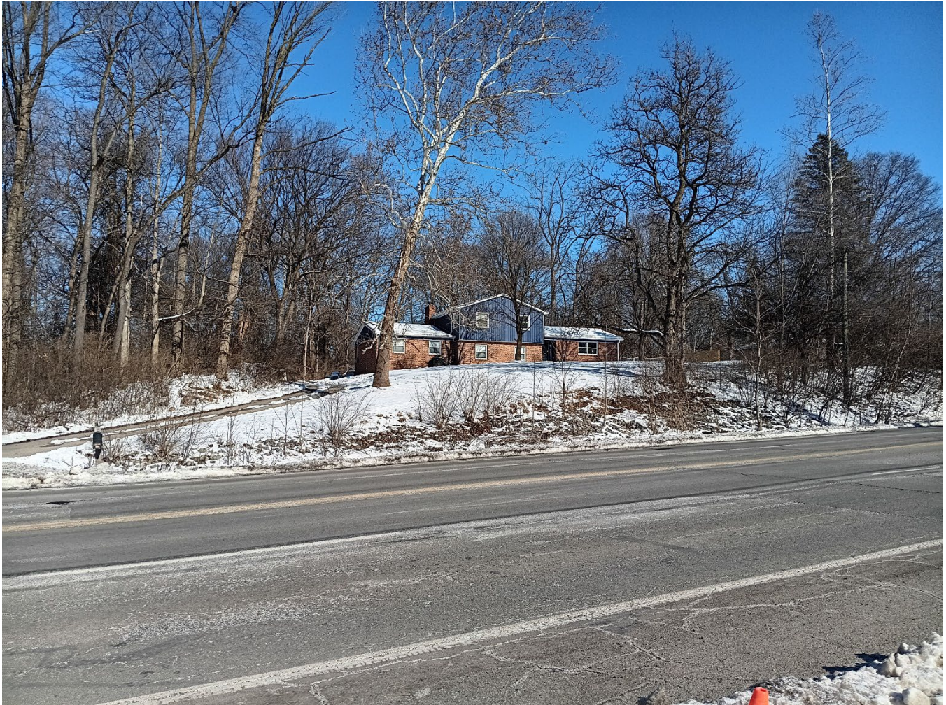
Exhibit 11: Neighbor across 46 th Street from the subject property.