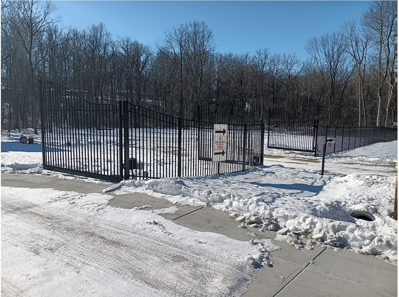
Exhibit 7: The rest of the fence.