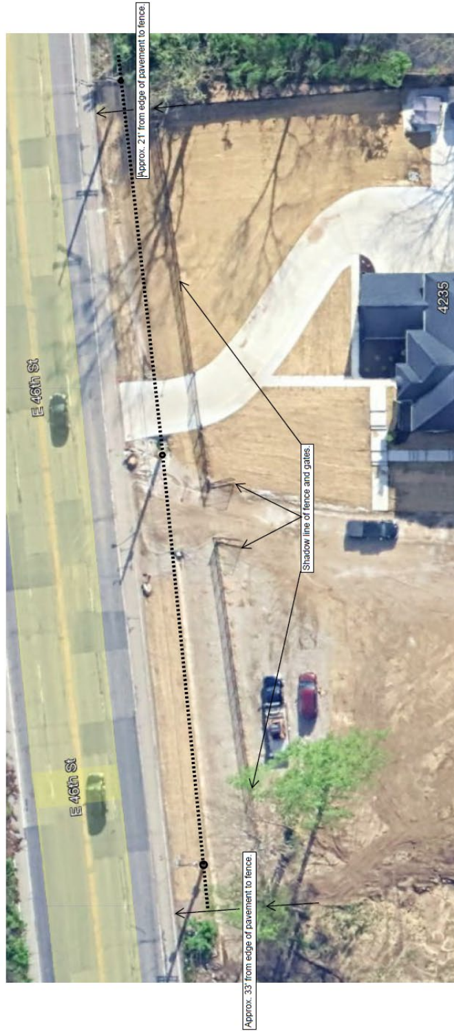
Exhibit 4: Aerial image with already constructed fence.