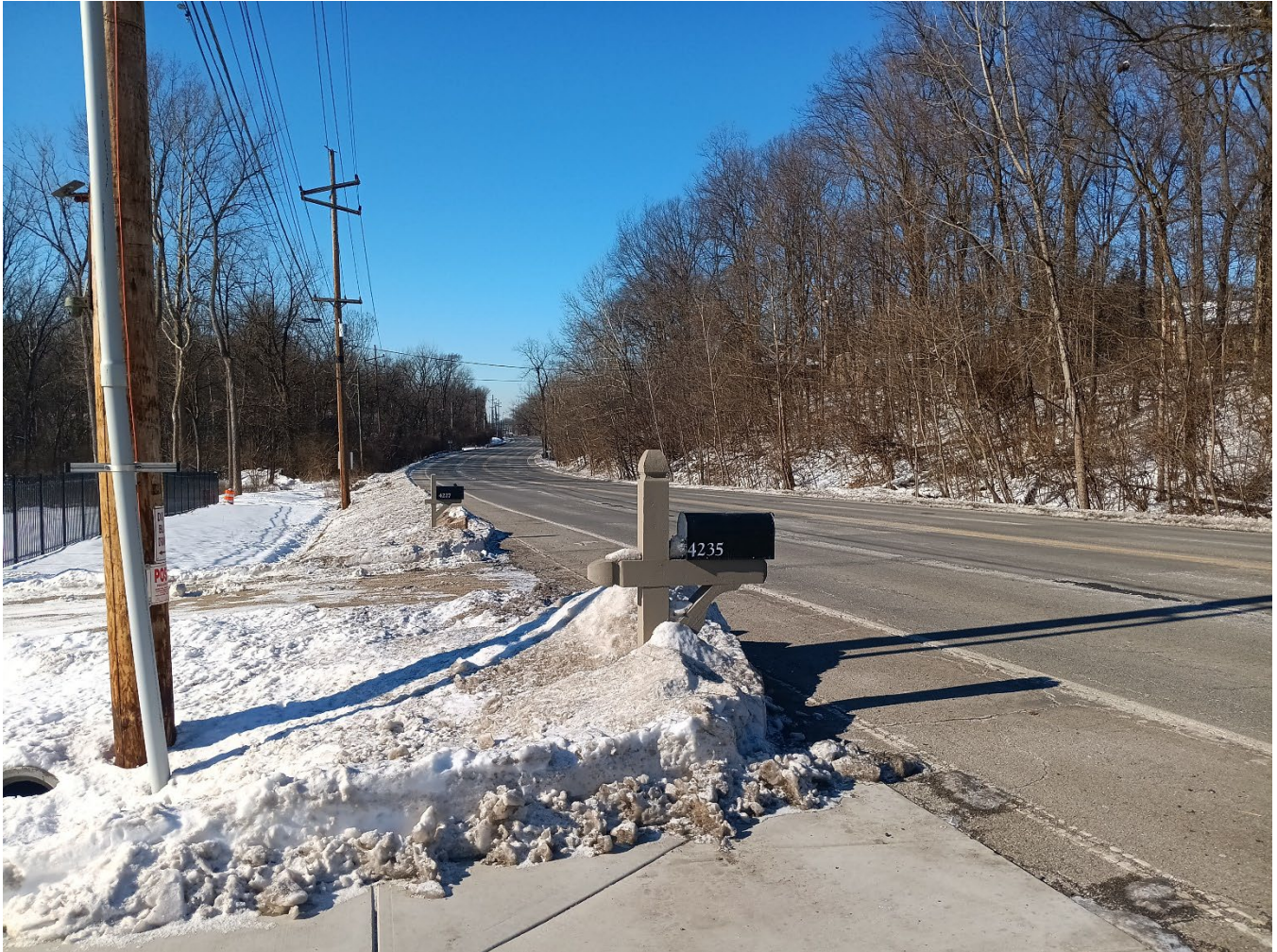
Exhibit 10: Looking west down 46 th Street.