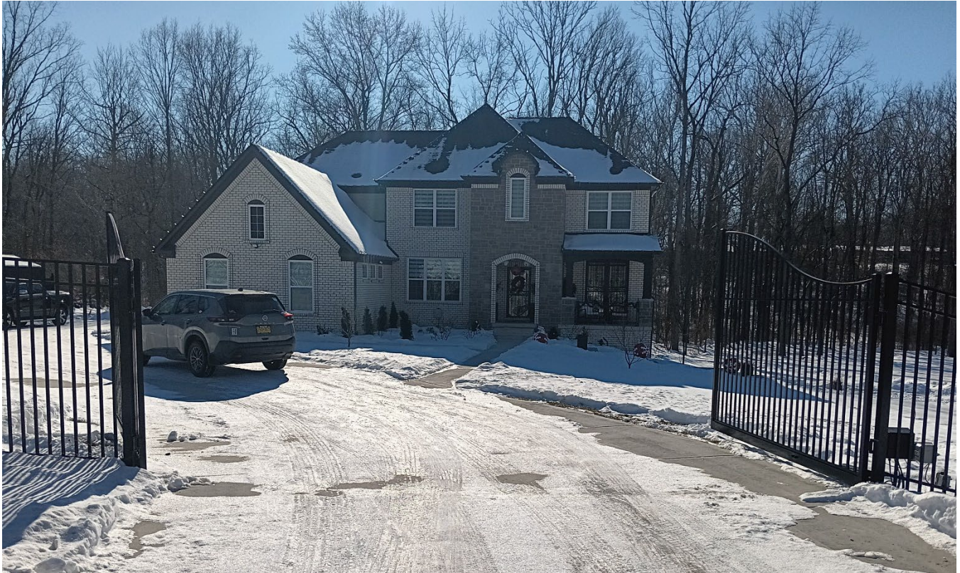
Exhibit 5: The primary structure at 4235 East 46 th Street.