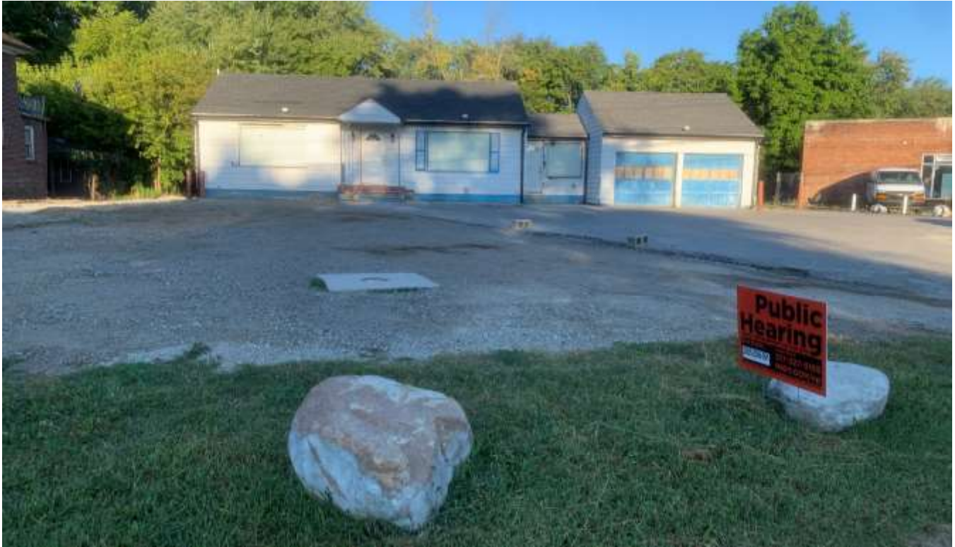
Photo of the subject site.