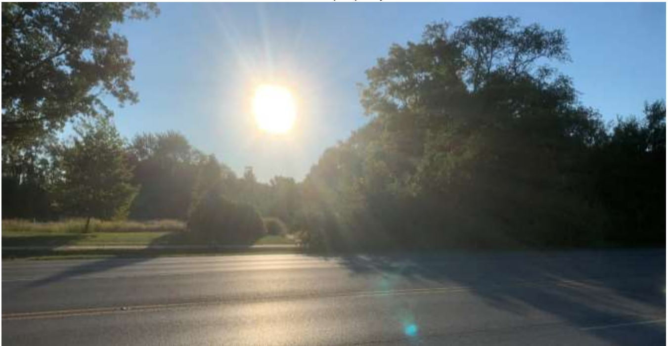
Photo of the library property east of the site.