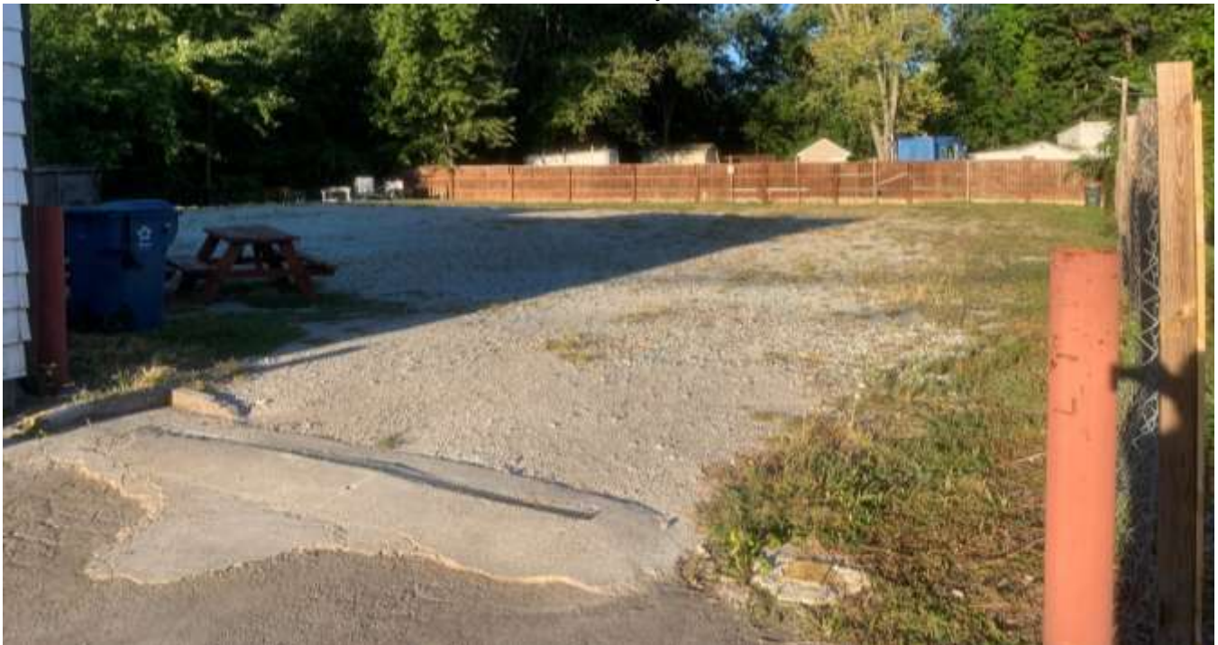
Photo of the subject site's rear yard looking west.