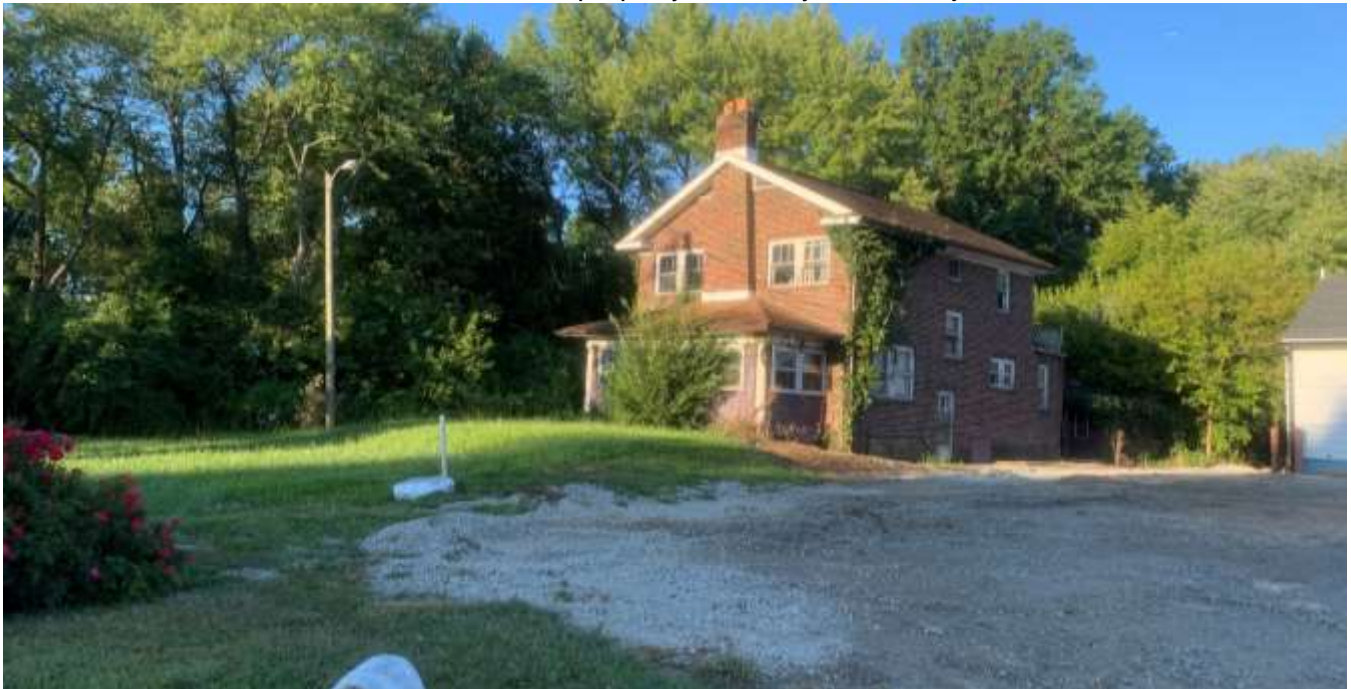
Photo of a single-family dwelling south of the site.