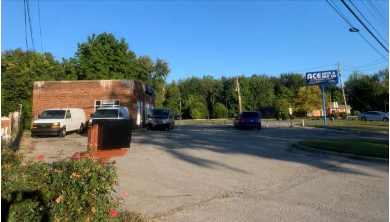
Photo of the commercial property north of the site.