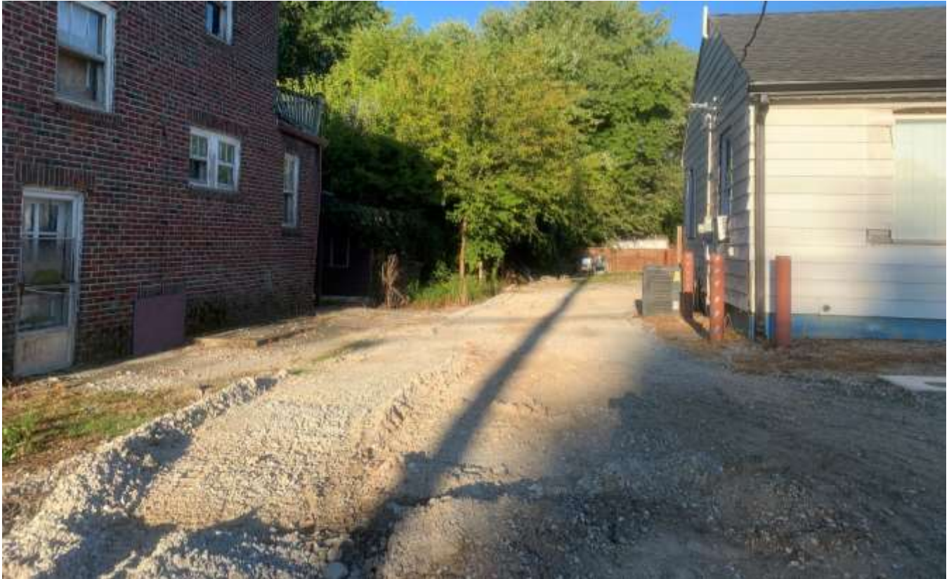
Photo of the southern property boundary of the subject site.