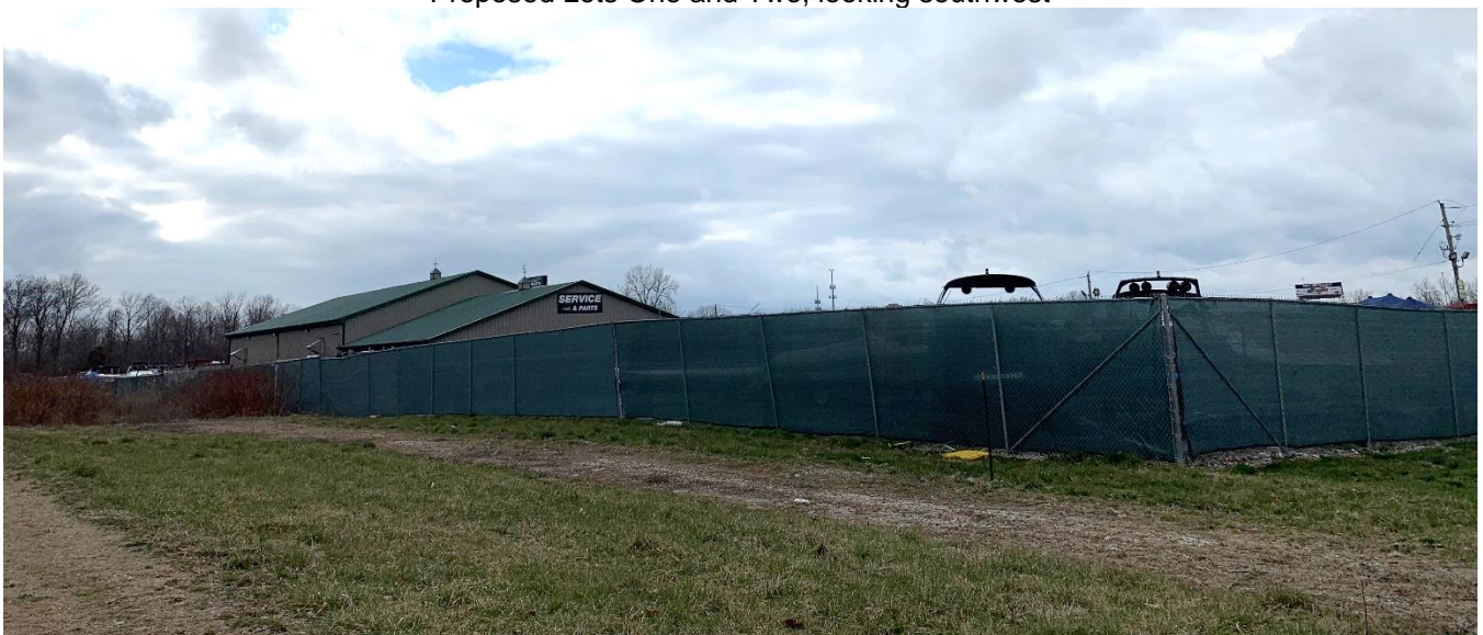
Proposed Lot One, Lot Two shown left