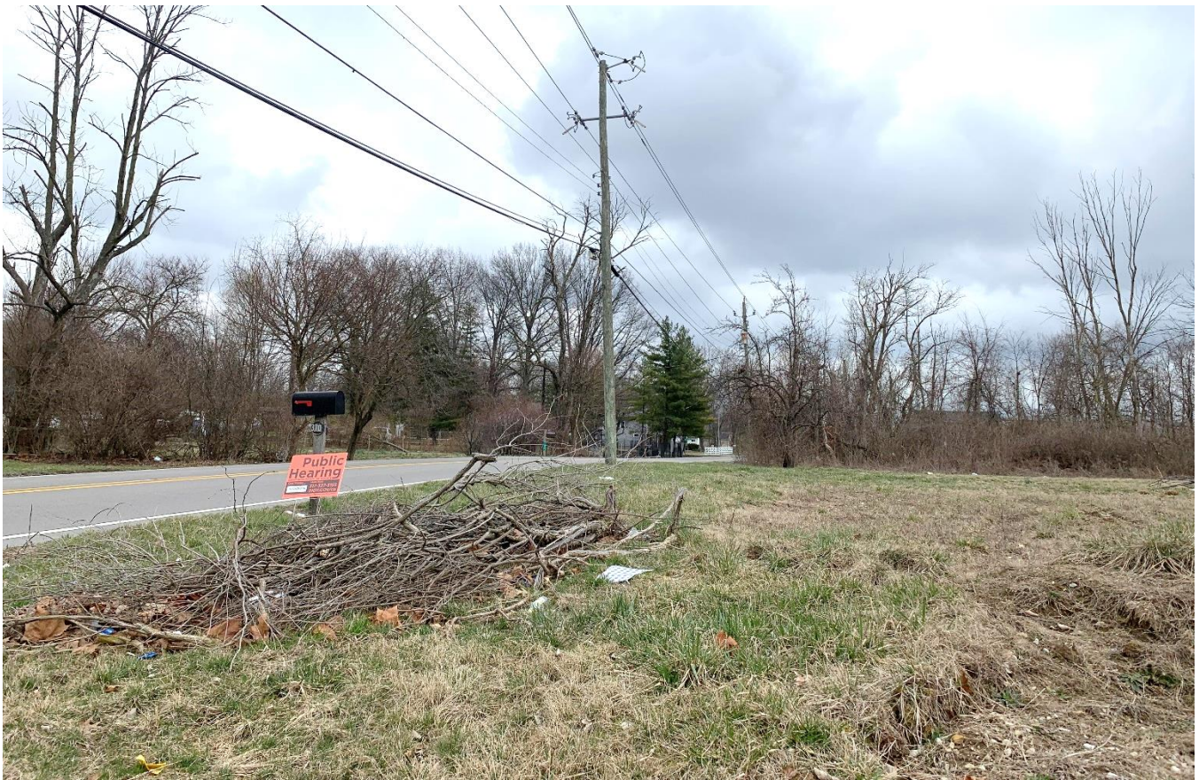
Proposed Lot Two, looking south