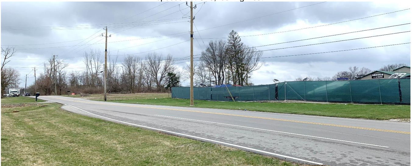
Proposed Lots One and Two, looking southwest