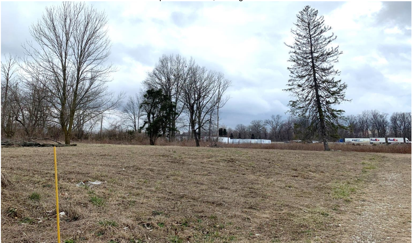
Proposed Lot Two, Interstate shown at the rear, looking west.