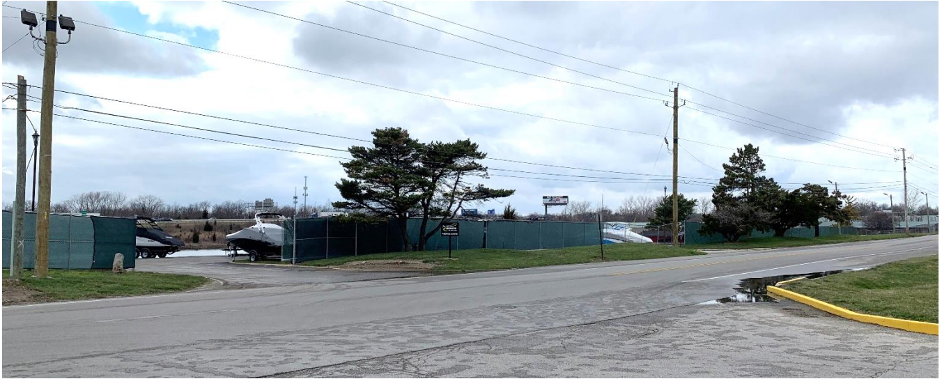
Proposed Lot One, looking west