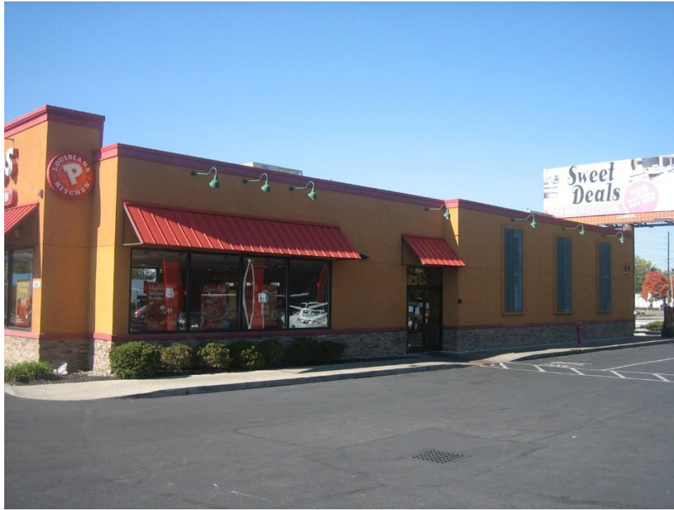
Subject site, east façade, looking northwest.