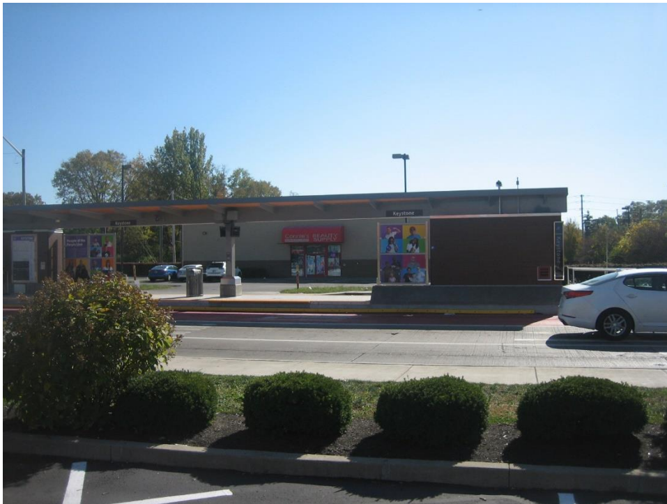
Adjacent to the south, Purple line transit stop.