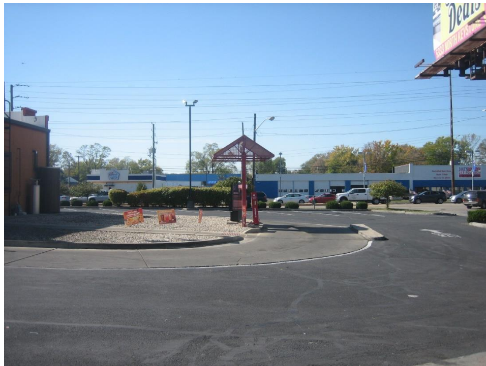
Subject site, proposed second drive thru location, looking west.