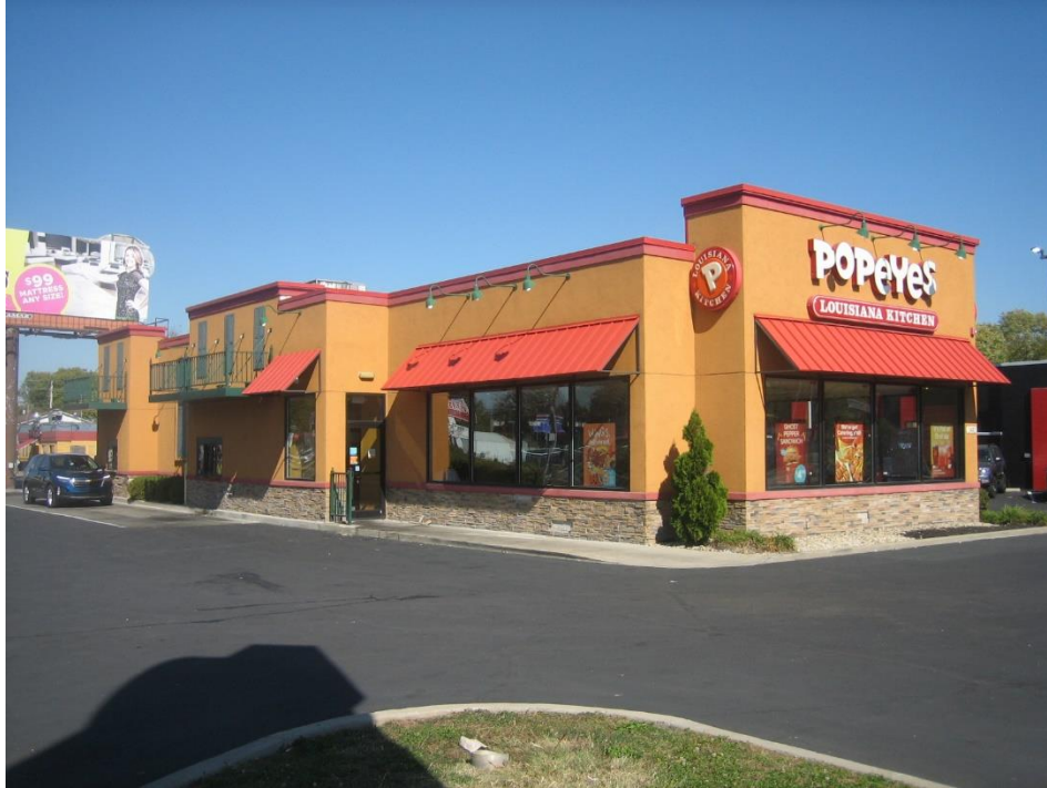
Subject site, west façade, looking northeast.