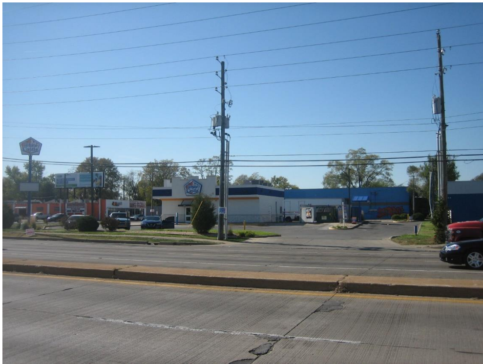
Adjacent Commercial restaurant to the west.