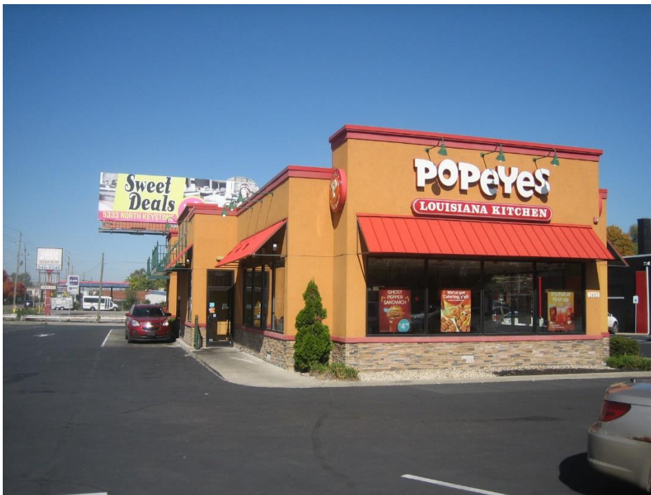
Subject site, south façade, looking north.