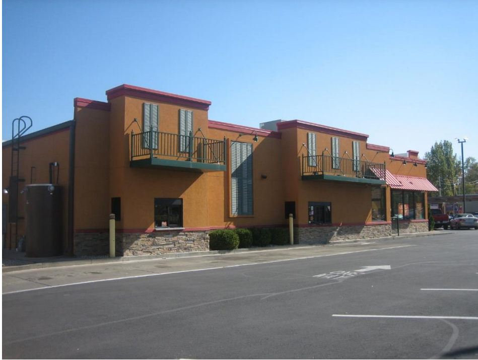
Subject site drive thru stacking spaces in front yard of North Keystone Avenue, looking southeast.