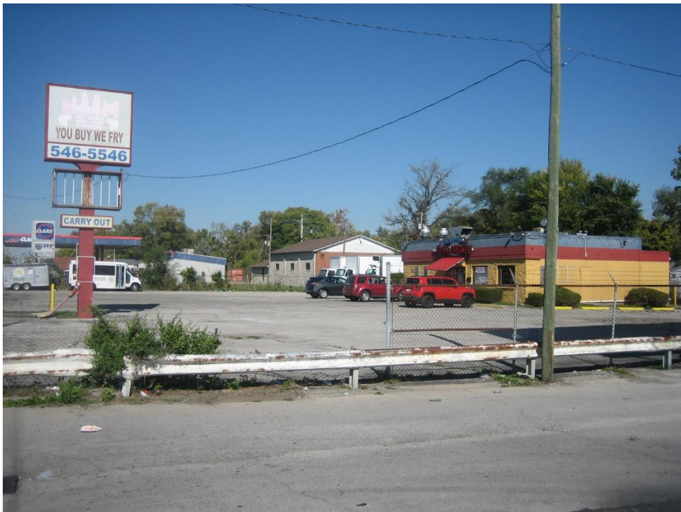
Adjacent commercial restaurant to the north.