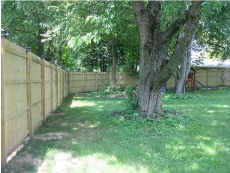
Subject property looking west.