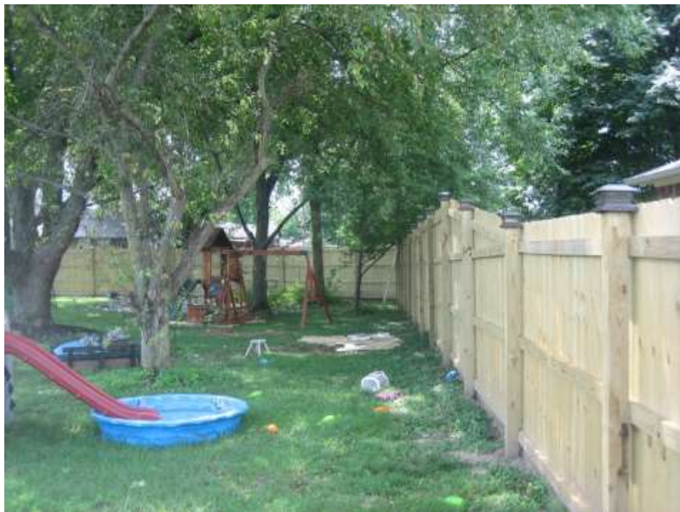
Subject property looking south.