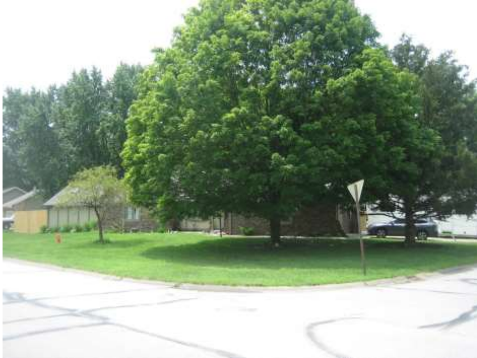
Subject property looking southwest.