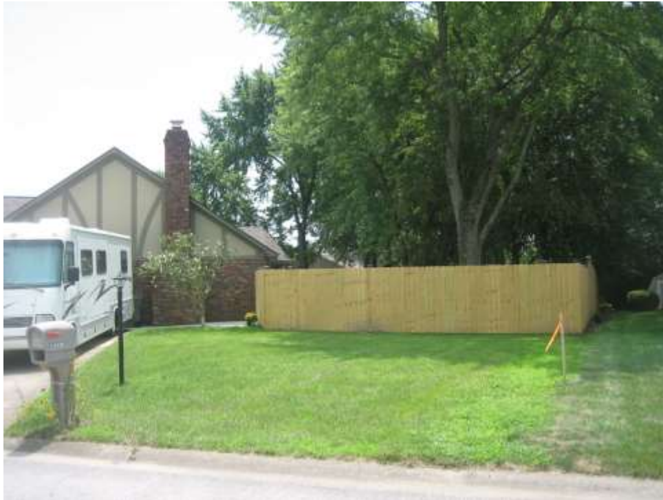
Subject property looking south.