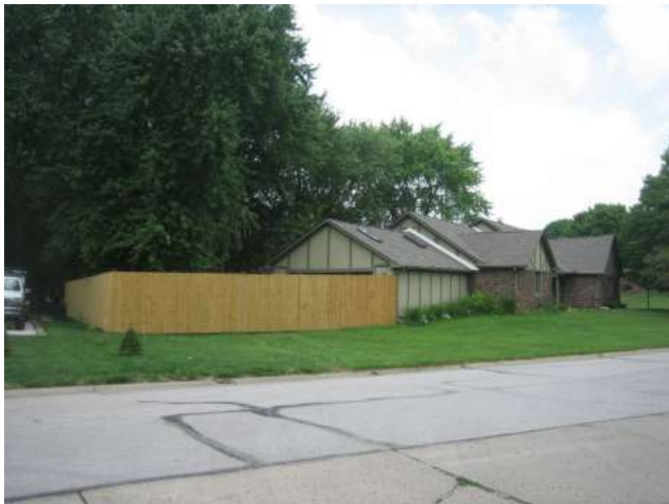
Subject property looking west.