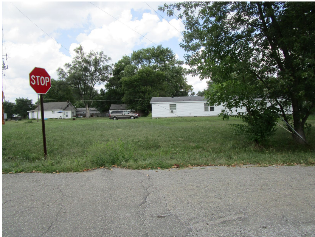
View of site looking north across Sumner Avenue