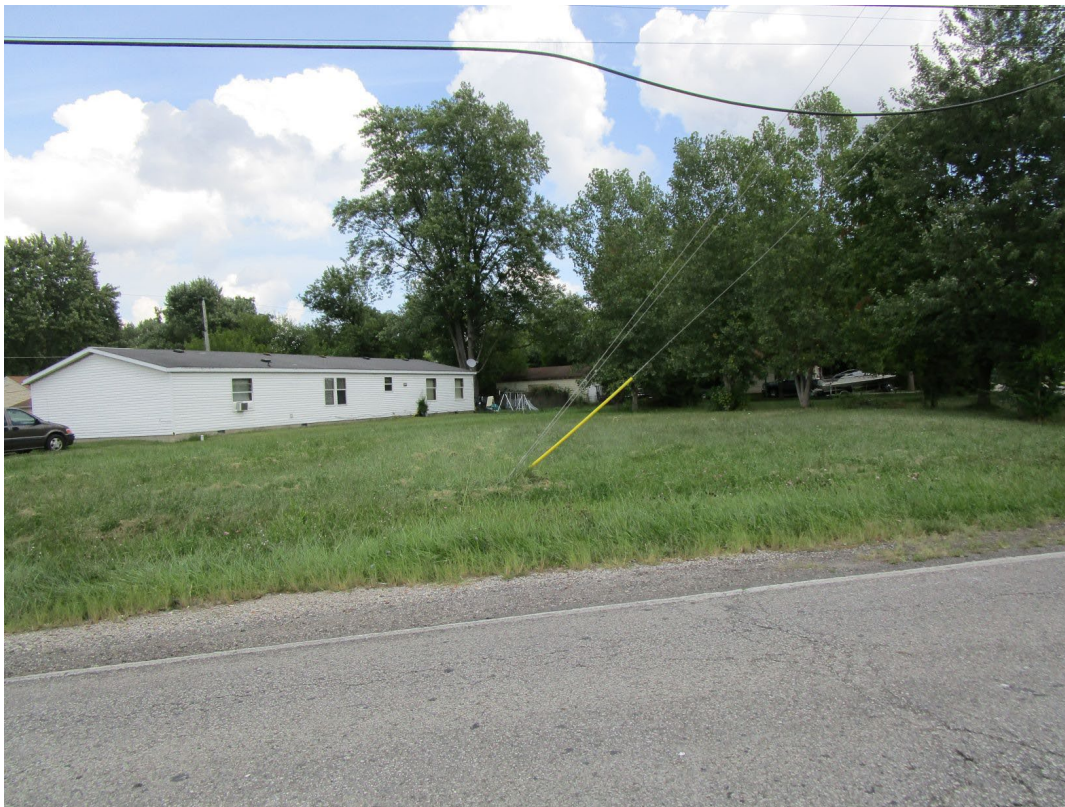
View of site looking east across Carson Avenue