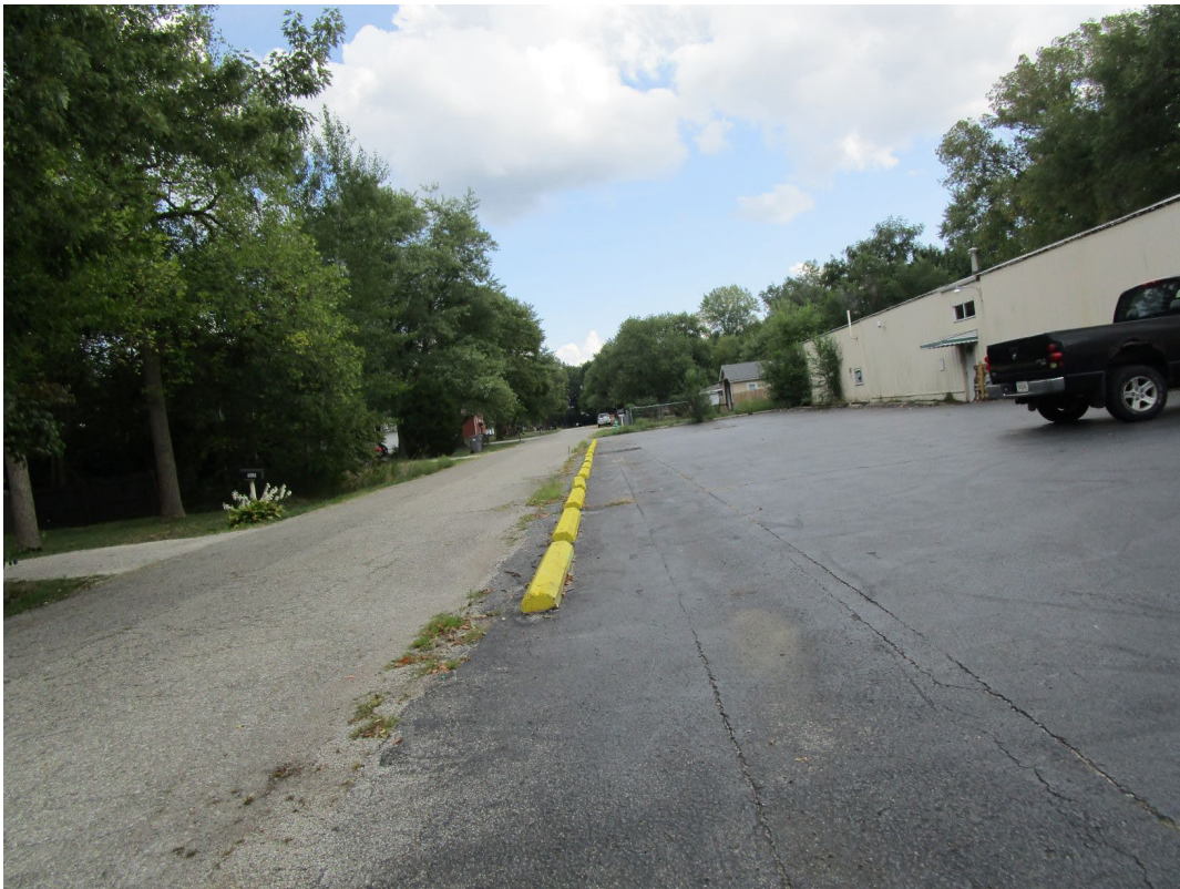
View looking east along Sumner Avenue