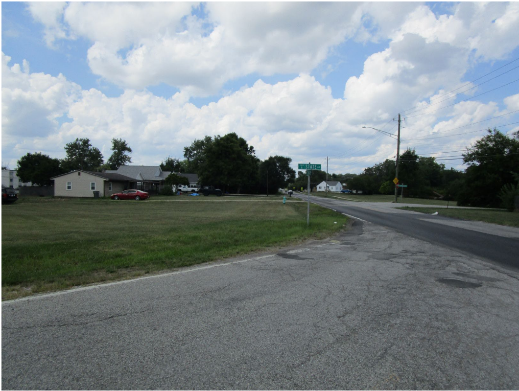
View looking north along Carson Avenue