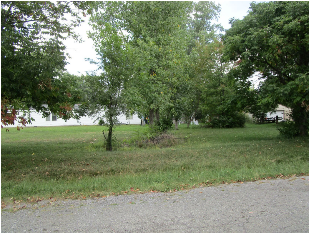
View of site looking north across Sumner Avenue