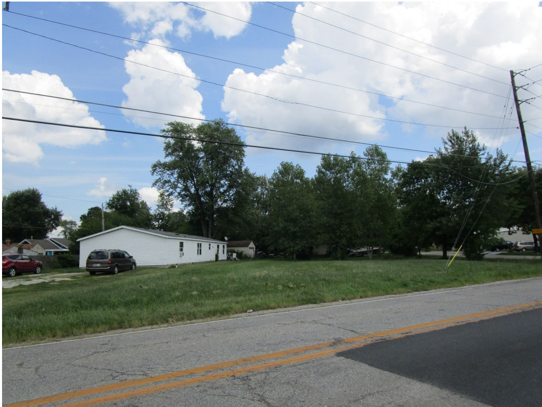
View of site looking southeast across Carson Avenue