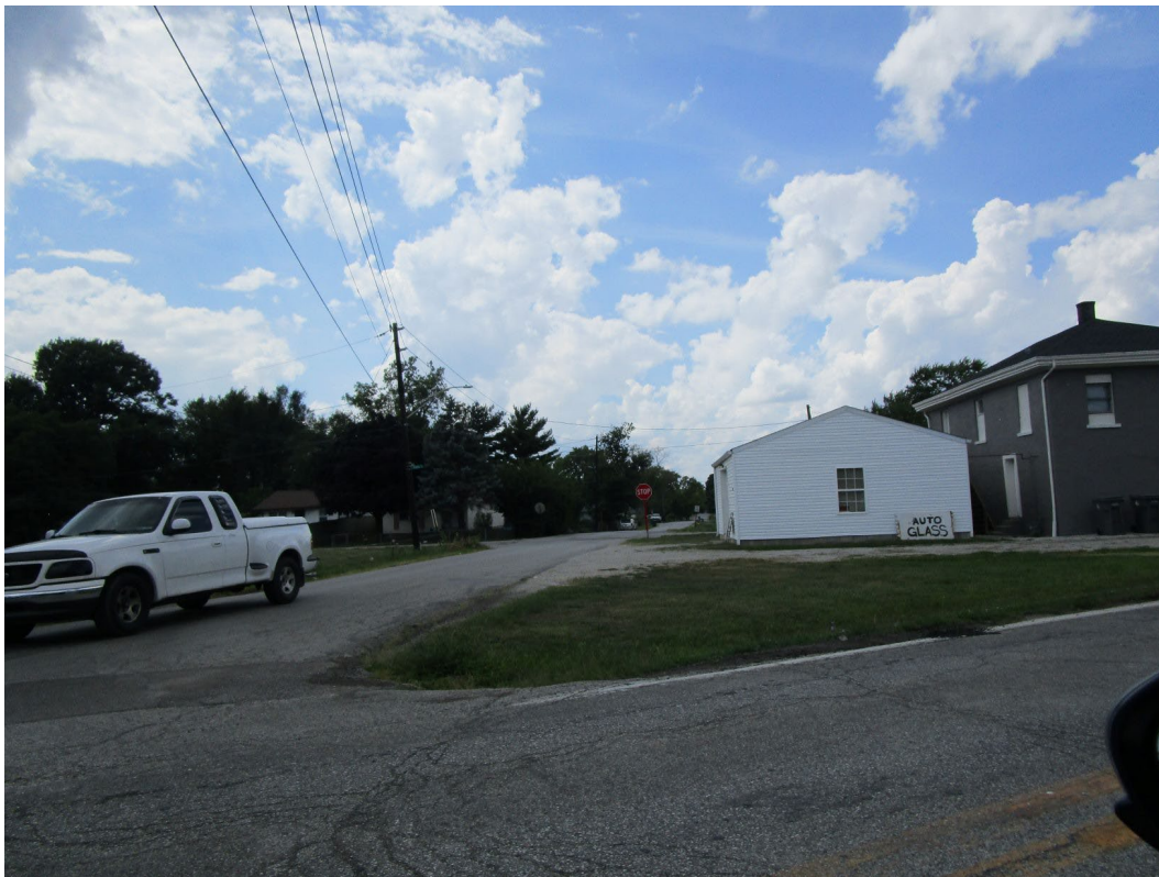
View from site looking west along Sumner Avenue