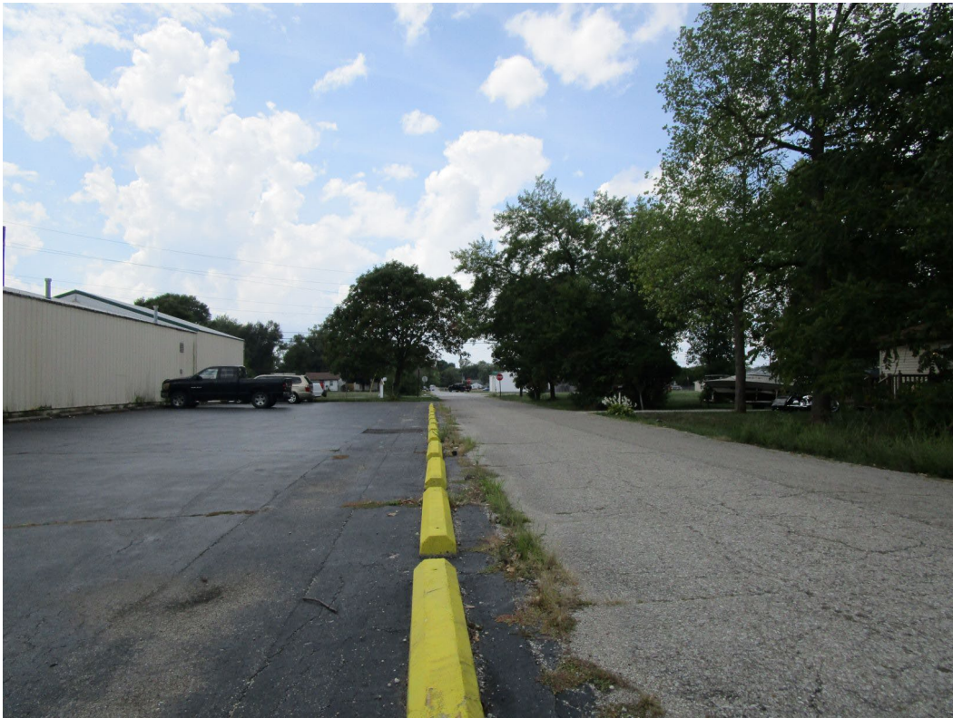
View looking west along Sumner Avenue