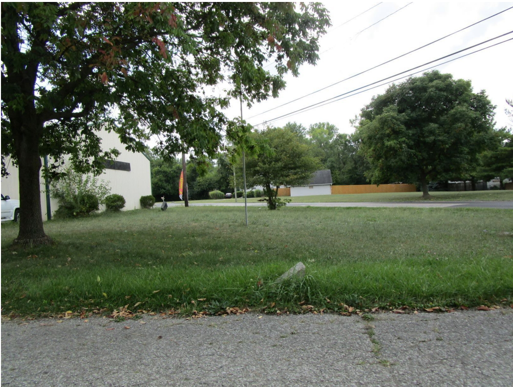
View from site looking north across Sumner Avenue