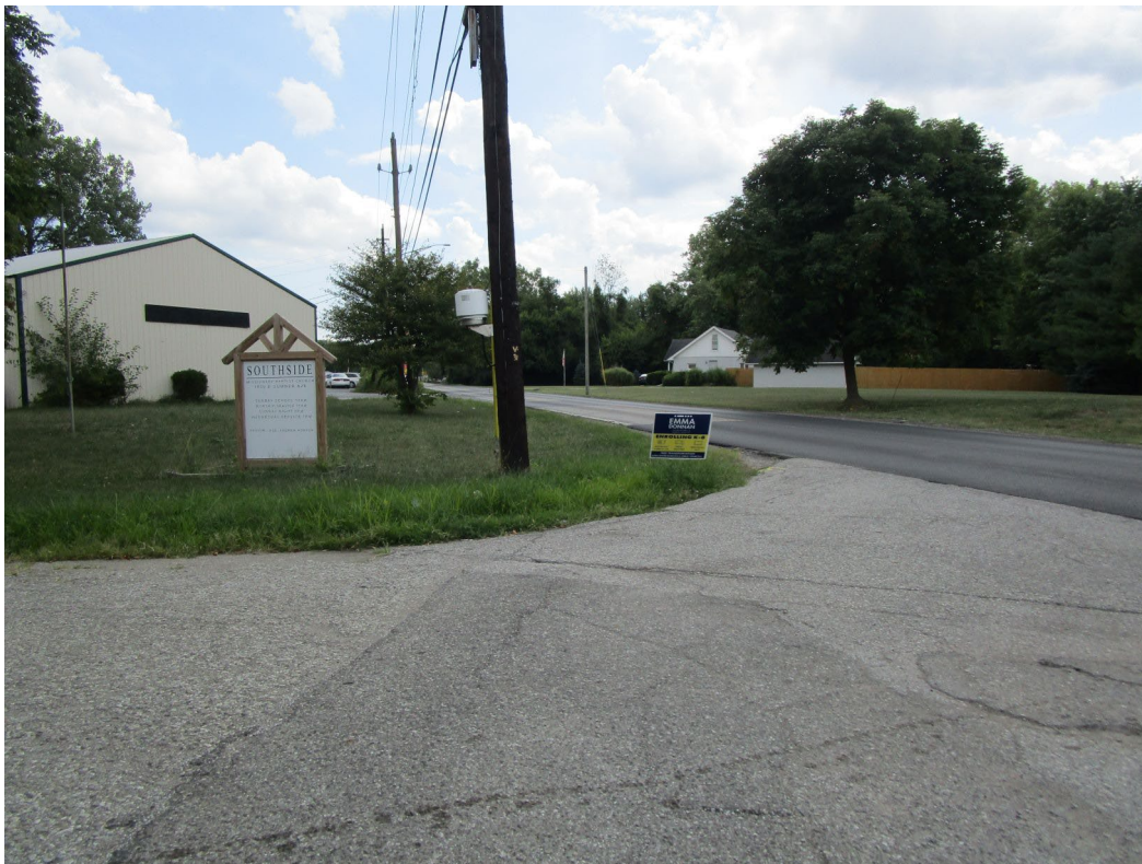
View looking north at the intersection of Sumner Avenue and Carson Avenue