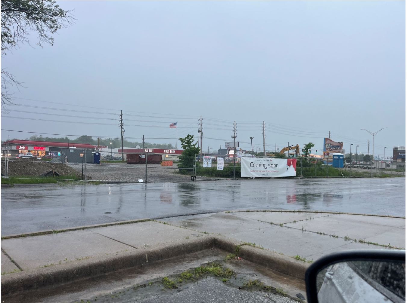
Photo 3: Photo of subject site undergoing development and surrounding context in background