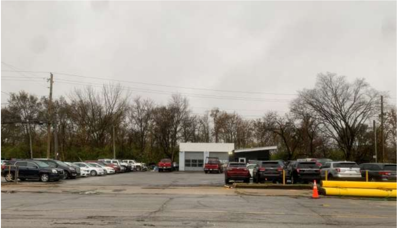
Photo of the subject site looking south on Washington Street.