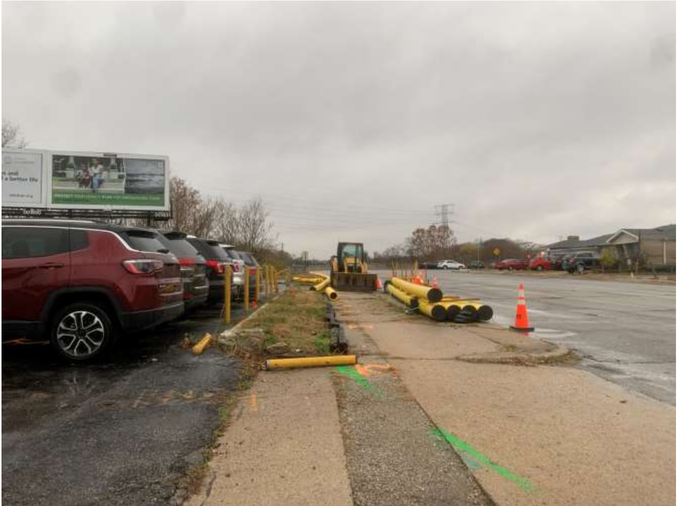
Subject site's street frontage looking west along Washington Street.