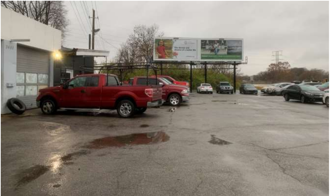
Photo of the subject site's front parking area looking west.