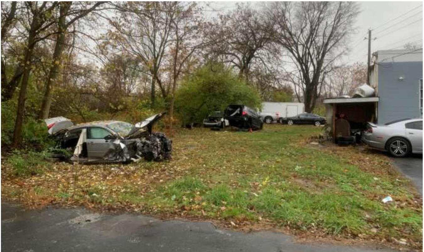
Photo of the subject site's rear yard.