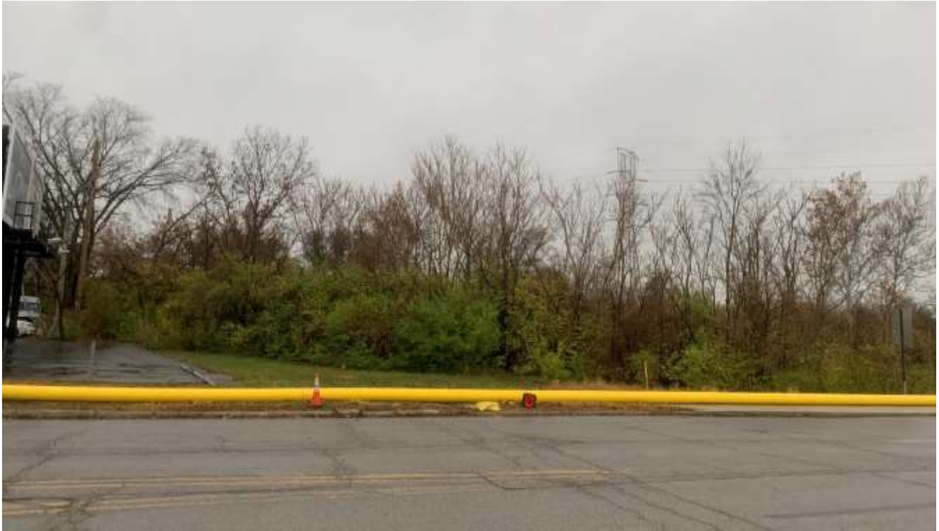
Photo of the wooded area around Eagle Creek Stream west of the site.