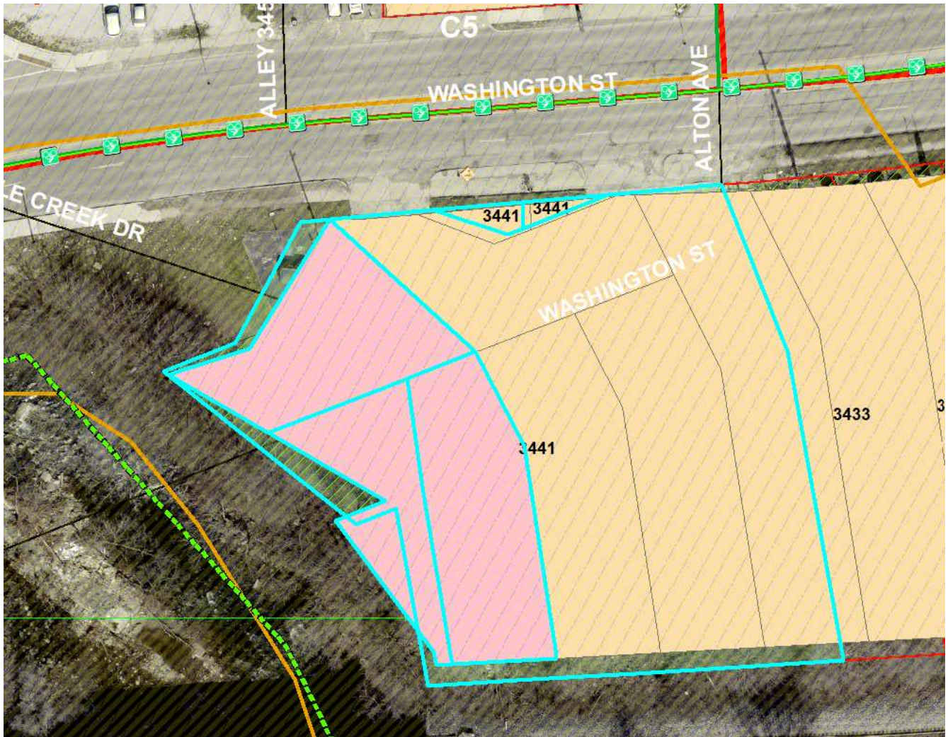
WEST WASHINGTON STREET CORRIDOR PLAN – Park in Pink / Community Commercial Uses in Orange.