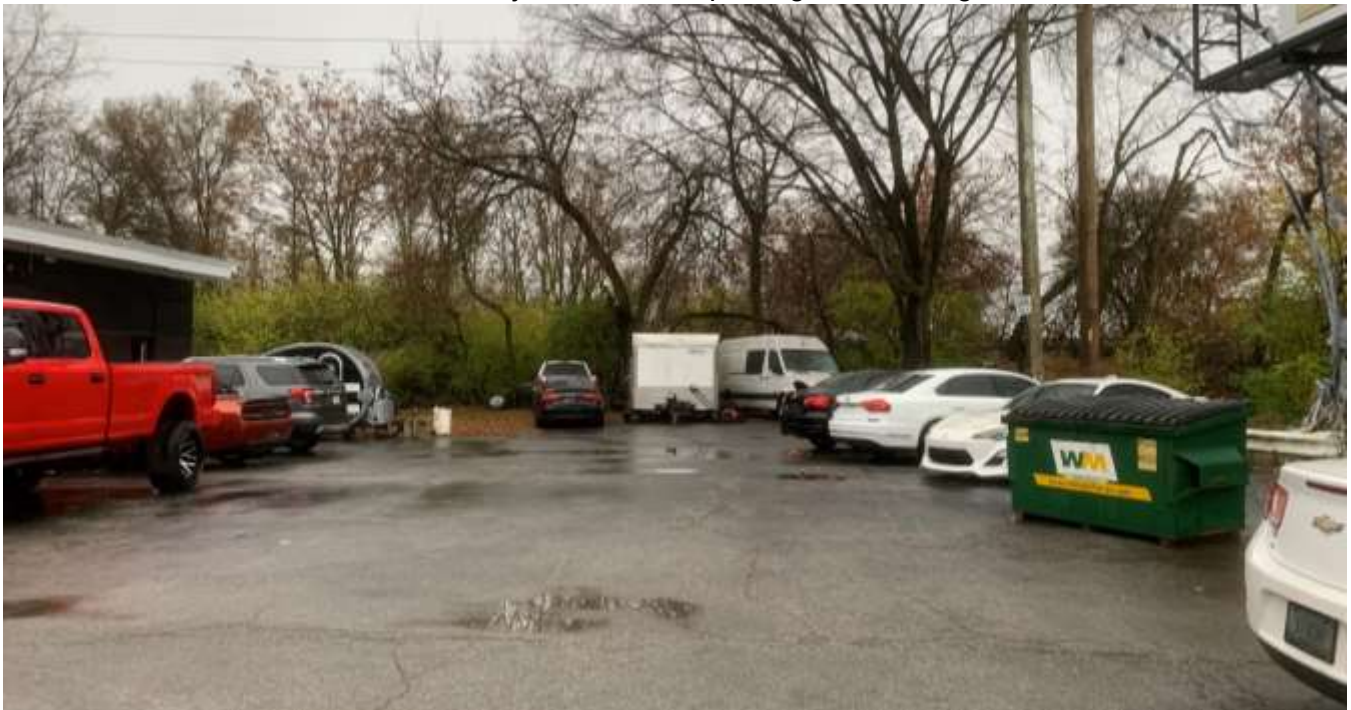
Photo of the site's western side yard and unenclosed dumpster.