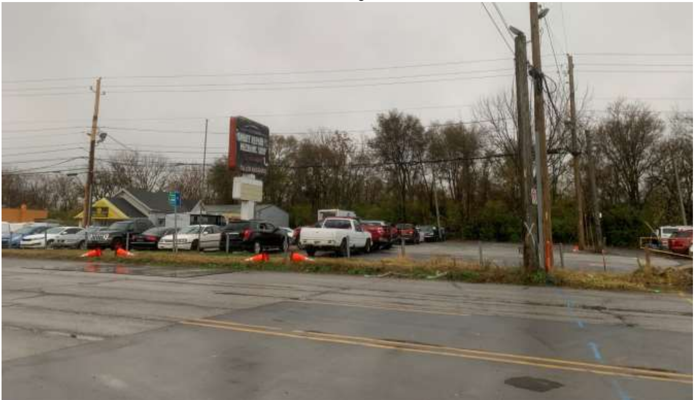
Photo of an auto repair shop east of the site.