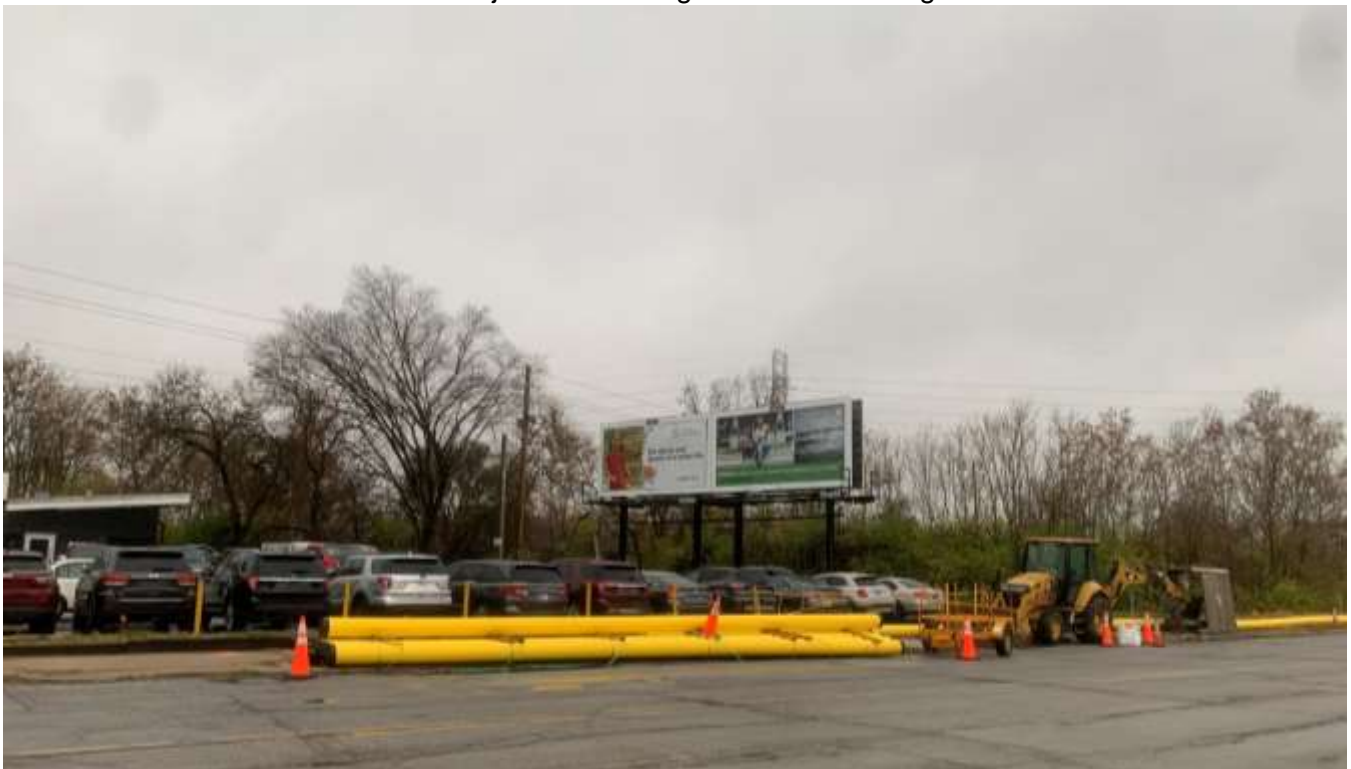
Photo of the subject site looking southwest.