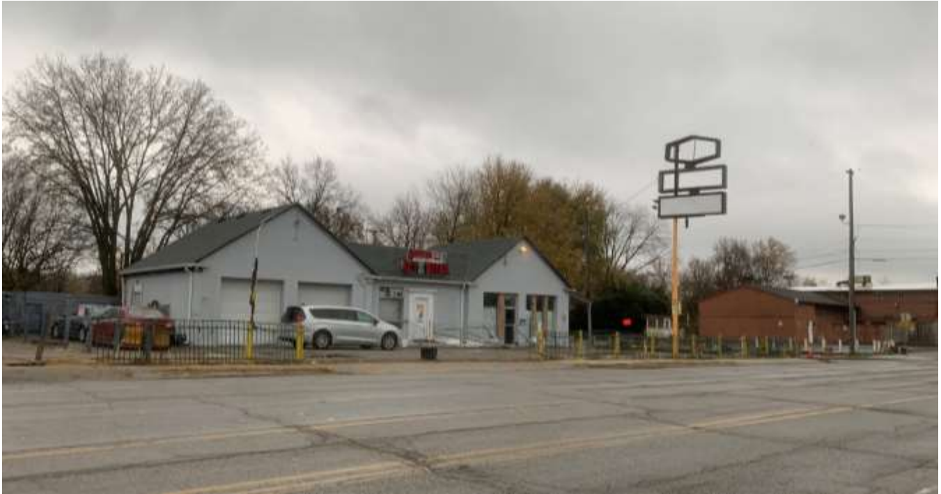
Photo of a used car dealer north of the site.