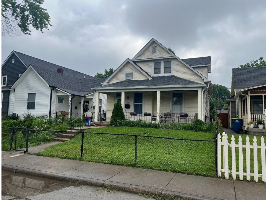
Subject site from Olive Street