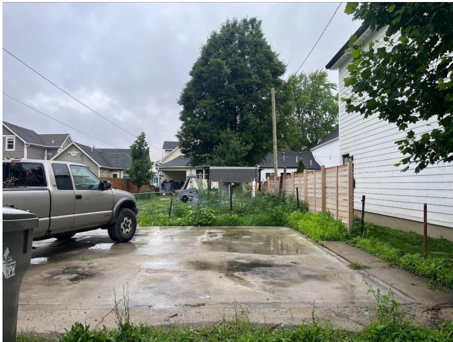
Rear yard from alley