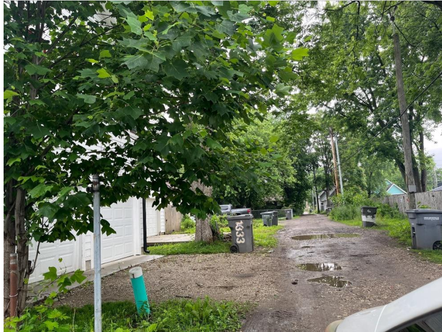
View of the alley