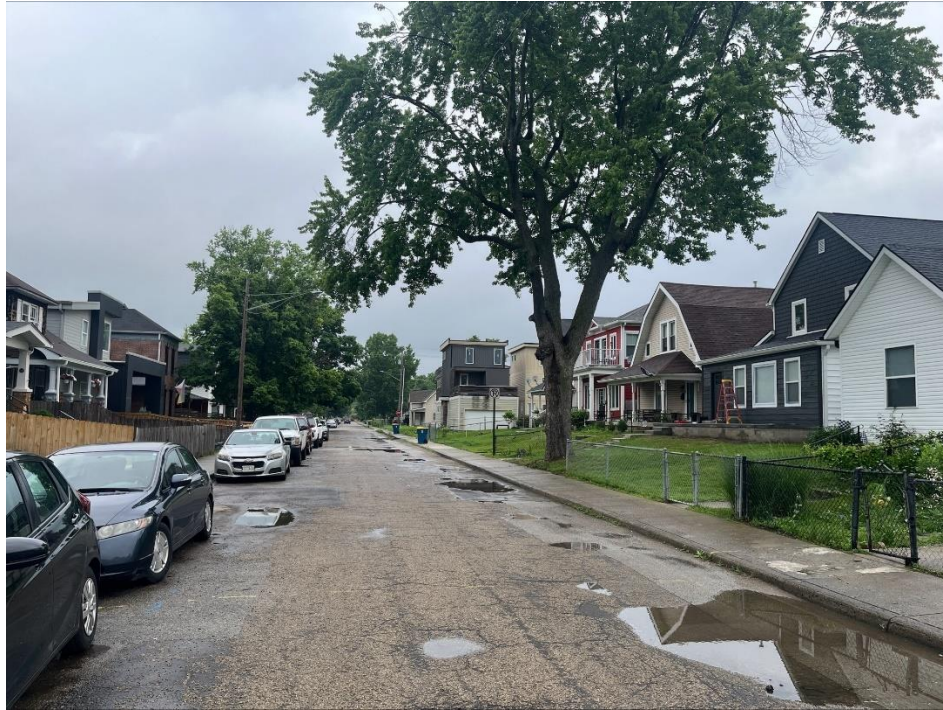
View of Olive Street looking south