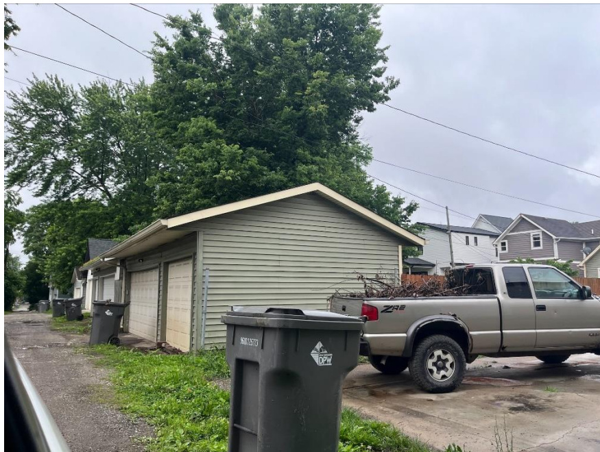
View of subject site and adjacent garage