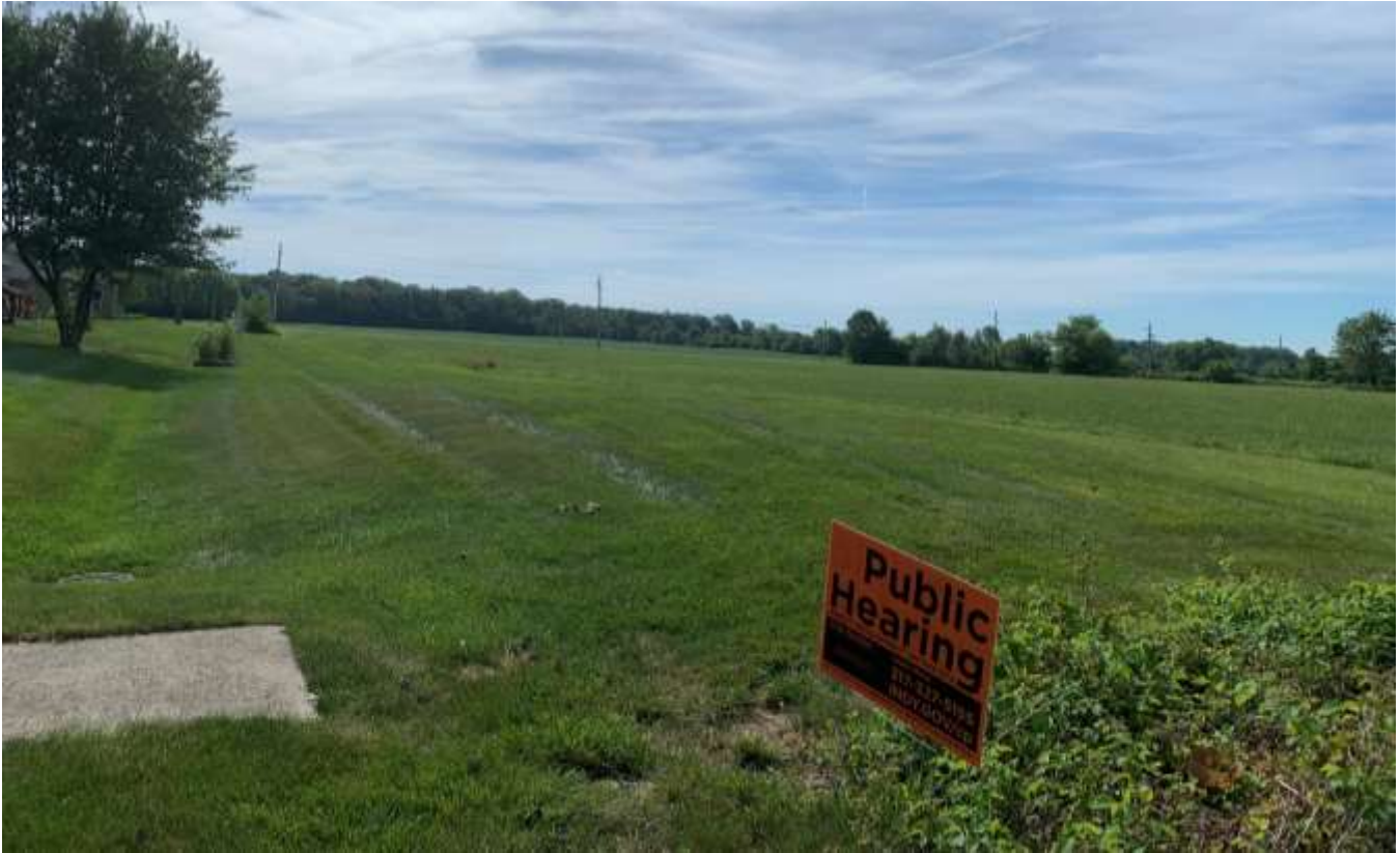
Phot of the subject site looking east towards Carroll Road.