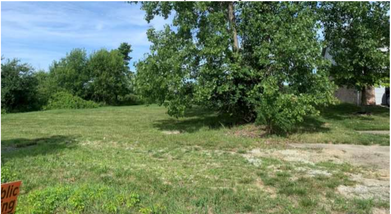
Photo of the subject site looking west.