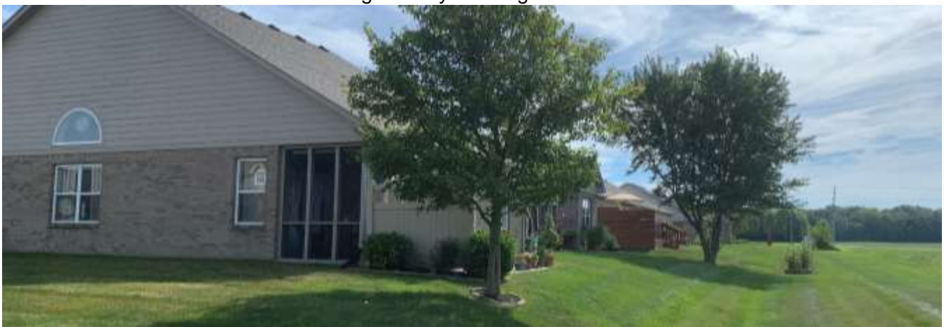
Photo of single-family dwellings north of the site.