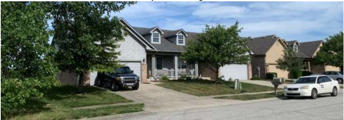
Photo of single-family dwellings north of the site.