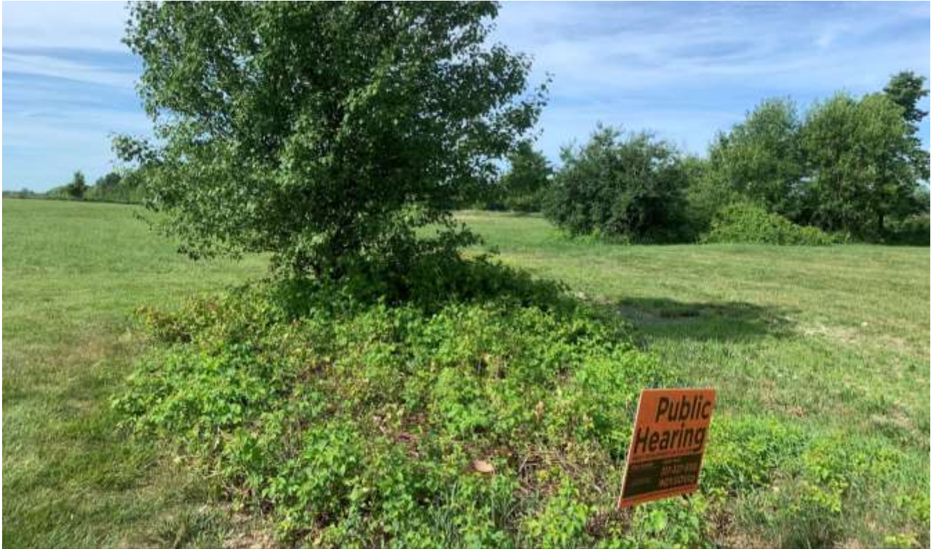
Photo of the subject site looking south.