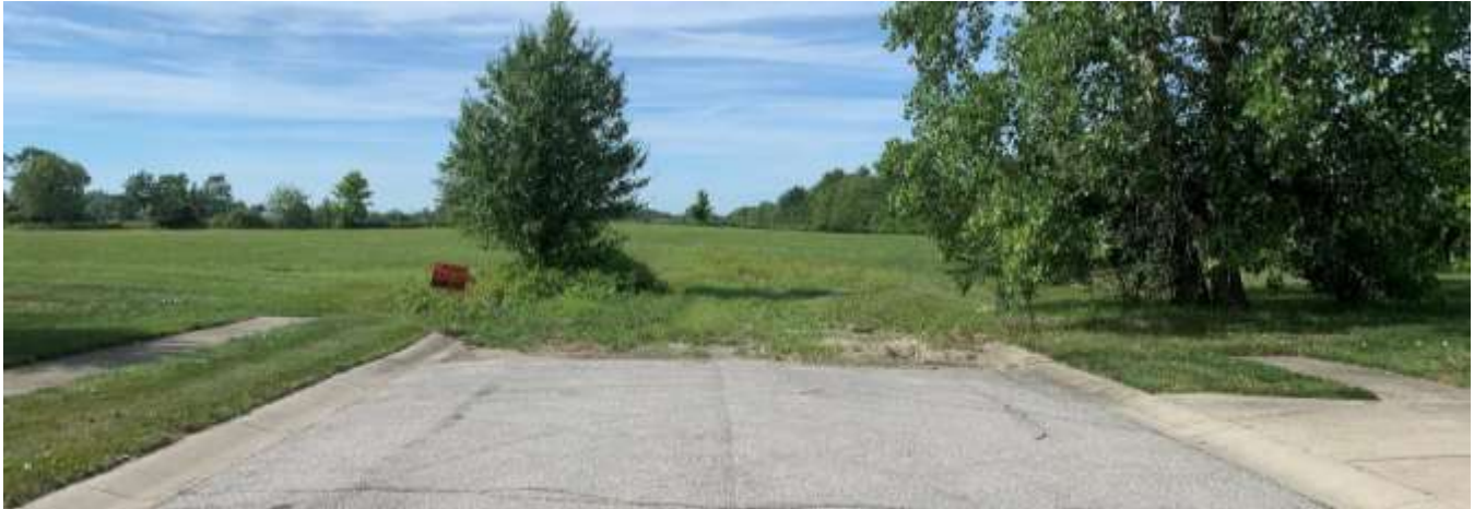
Photo of the subject site looking south from a