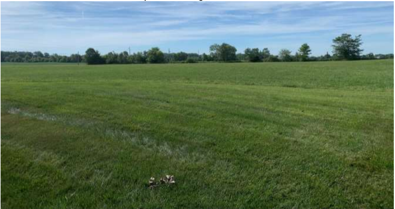
Photo of the subject site looking southeast towards Carroll Road.