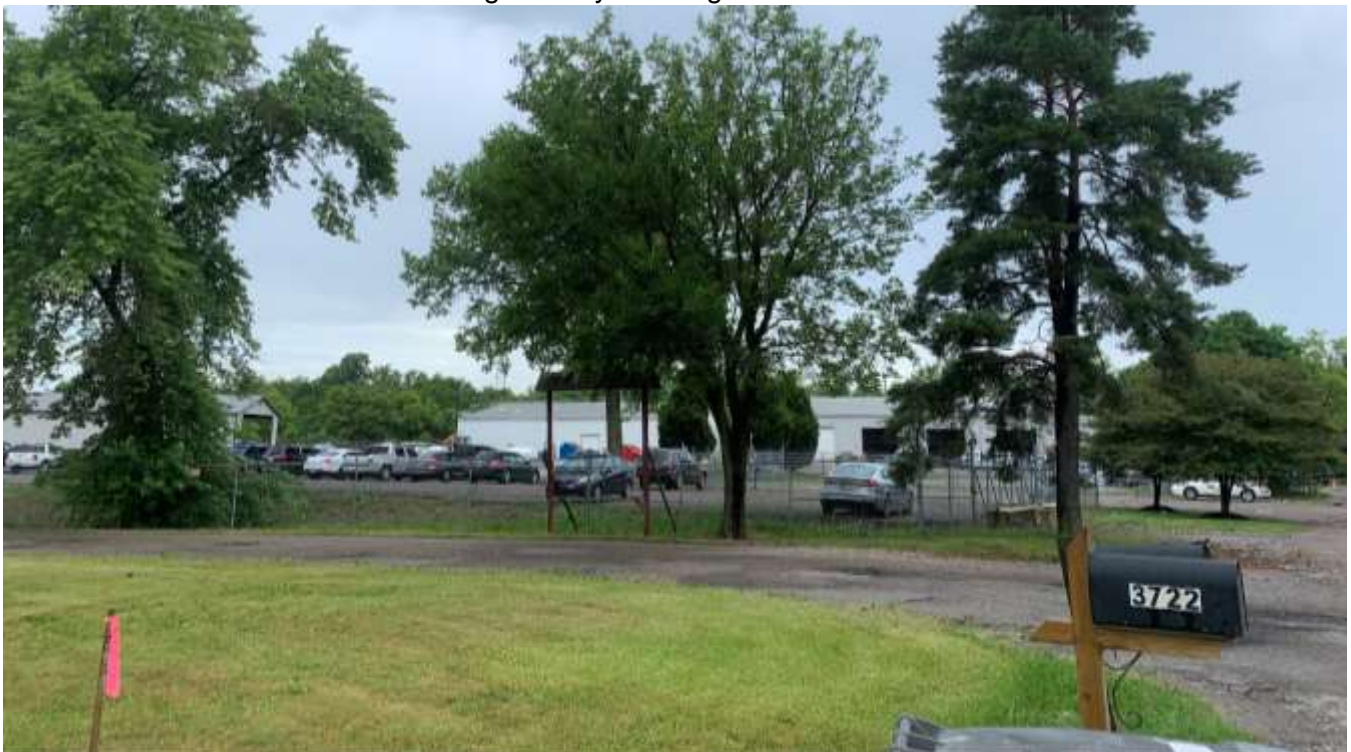
Photo of the concrete contractor business looking north.