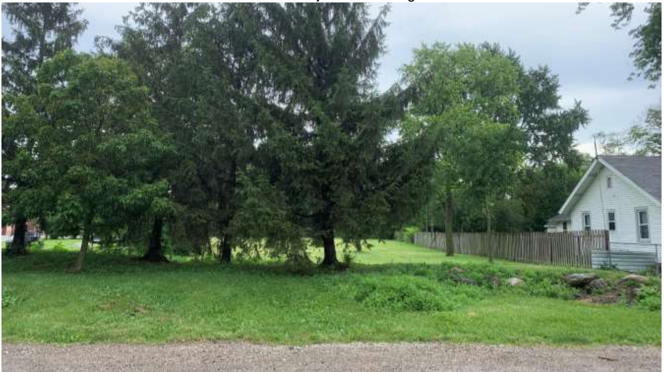
Southern property boundary of the subject site looking east.