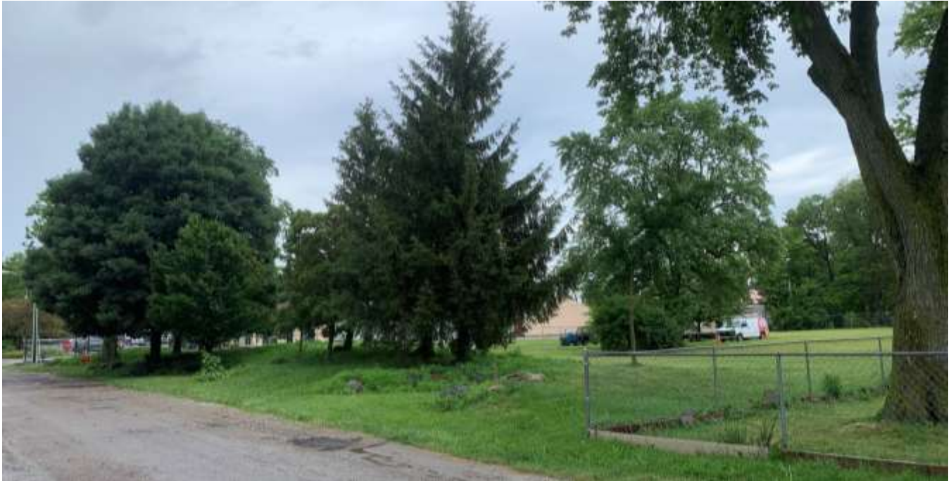
Photo of the subject site street frontage looking northeast.