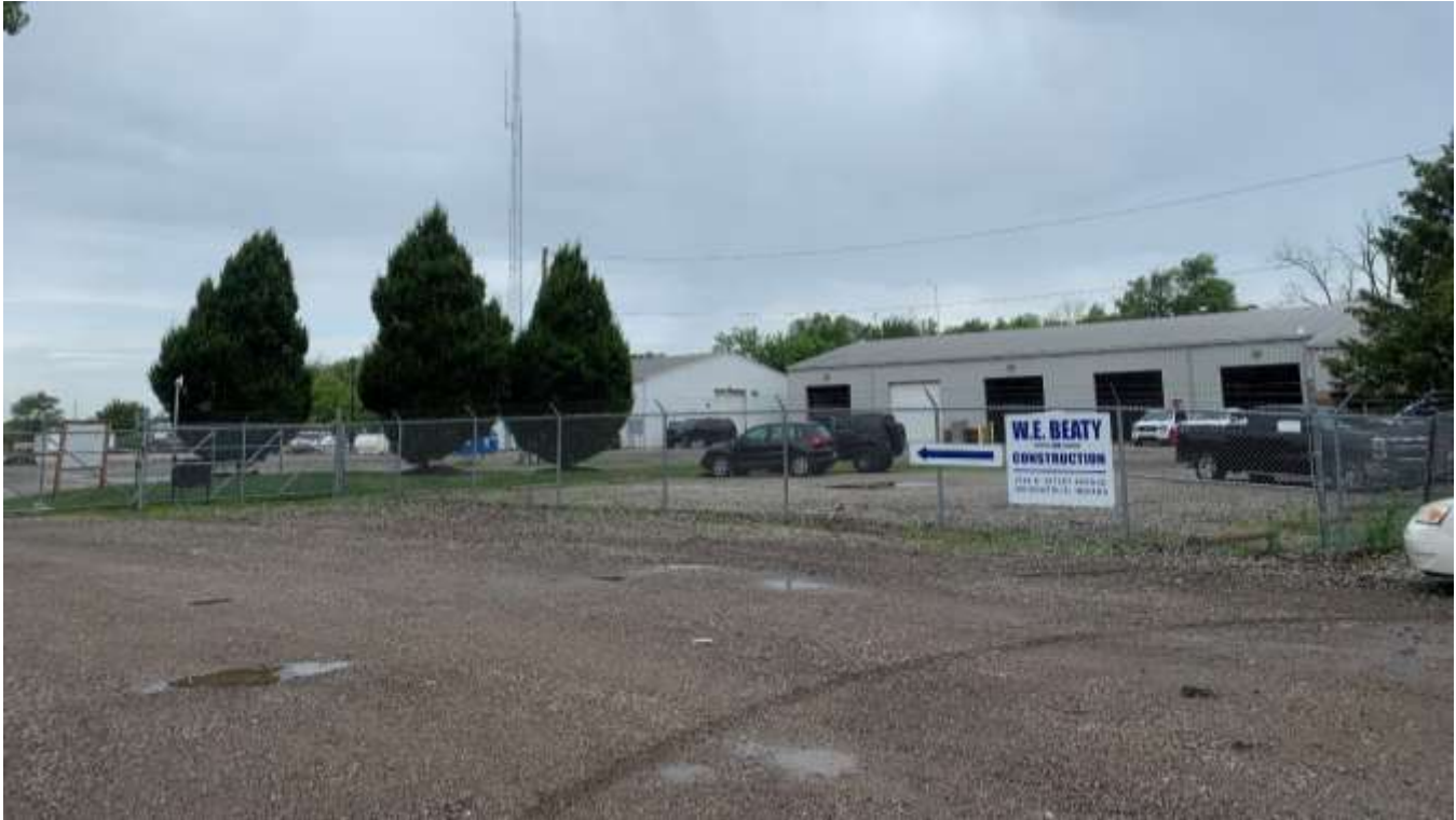
Photo of the concrete contractor business looking northwest.