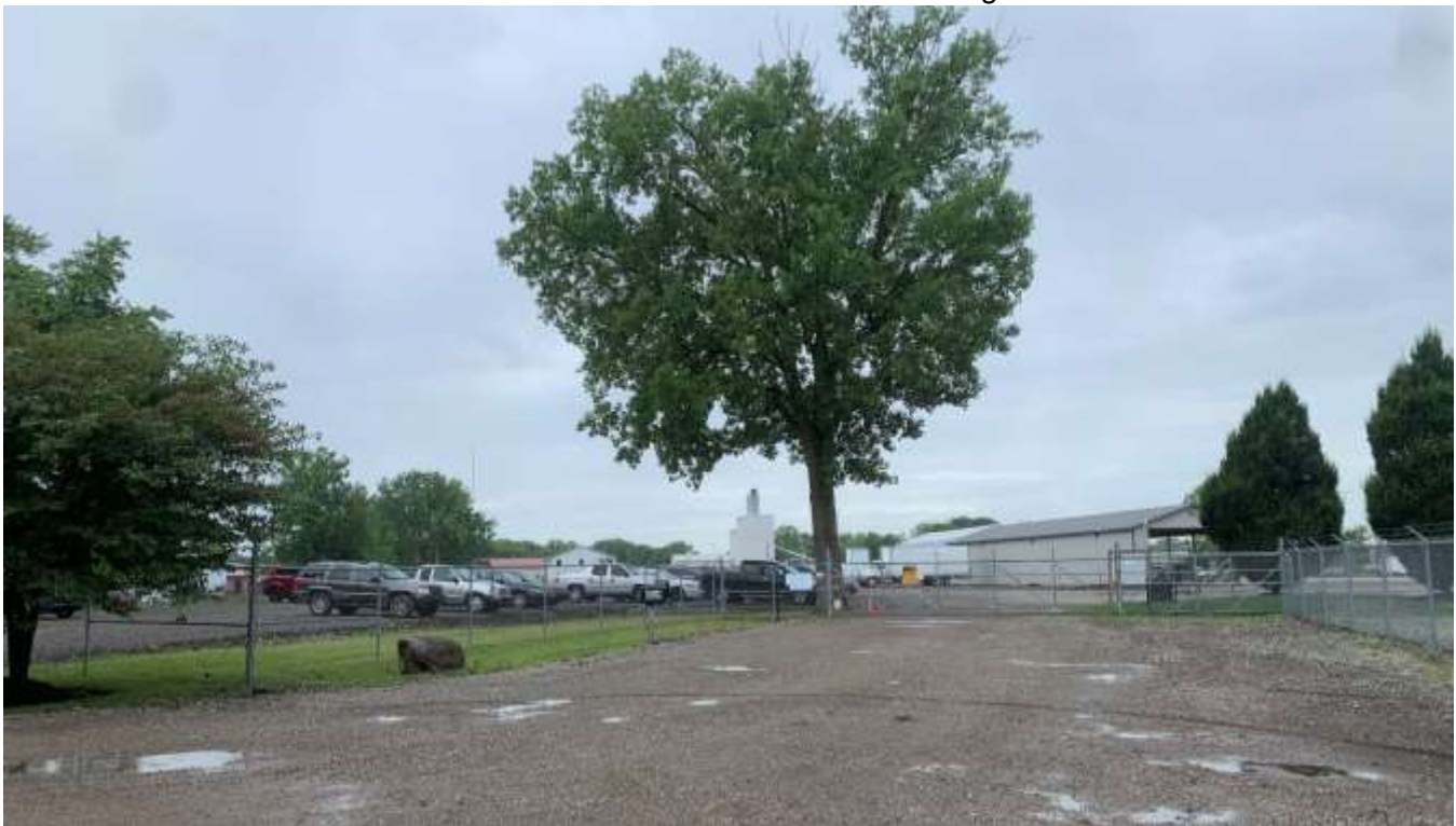
Photo of the concrete contractor business to the west.