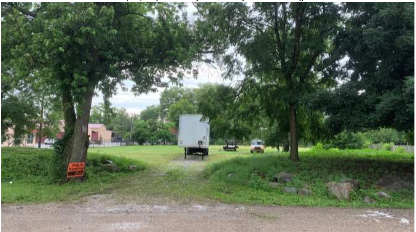
Photo of the subject site looking east.