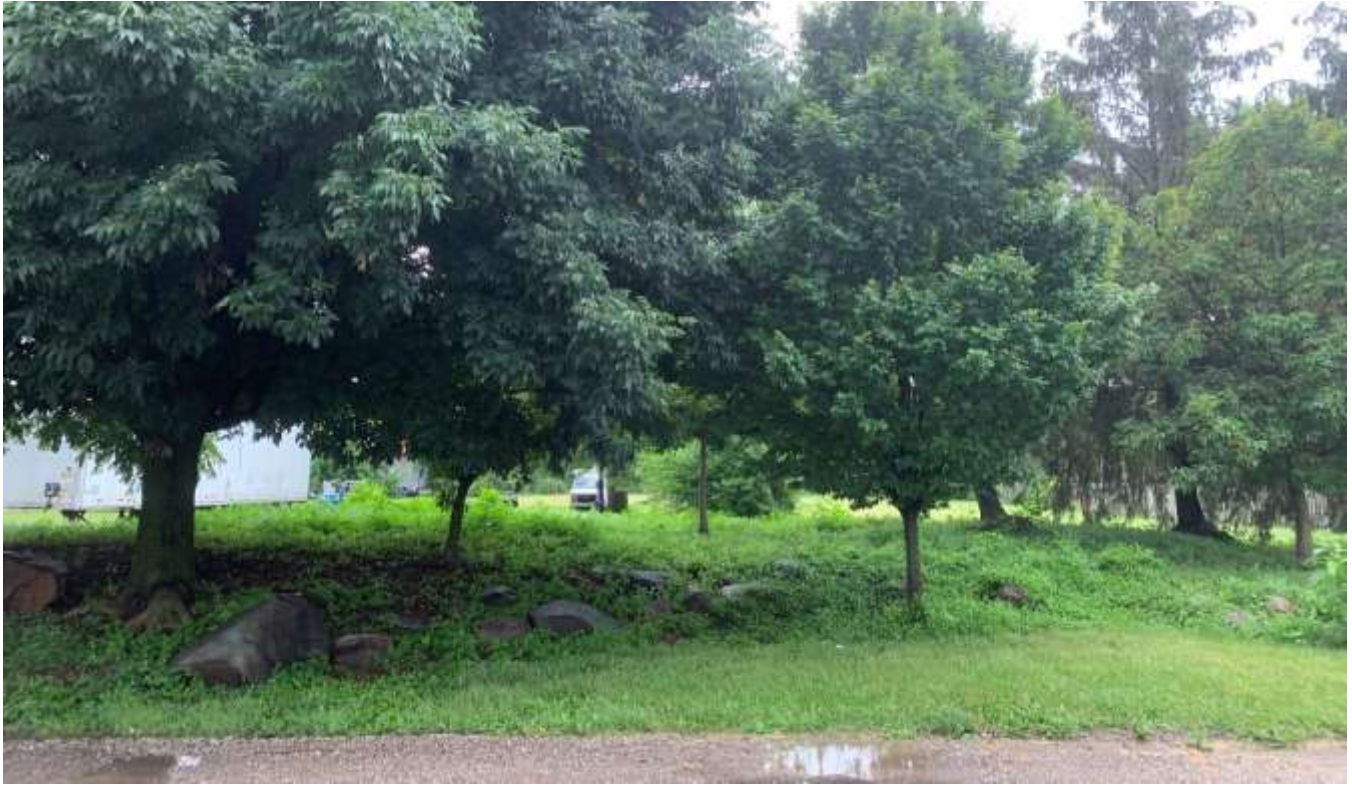
Photo of the subject site looking east.