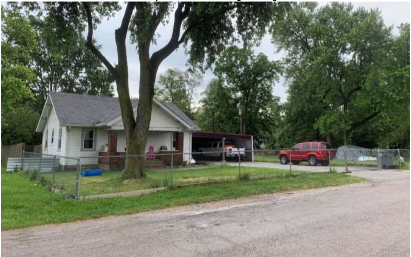
Photo of a single-family dwelling south of the site.