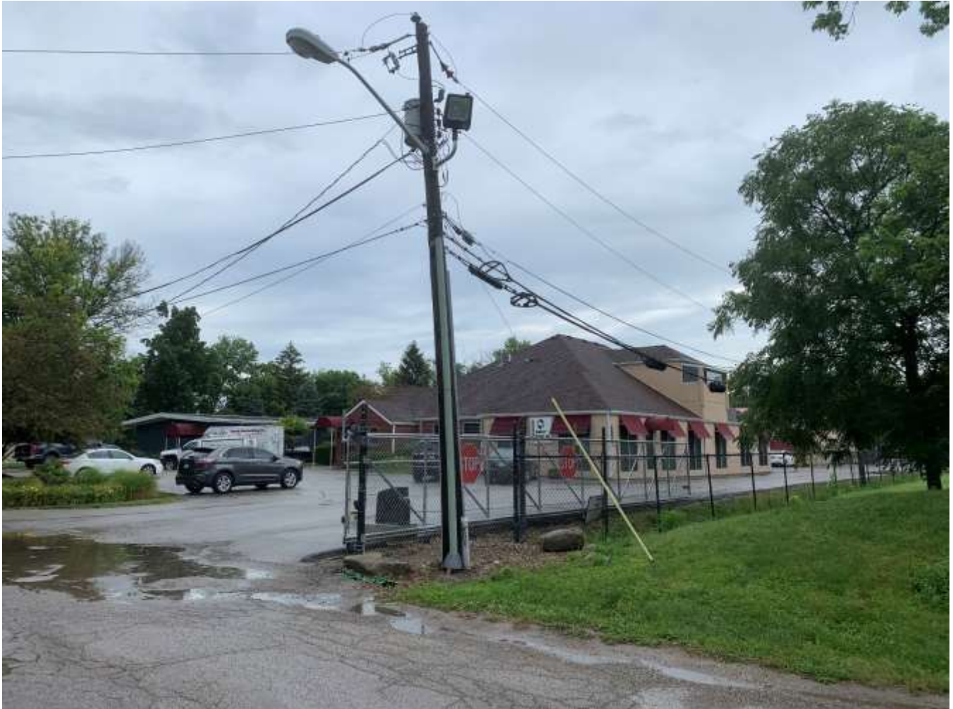
Photo of the drywall contractor business to the north.