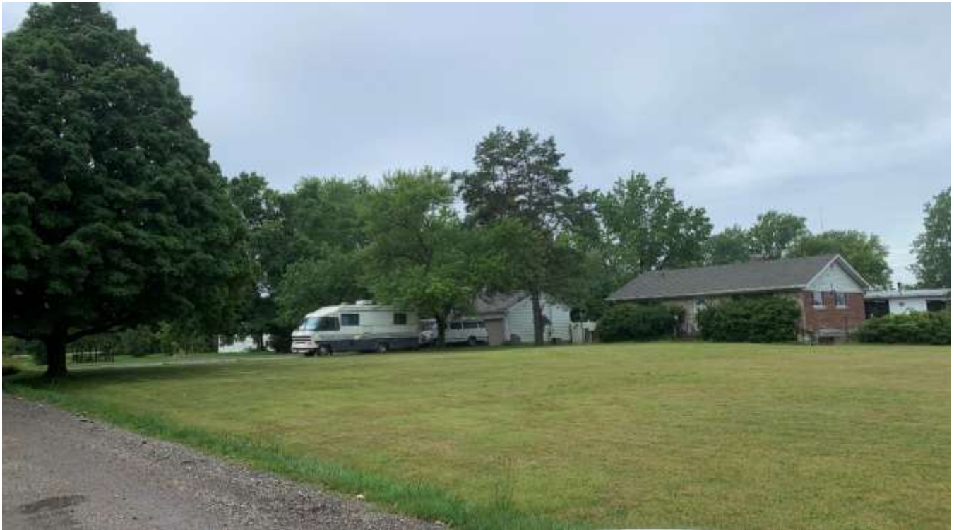
Photo of single-family dwellings southwest of the site.