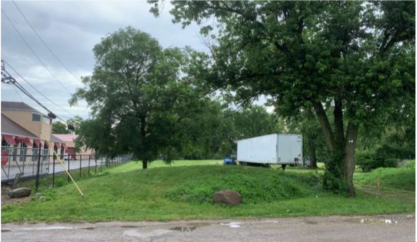
Northern property boundary of the subject site looking east.