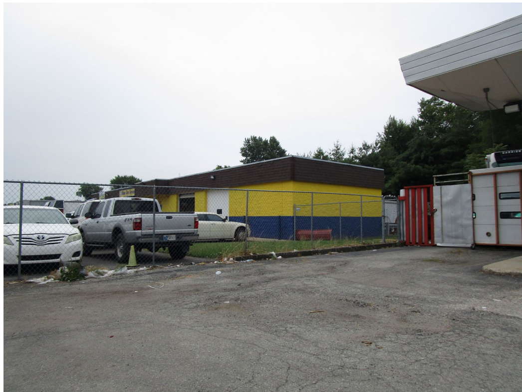
View of site looking southwest from adjacent property to the north