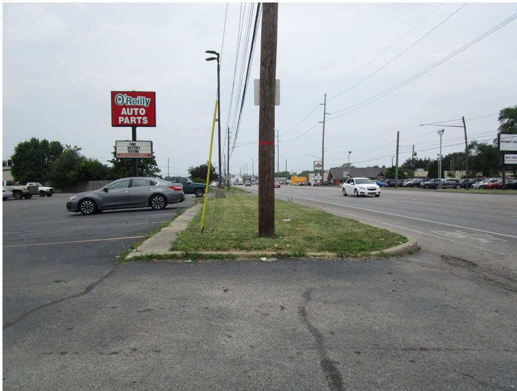
View looking north along Lafayette Road