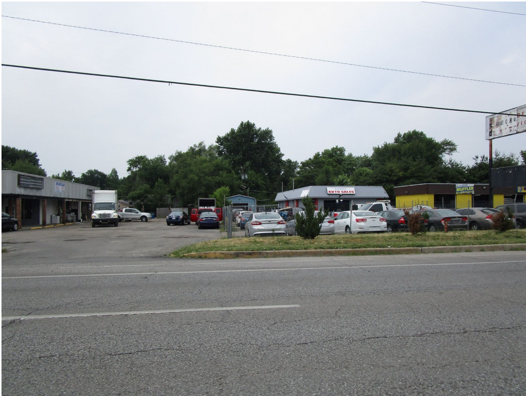
View of adjacent uses to the south of site looking west, across Lafayette Road