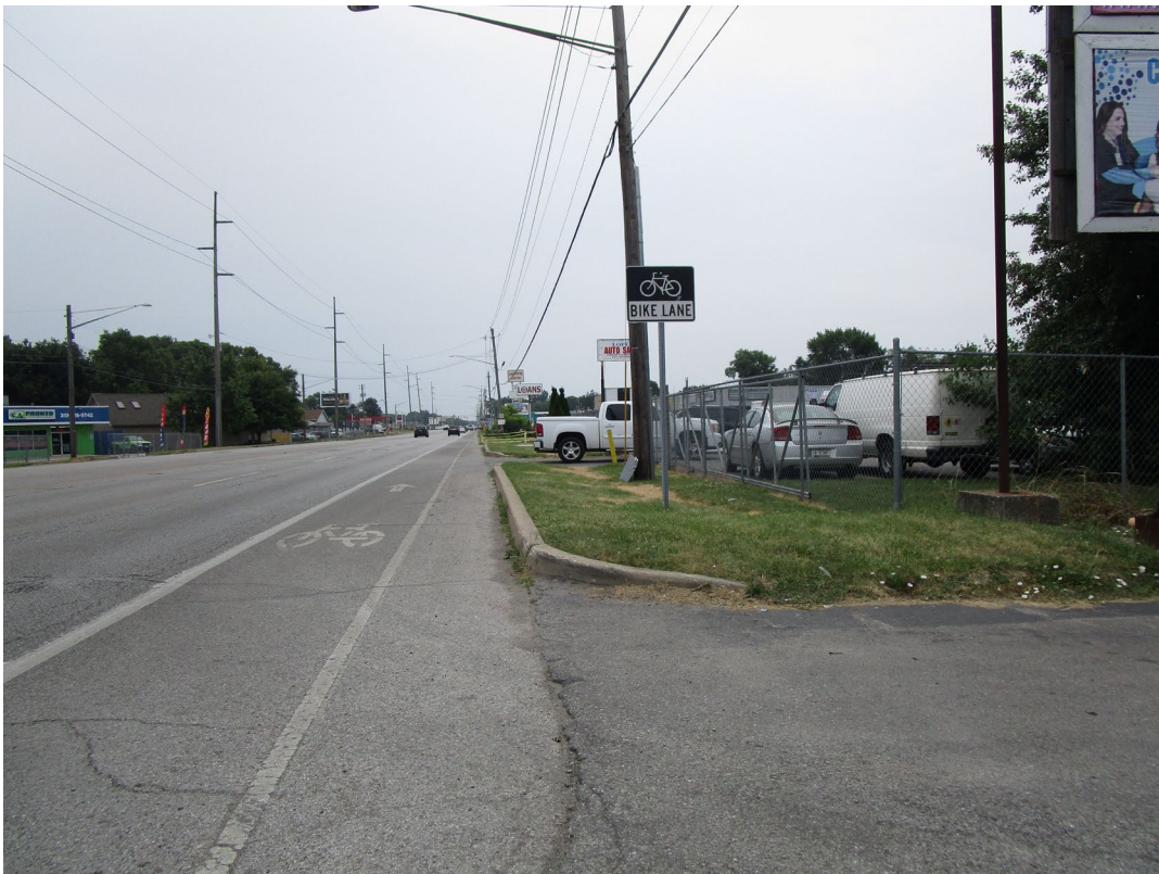
View looking south along Lafayette Road