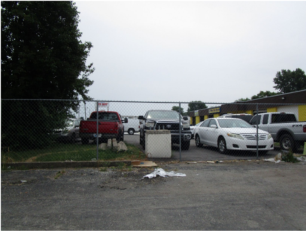
View of site looking south from adjacent property to the north