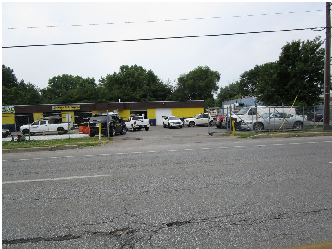
View of site looking west across Lafayette Road