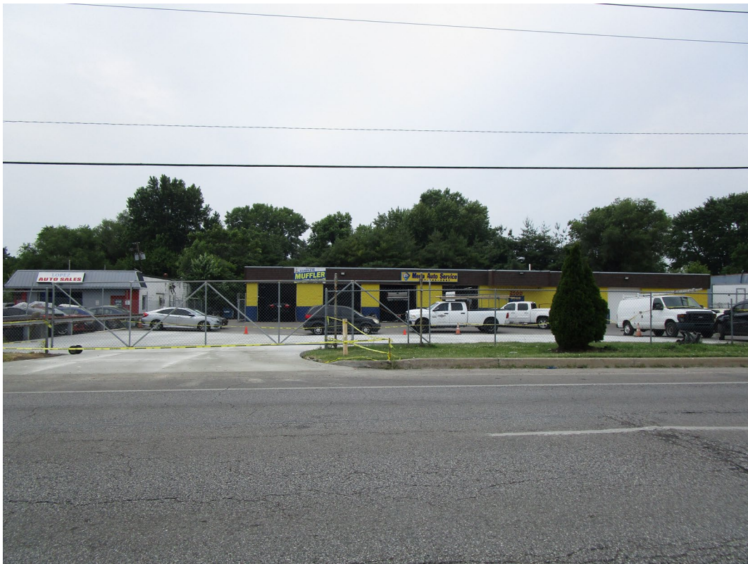
View of site looking west across Lafayette Road