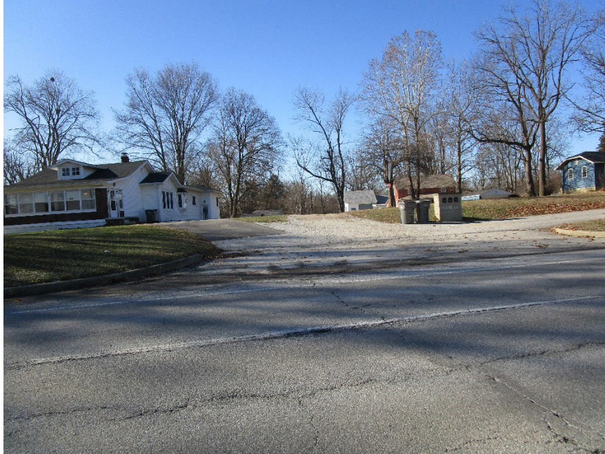
View of site looking west across Madison Avenue