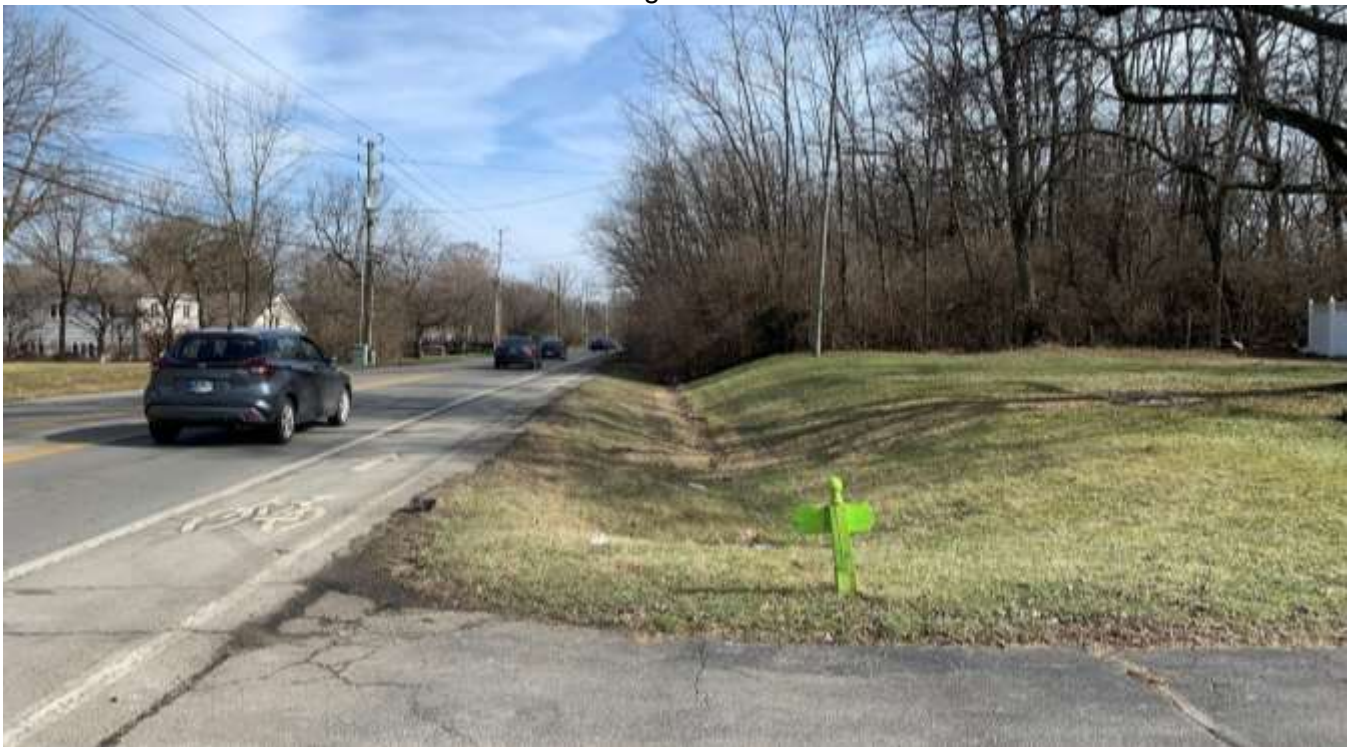
Photo of the street frontage east of the entrance drive.