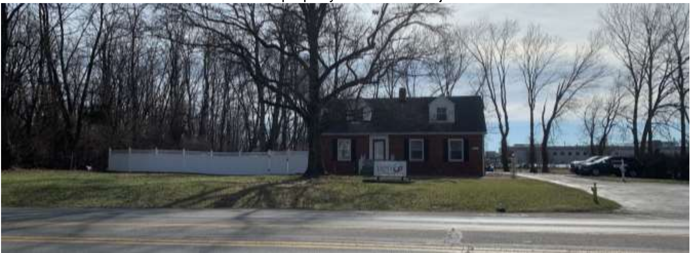
Photo of the subject site.