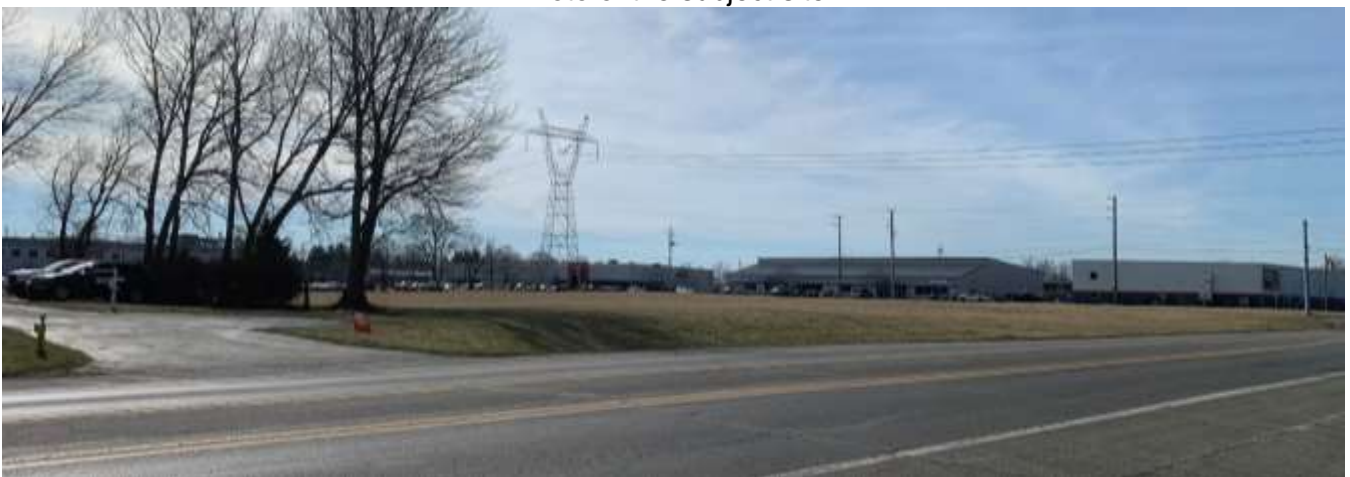
Photo of the property west of the subject site.