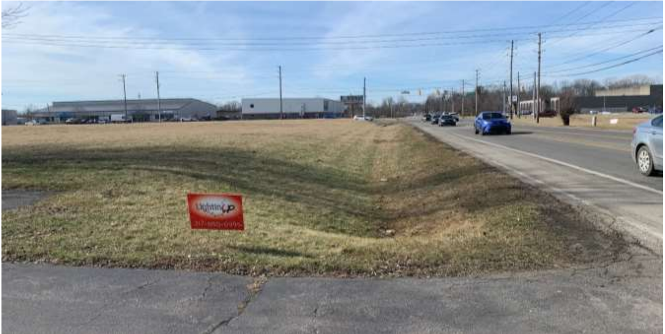
Photo of the street frontage west of the entrance drive.