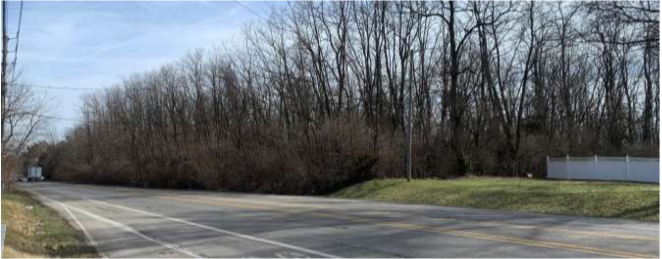
Photo of the property east of the subject site.