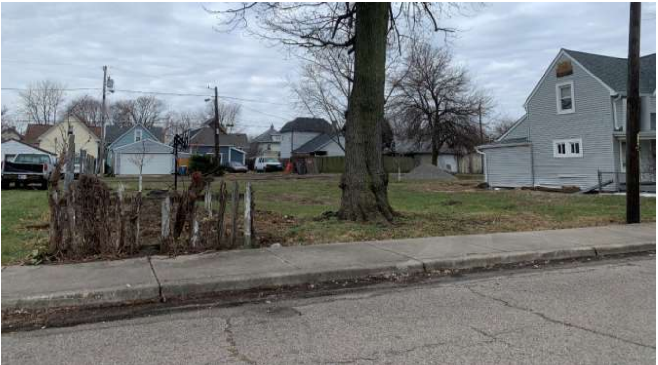
Undeveloped lots and single-family dwelling to the north.