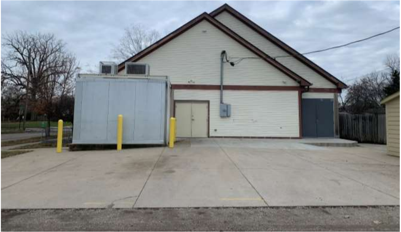
Photo of the subject site at 303 North Elder Avenue looking west from the alley.