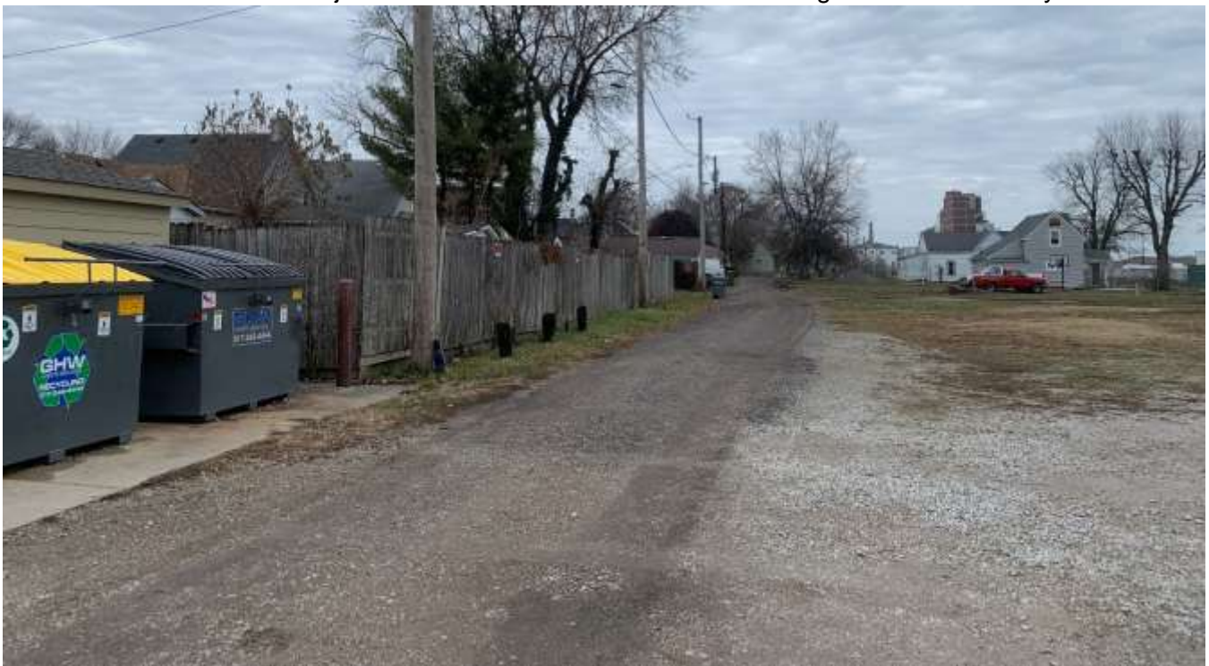
Photo of the alley that splits the subject sites looking north.