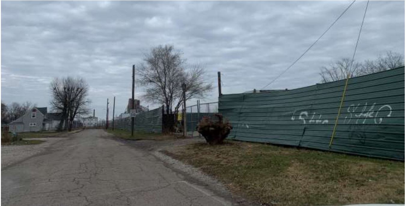
Industrial site east of the site.