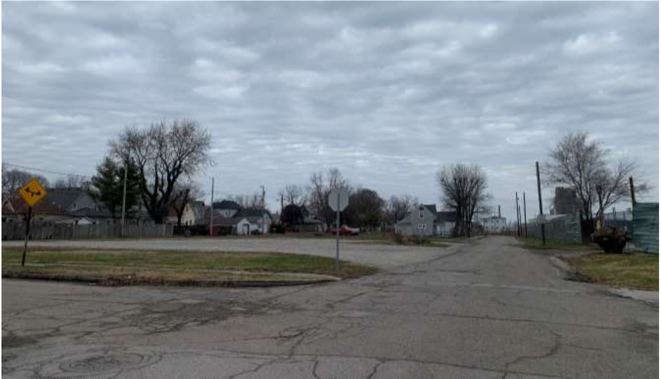
Photo of the subject site to the left looking north along Miley Avenue.