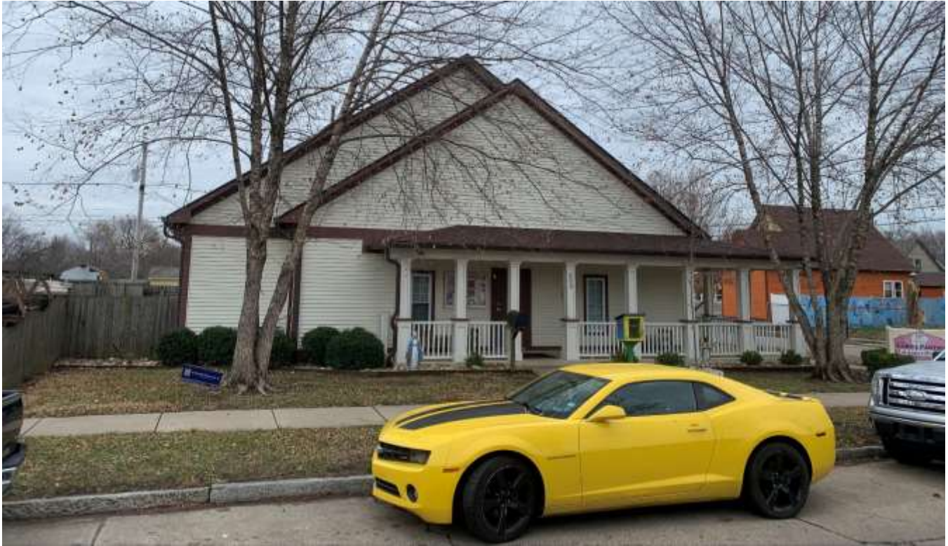
Photo of the subject site at 303 North Elder Avenue