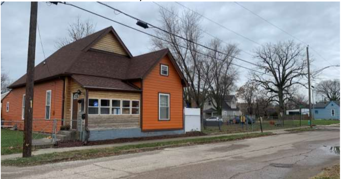
Photo of the playground at 1821 West New York Street to the right of the residential building.