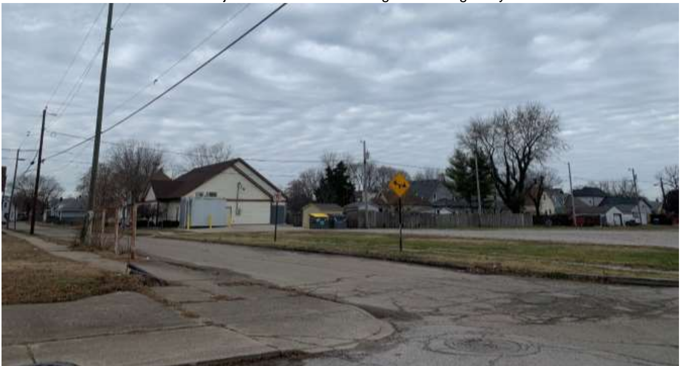
Photo of the subject site looking west toward New York Street from Miley Avenue.