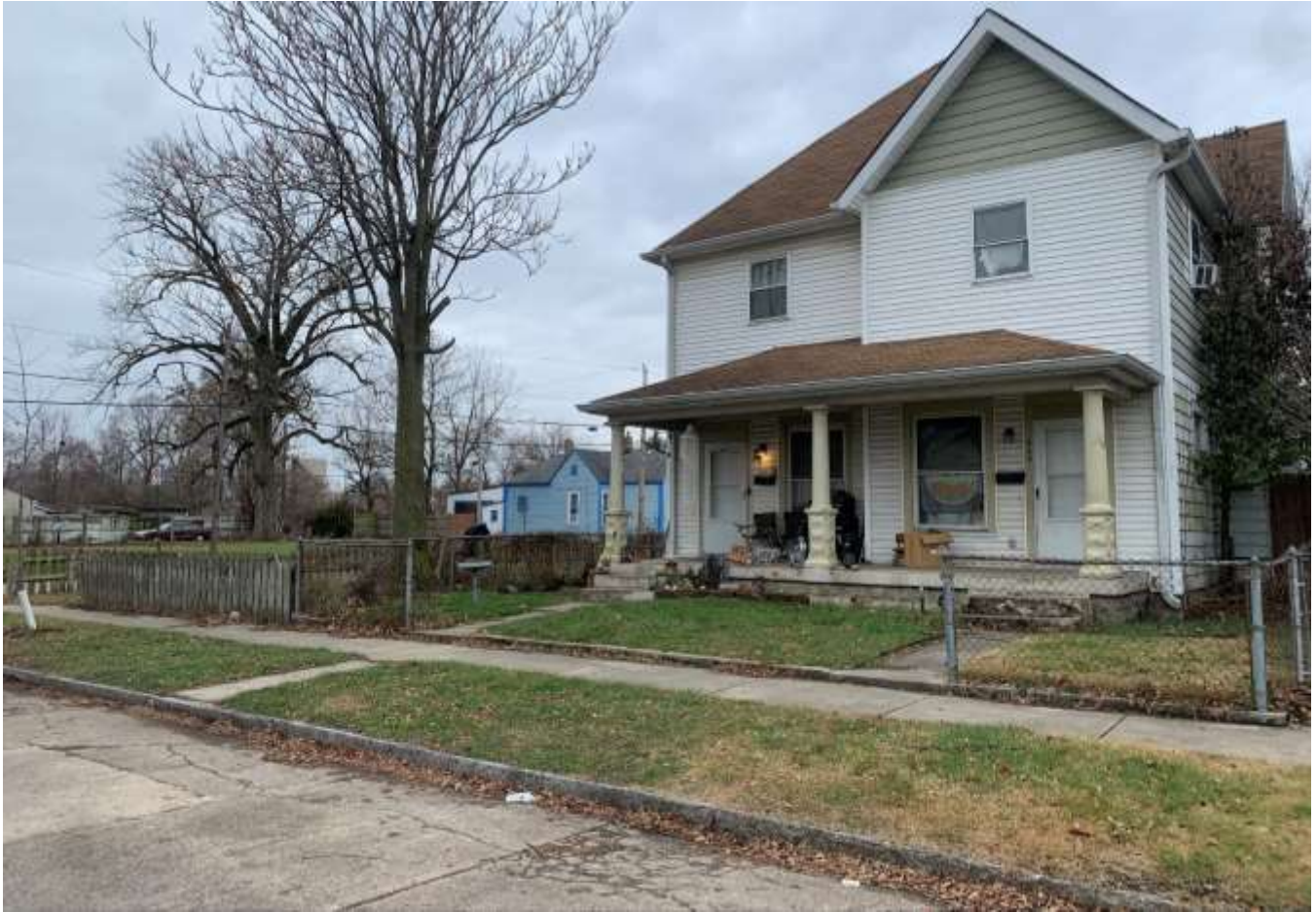
Photo of a two-family dwelling west of the site.