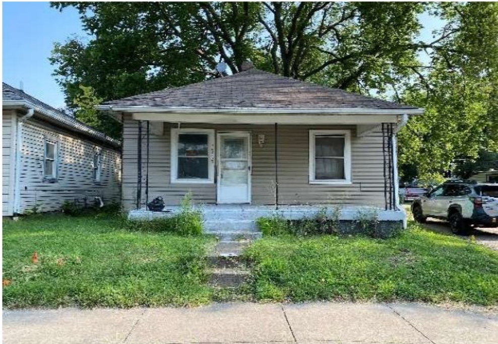
1502 Astor St. Indianapolis, IN.