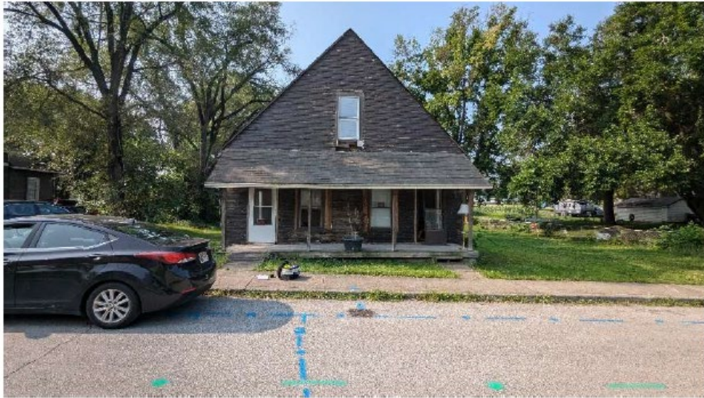
1443/1445 Saulcy St Indianapolis