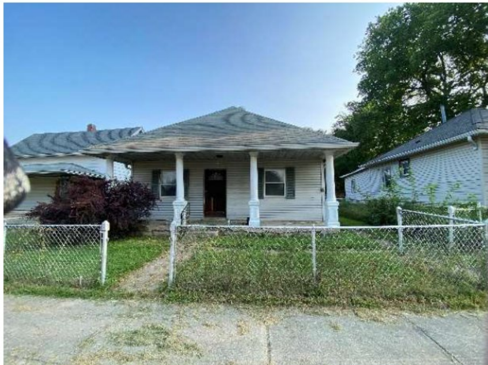
1506 Astor St. Indianapolis, IN.