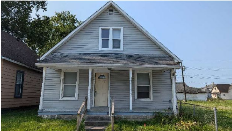
1505 Saulcy St Indianapolis