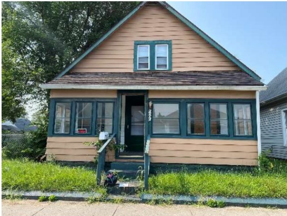
1501 Saulcy St. Indianapolis, IN.