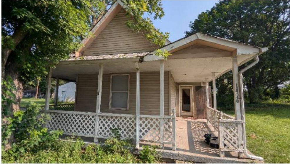
1436 Astor St Indianapolis