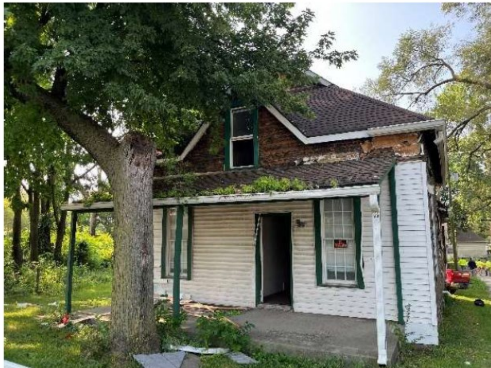
1437 Saulcy St. Indianapolis, IN.