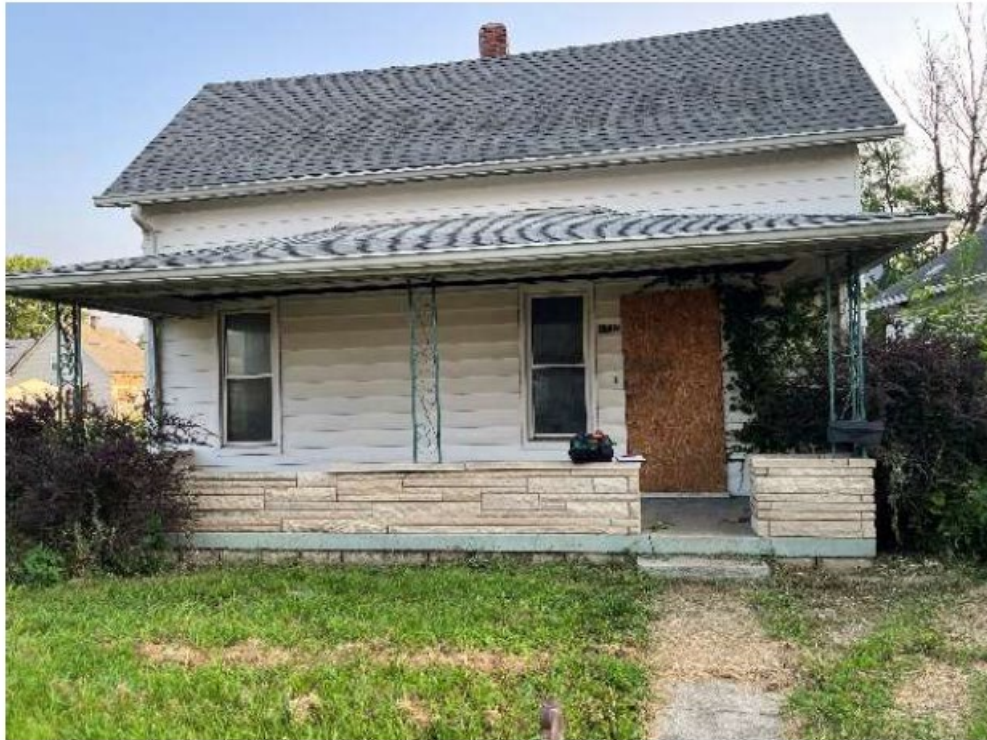
1516 Astor St. Indianapolis, IN.