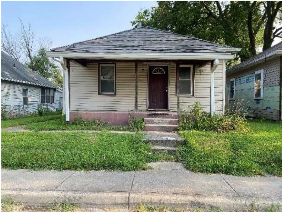
1504 Astor St. Indianapolis, IN.