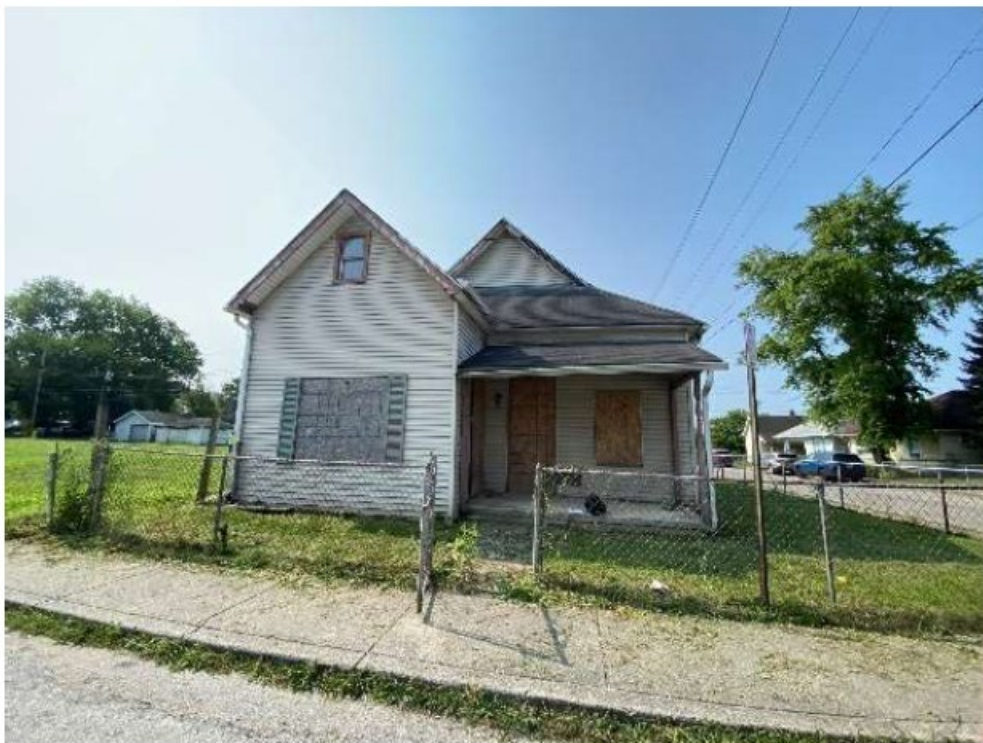
1533 Saulcy St. Indianapolis, IN.