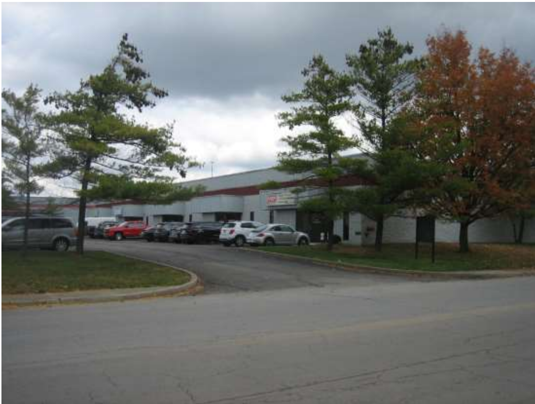
Photo of adjacent commercial contractor use to the east, looking north.