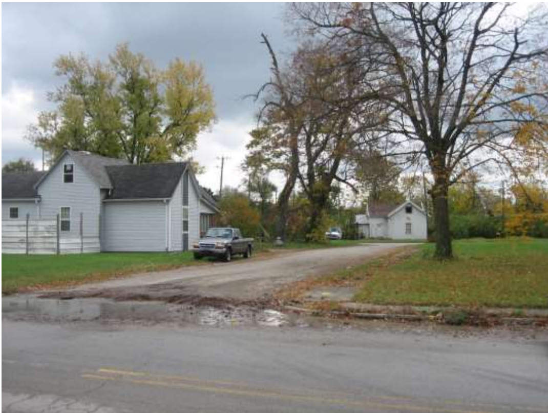
Photo of adjacent protected district to the south.