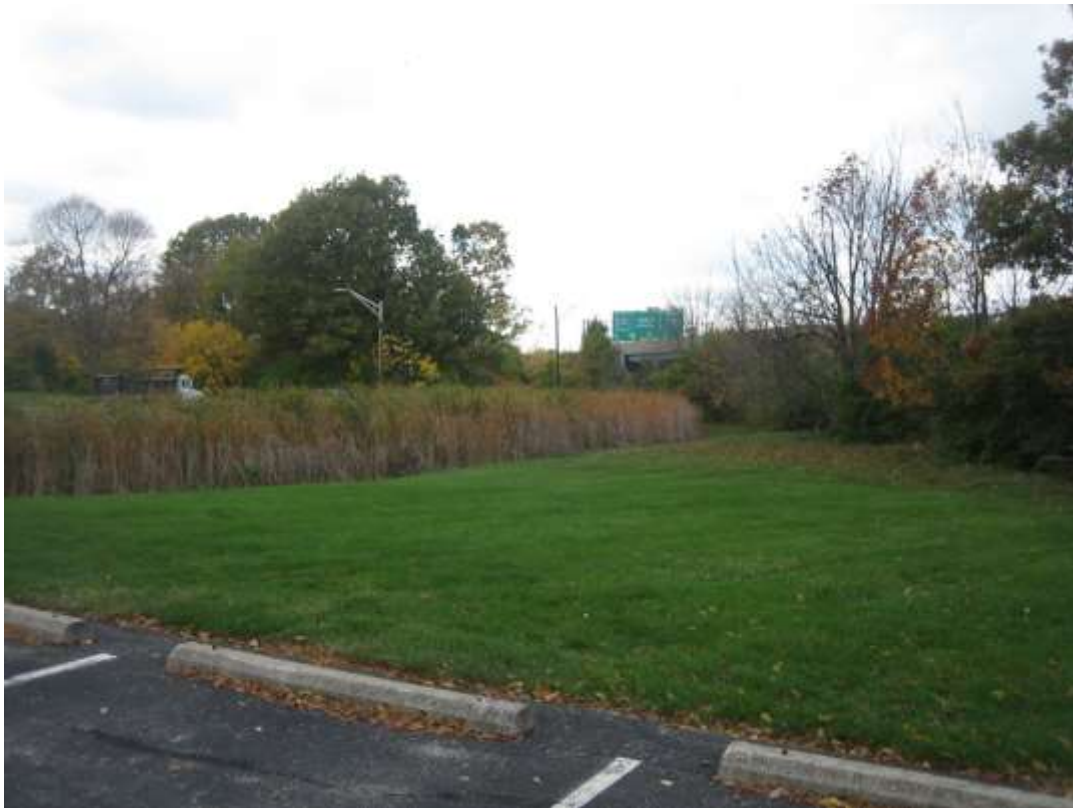
Photo of subject site, proposed sign relocation area, looking west.