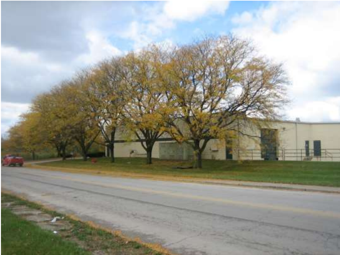
Photo of subject site, looking northwest.