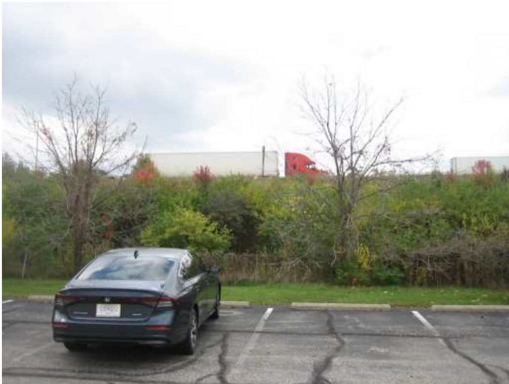
Photo of adjacent Interstate I-70 elevation, looking north