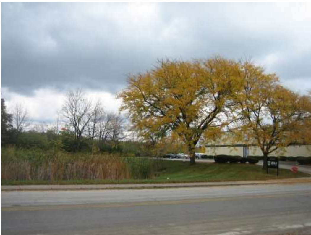
Photo of subject site, proposed sign relocation area, looking north.