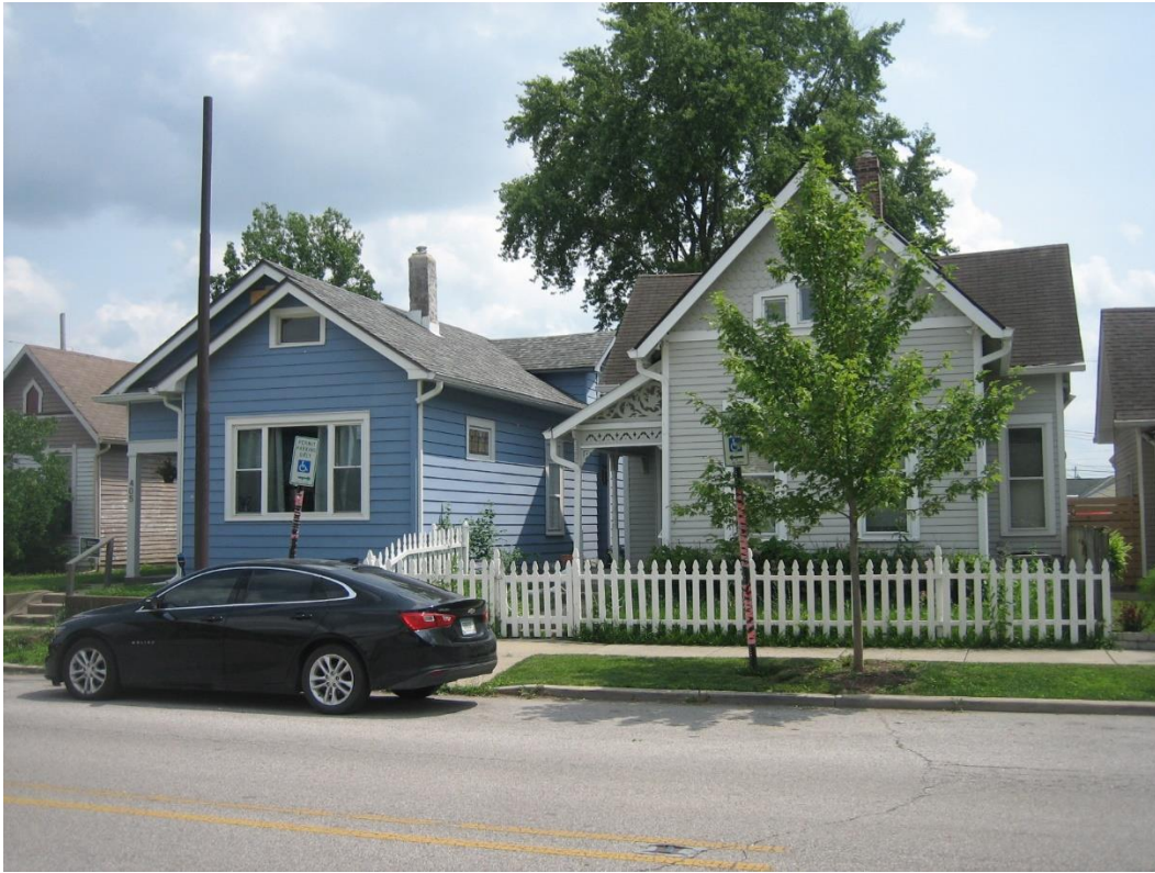
#9 - Adjacent residential protected district to the southwest approximately 108 feet, looking south.