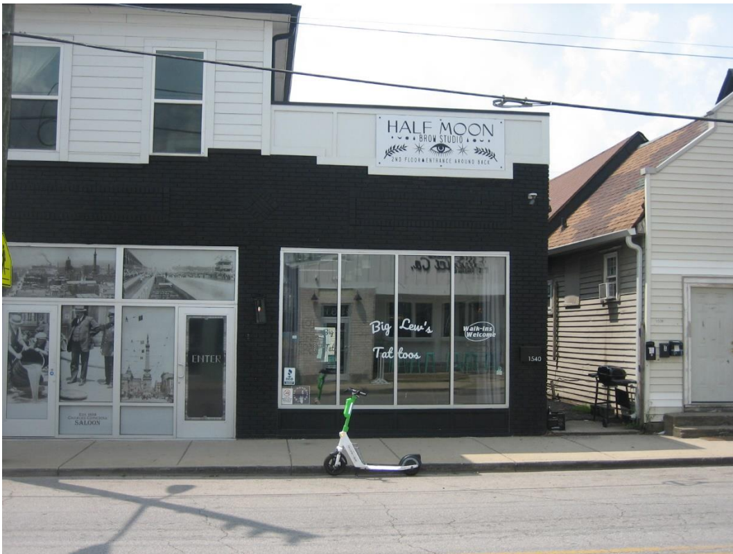
#2 - Subject site tattoo parlor tenant bay, looking west.