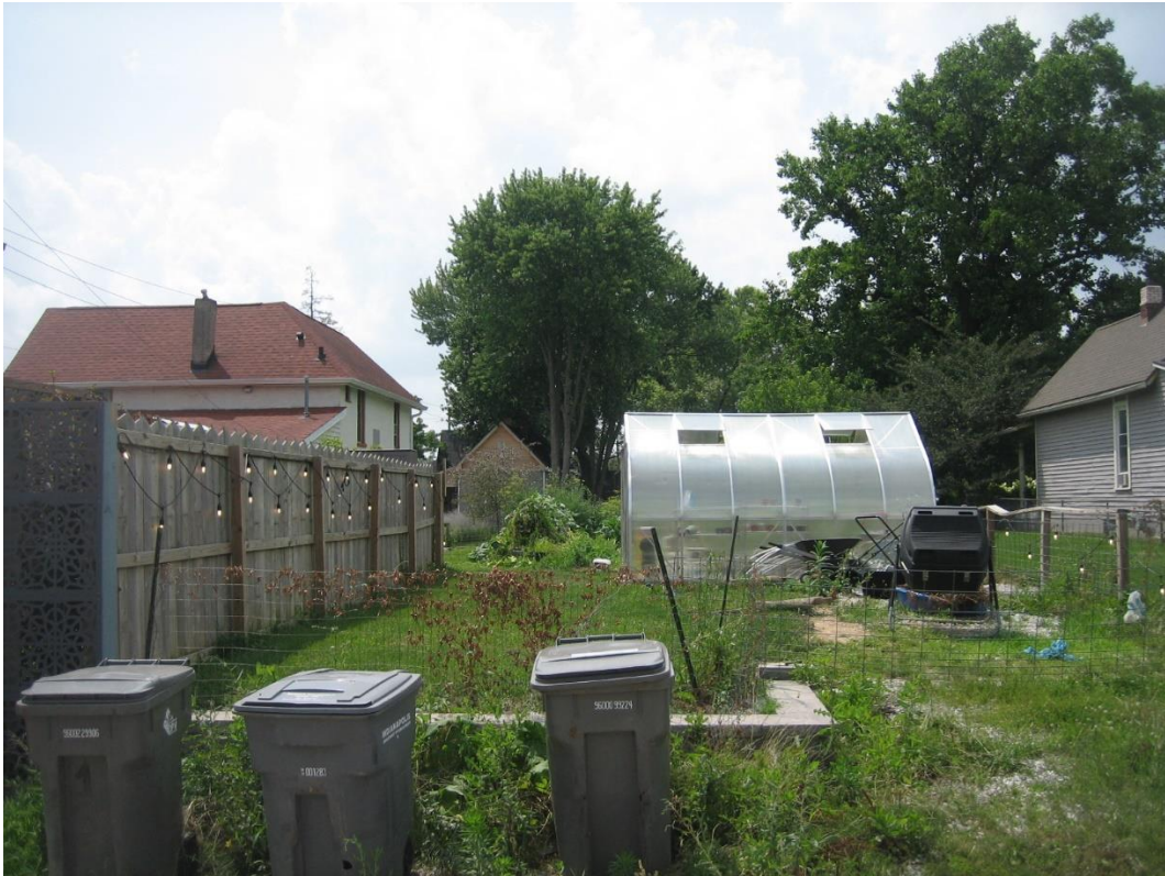
#5 - Adjacent residential protected district approximately 48 and 70 feet to the west.