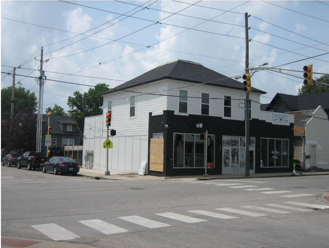
#1 - Subject site looking west.