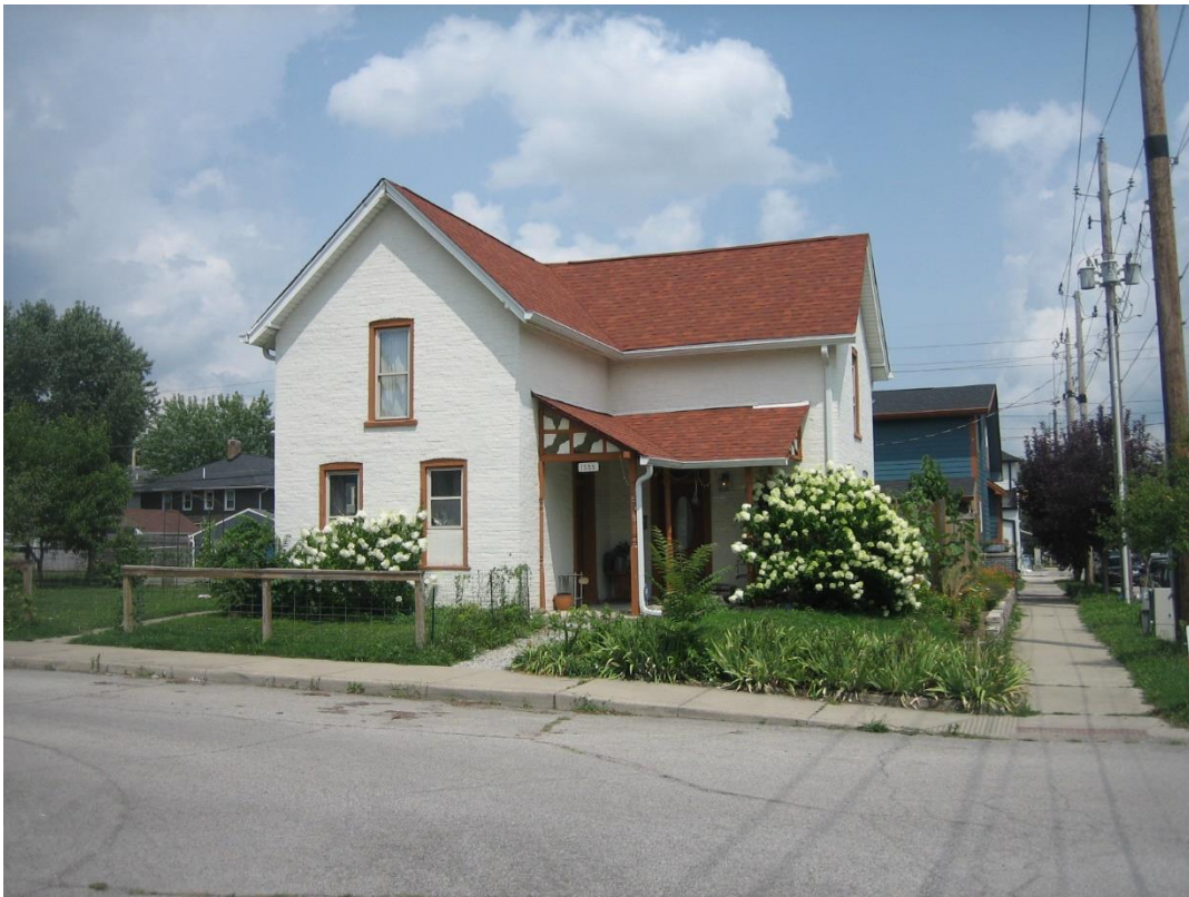
#7 - Adjacent residential protected district to the west, looking east.