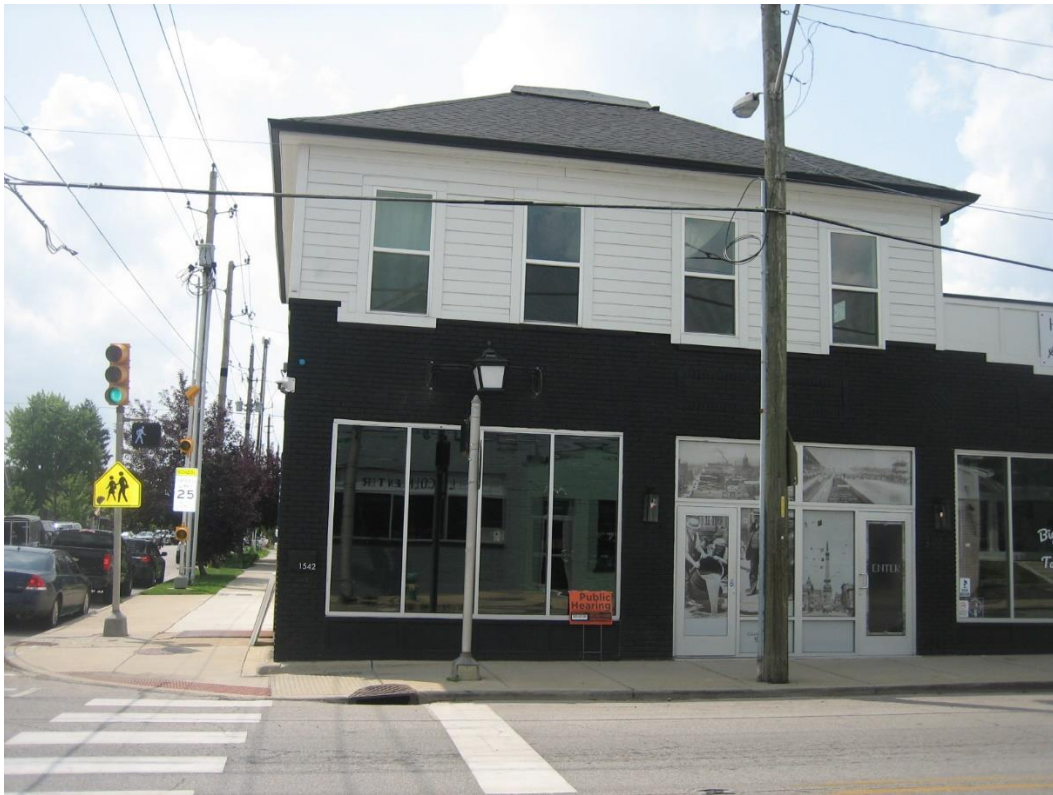
#3 - Subject site bar tenant bay, looking west.