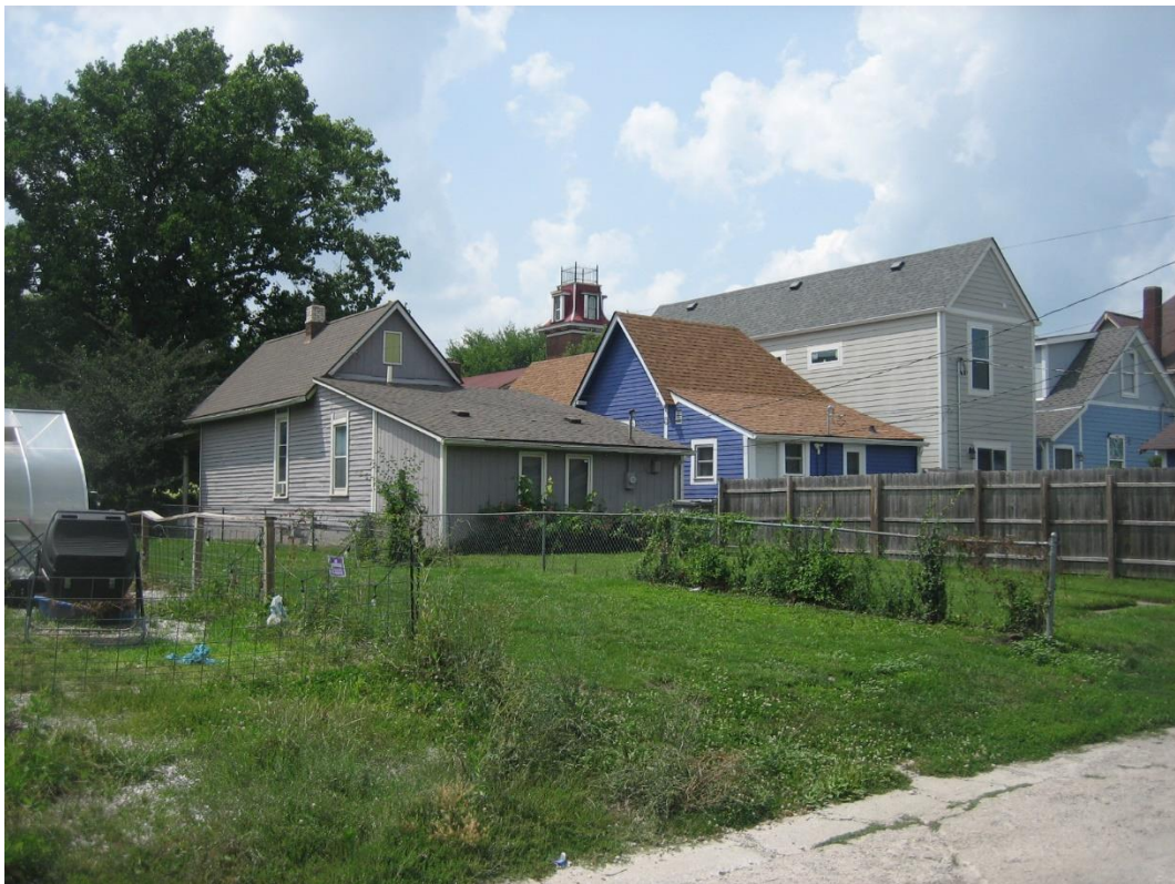
#6 - Adjacent residential protected district to the northwest.