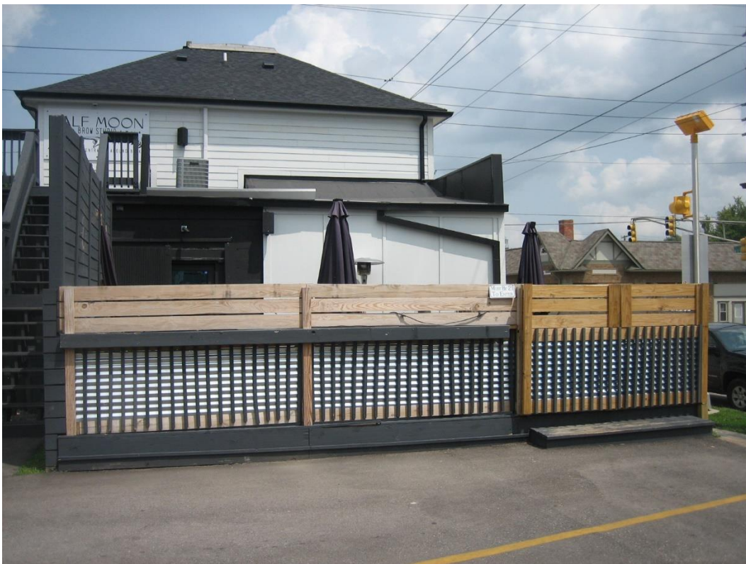
#4 - Subject site bar tenant bay rear patio with speakers, looking east