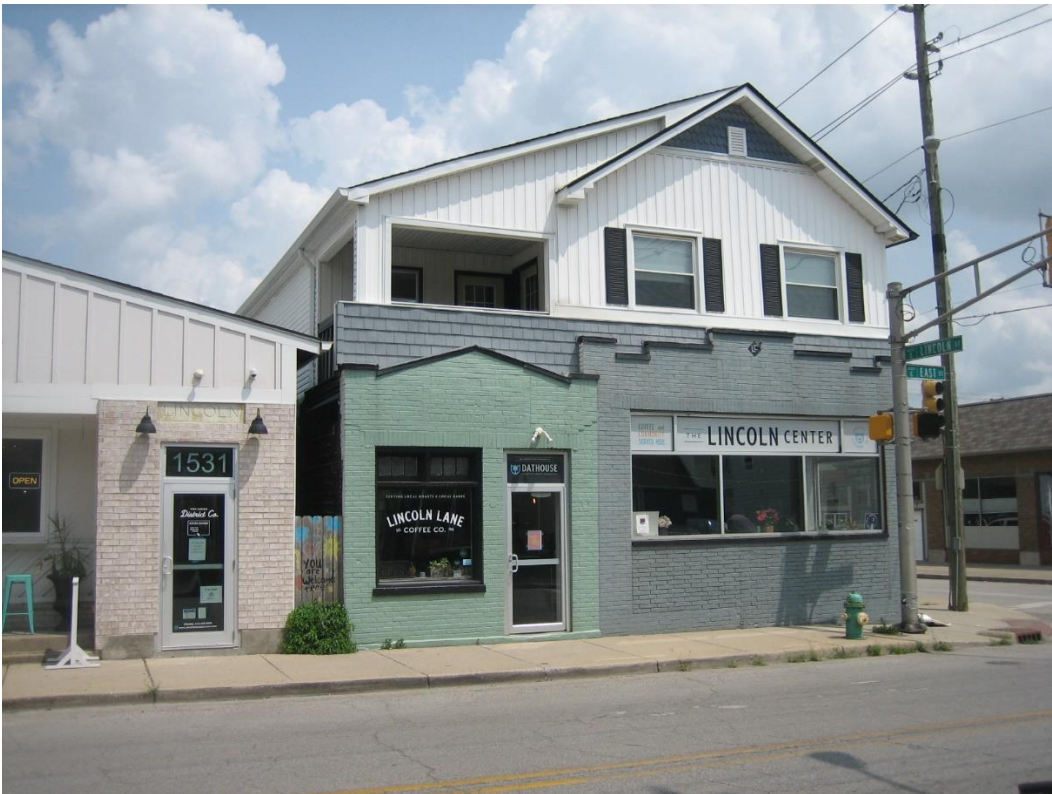
#9 - Adjacent mixed use to the east, with commercial retail and apartments zoned C-3.