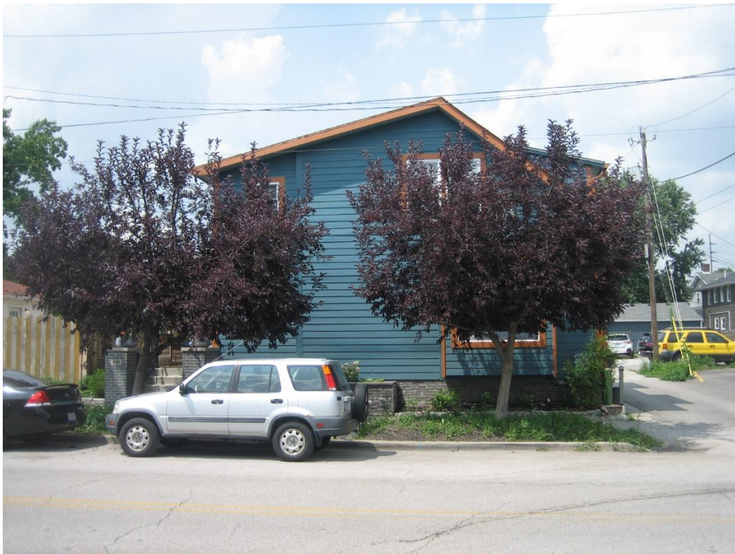
#8 – Adjacent residential use to the west, zoned C-1, looking north.