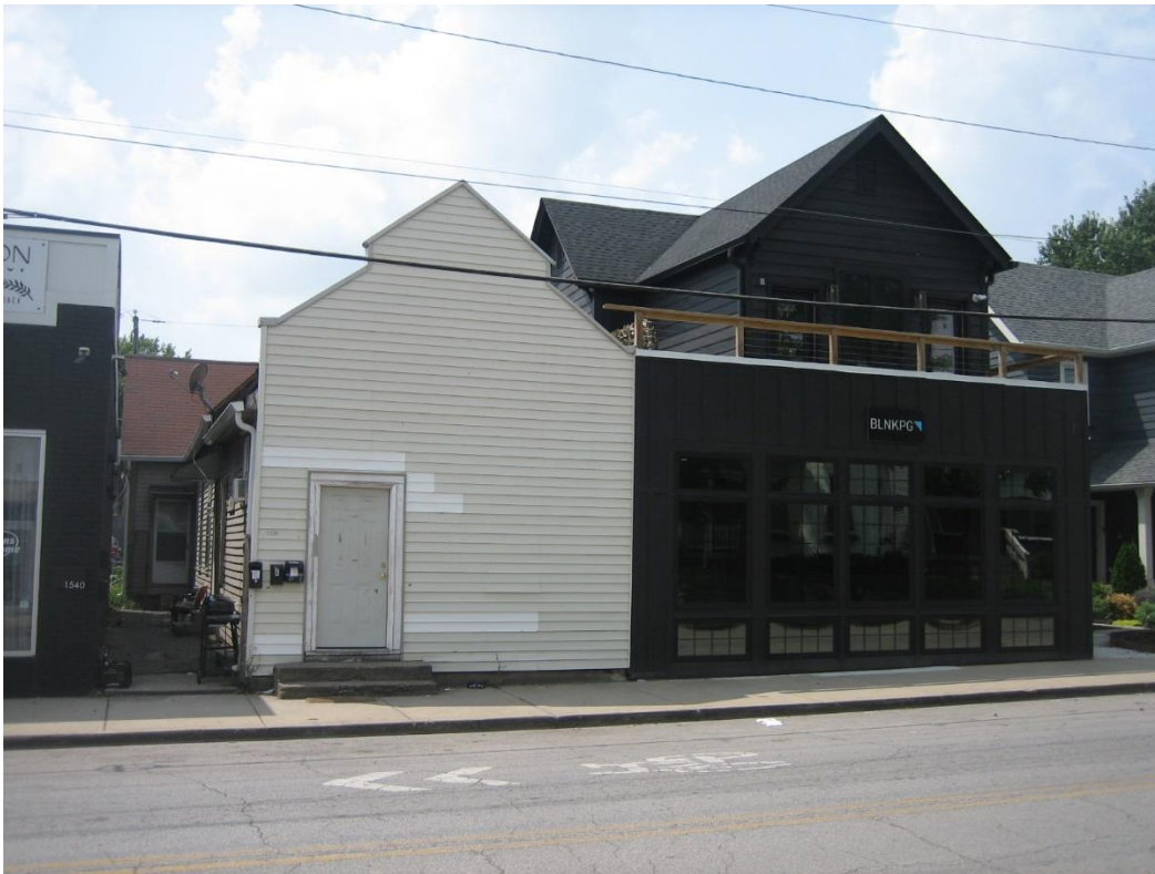
#9 - Adjacent mixed uses to the north, with multi-family apartments and commercial office zoned C-3, looking west.