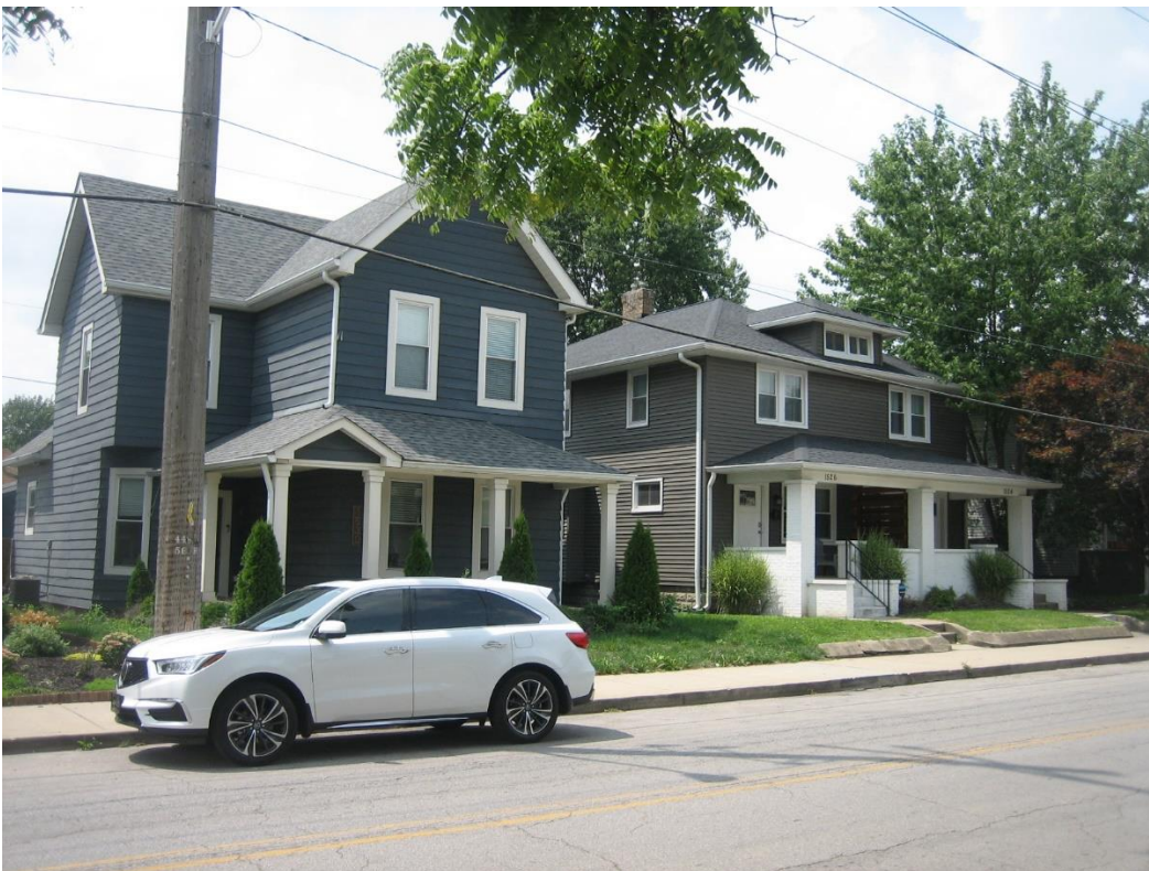
Adjacent residential protected district to the north approximately 68 feet, looking west.