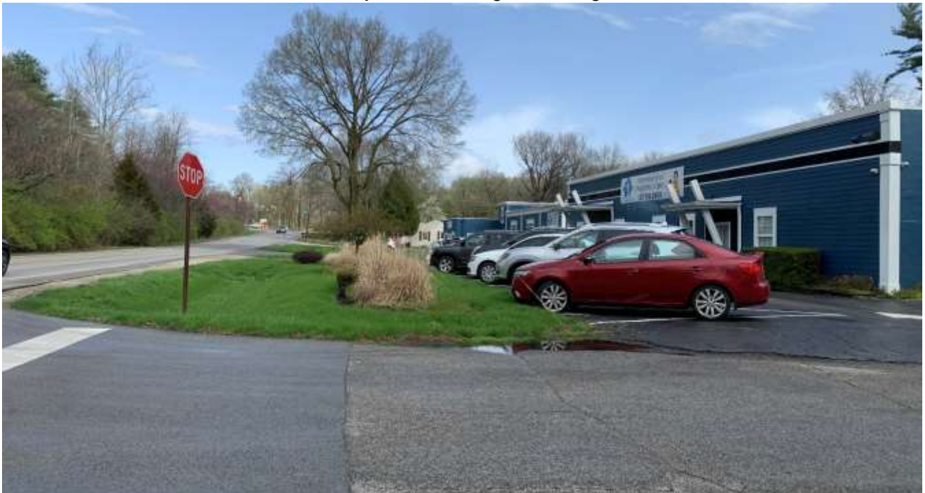
Photo of 7405 Westfield Boulevard looking north on the site.