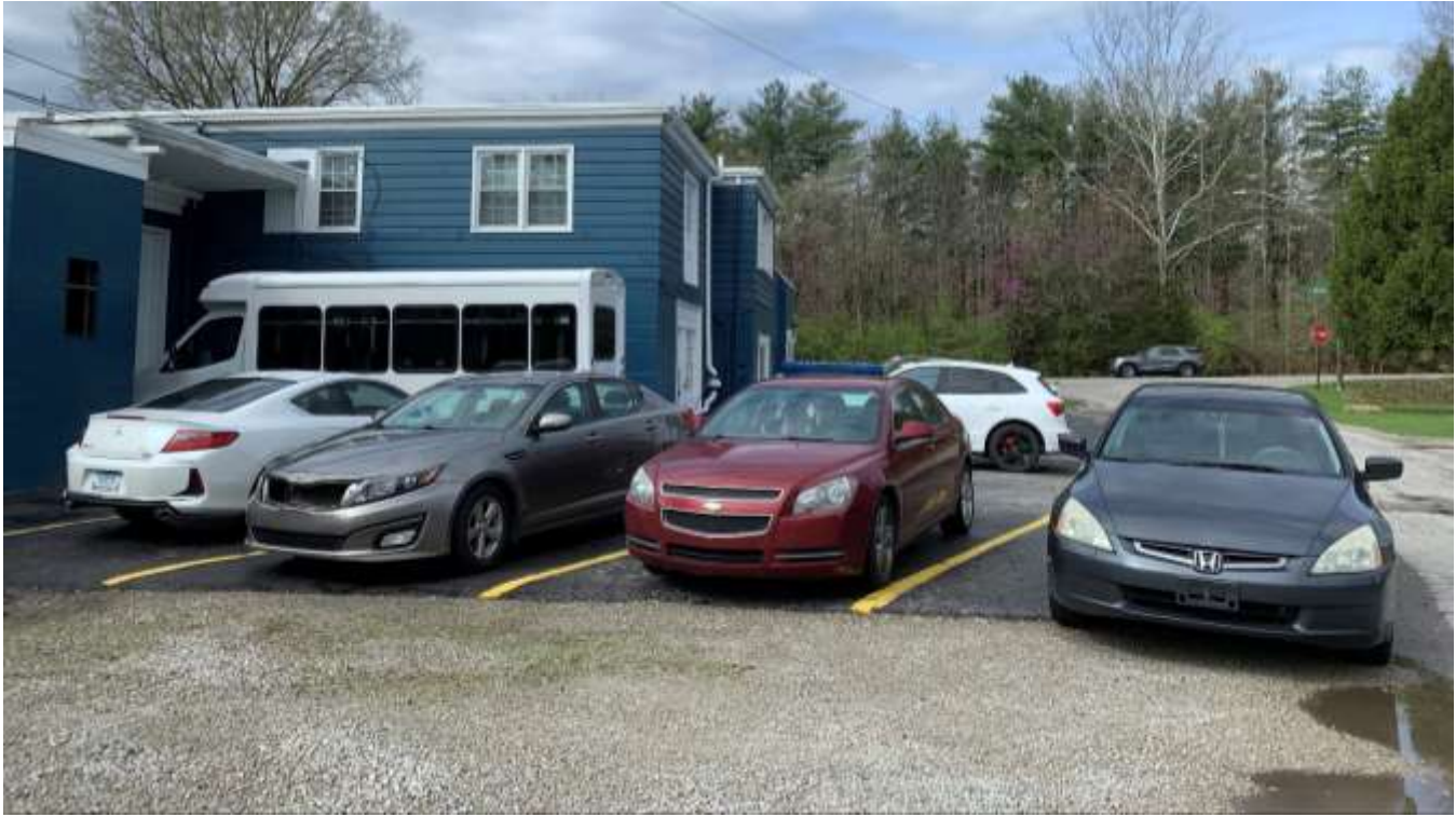
Phot of parking spaces at 7425 Westfield Boulevard.