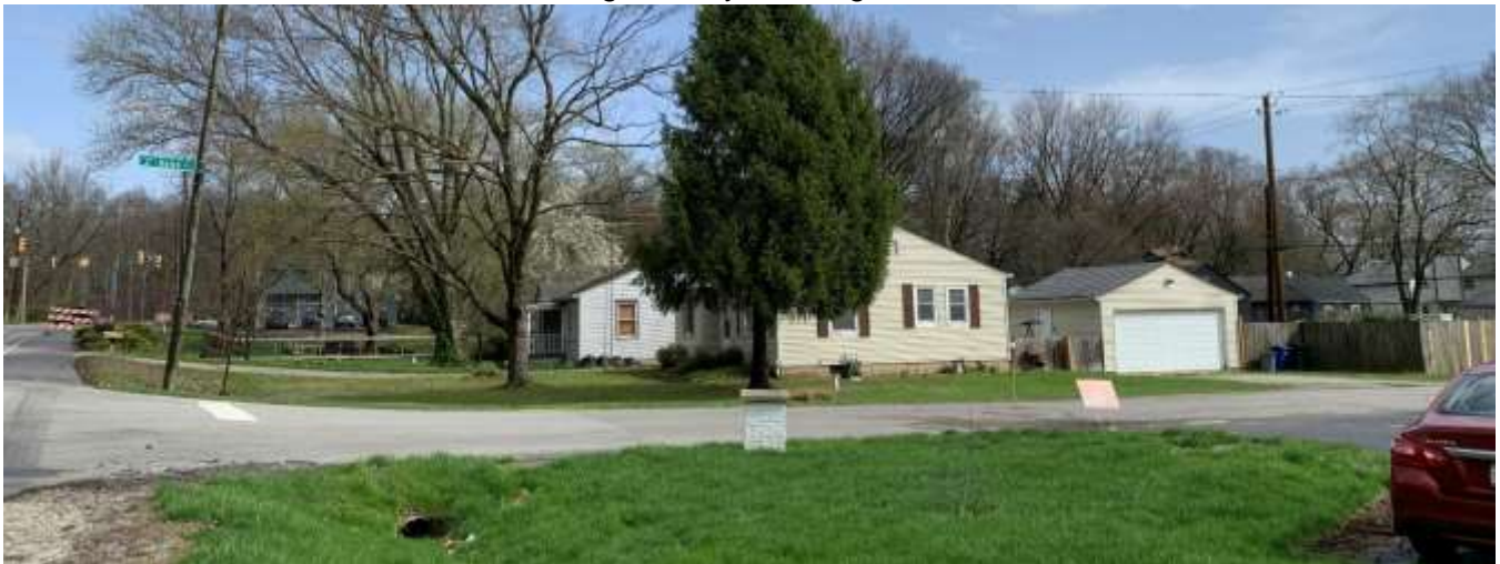
Photo of a single-family dwelling north of the site.