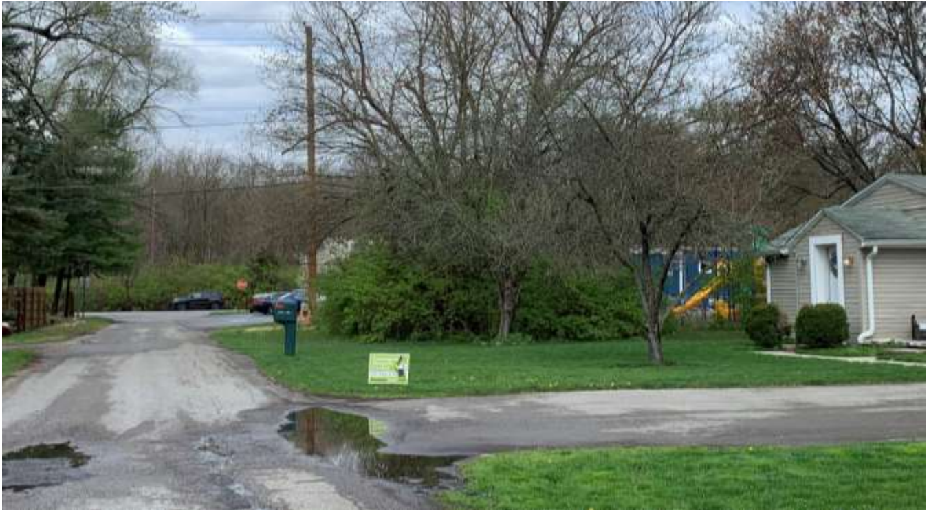
Photo of a single-family dwelling east of the site looking west on 74 th Street towards the play area.