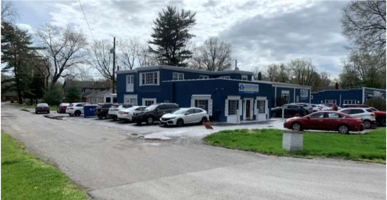
Photo of 7425 Westfield Boulevard looking southeast on the site.