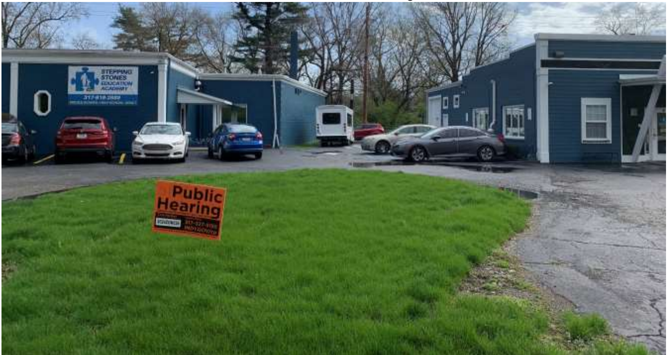
Photo of the middle of the two parcels looking east on the site.