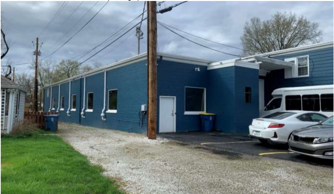
Photo of the alley east of the site looking south.