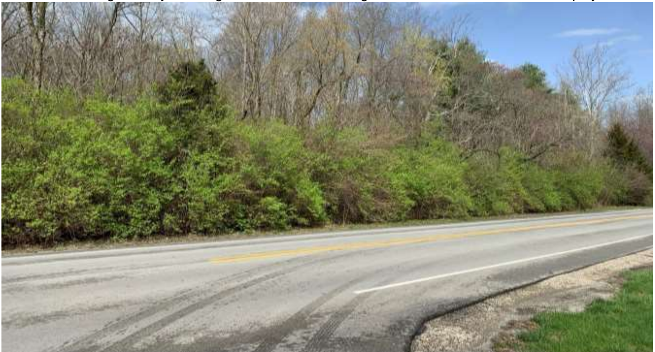
Photo of the Monon trail beyond the tree line west of Westfield Boulevard.