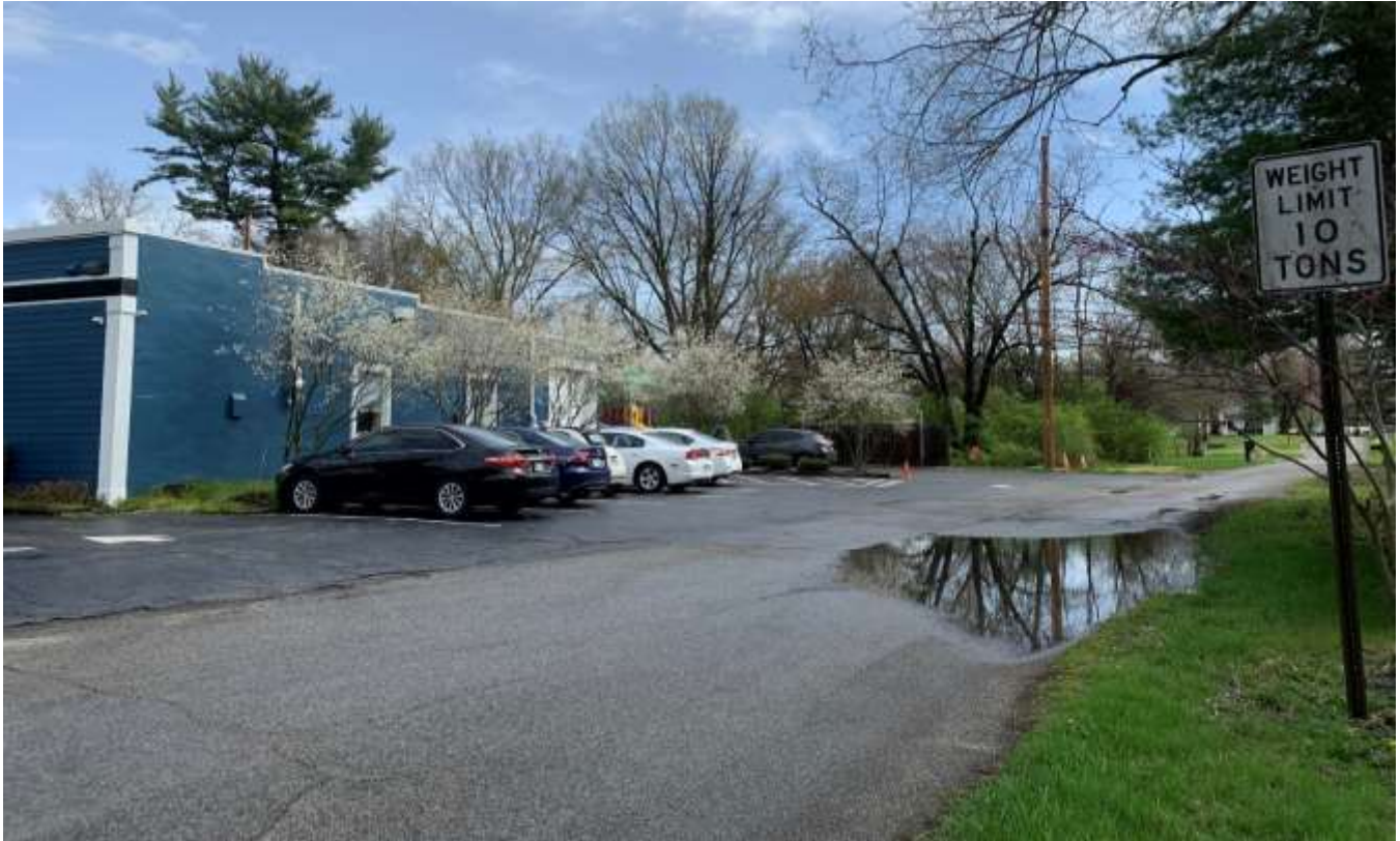
Photo of the subject site looking east along 74 th Street.