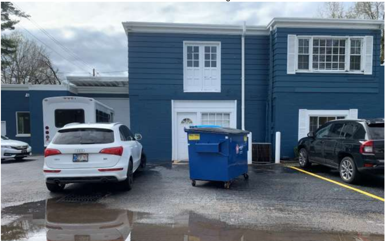
Photo of an unenclosed dumpster in the front yard.