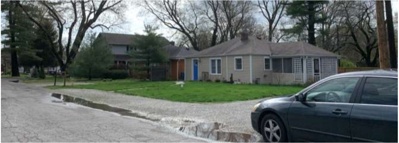
Photo of a single-family dwelling east of the site.