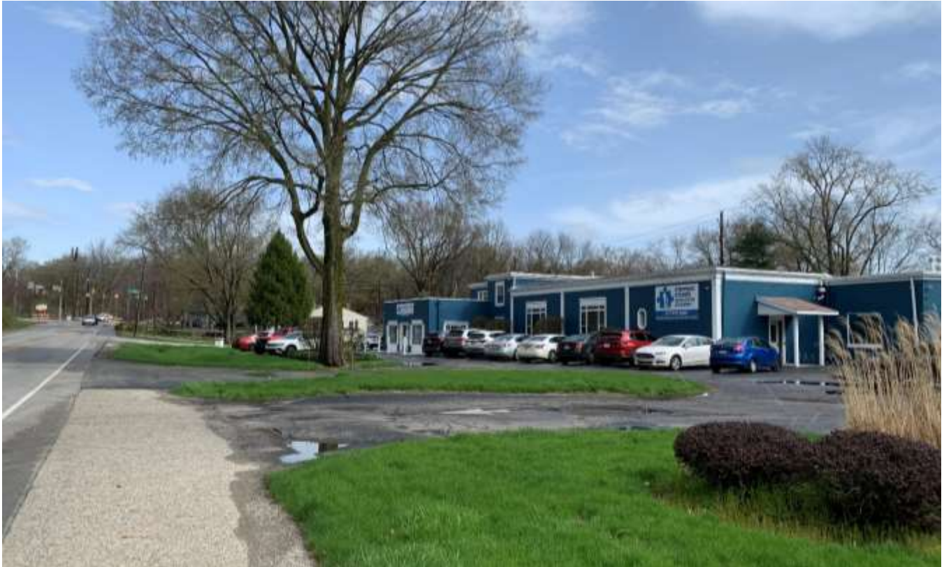
Photo of 7425 Westfield Boulevard looking north on the site.