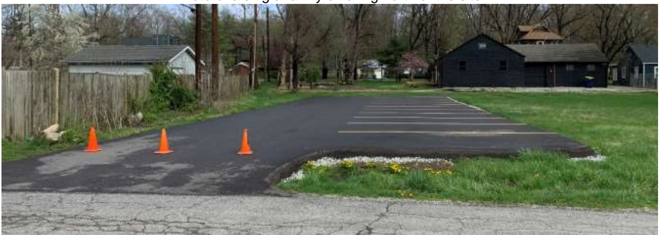
Photo of a parking lot at 7429 Westfield Boulevard that received a zoning violation.