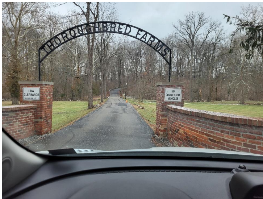
Photo 10: Thoroughbred Boulevard Access from Lafayette Road to North of Site