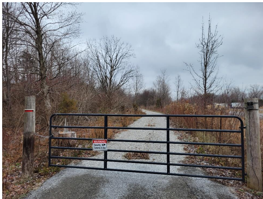
Photo 8: Fence Across Private Drive Leading to Subject Site from Northwest