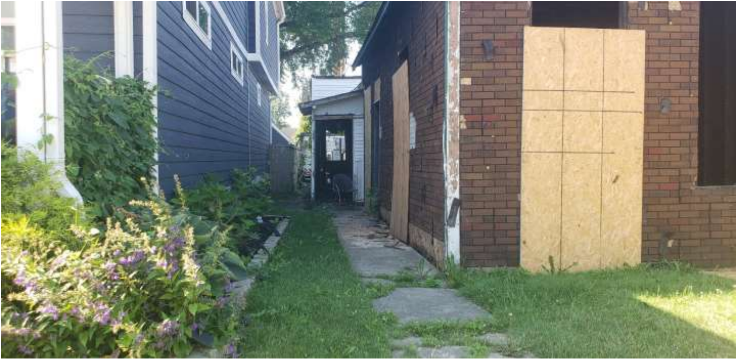
Photo of the existing east side setback.