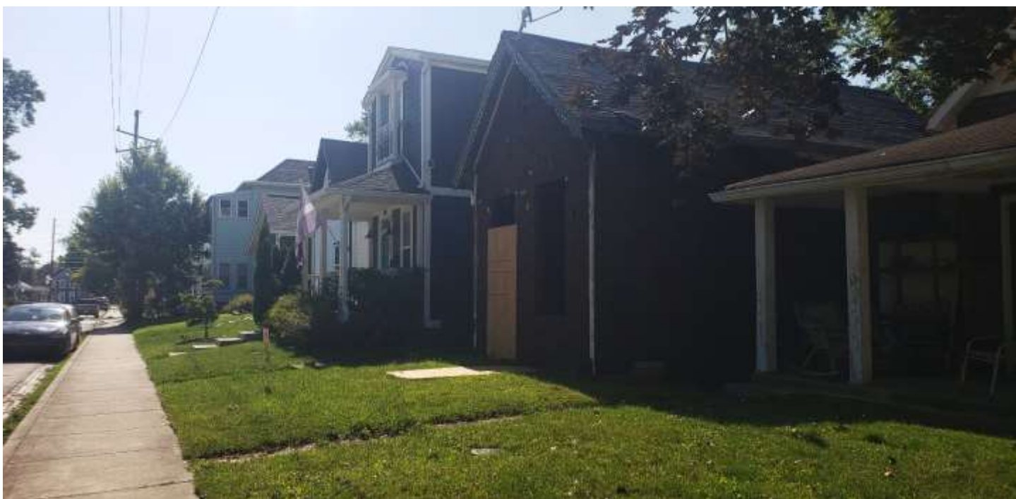
Photo of the existing front yard setback and the proposed location of the porch addition.