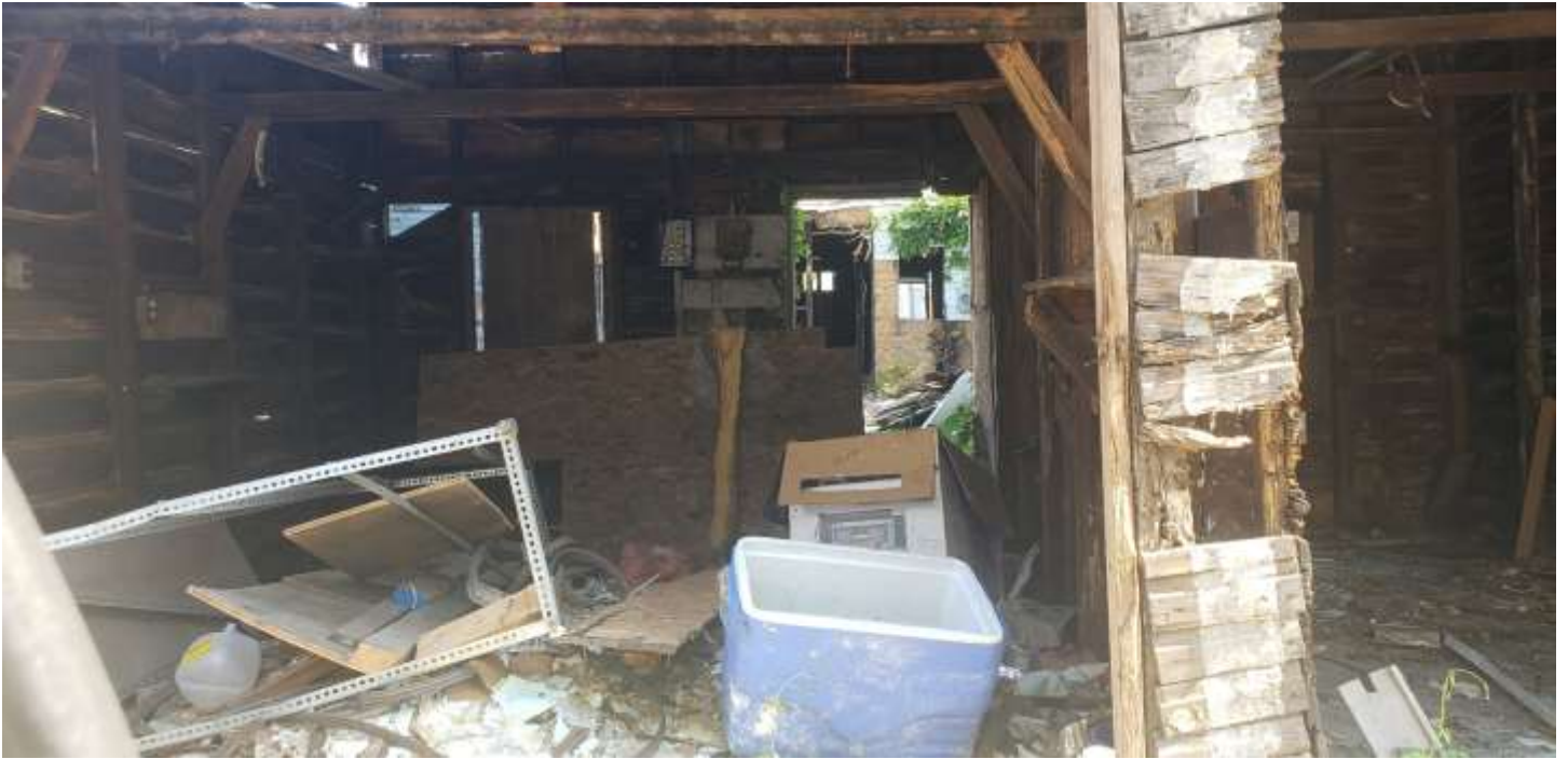
Interior photo of the exisitng garage.