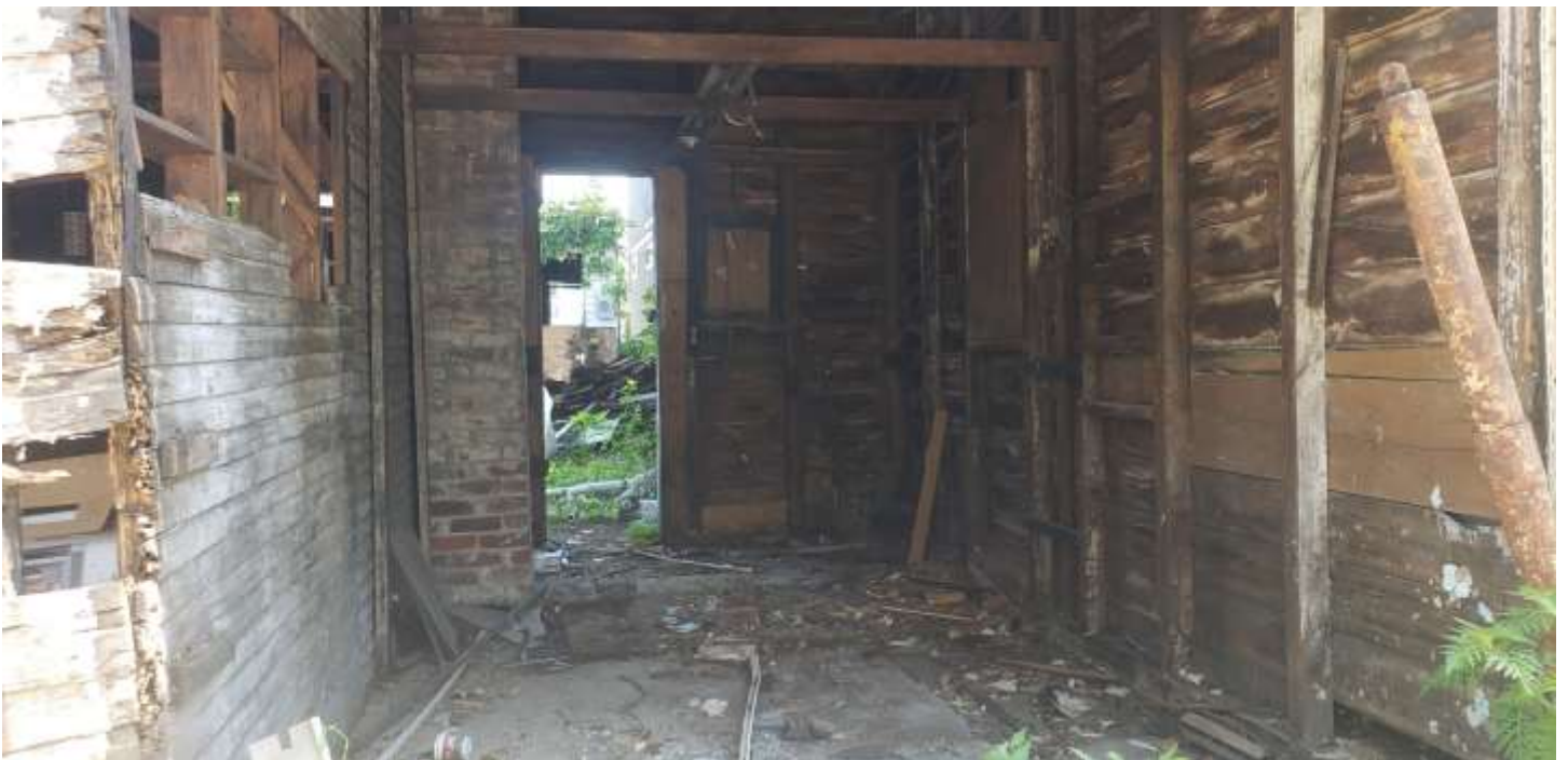
Interior photo of the exisitng garage.