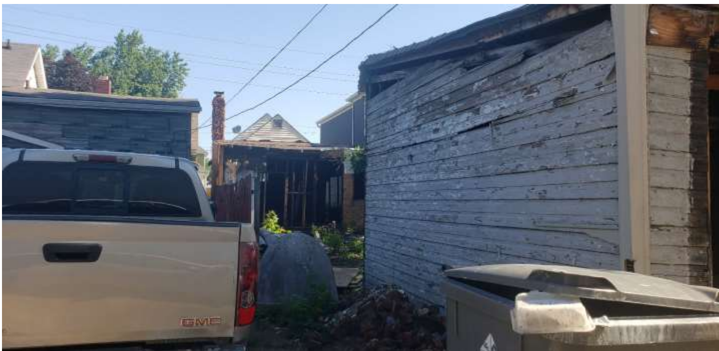
Photo of the rear of the house.