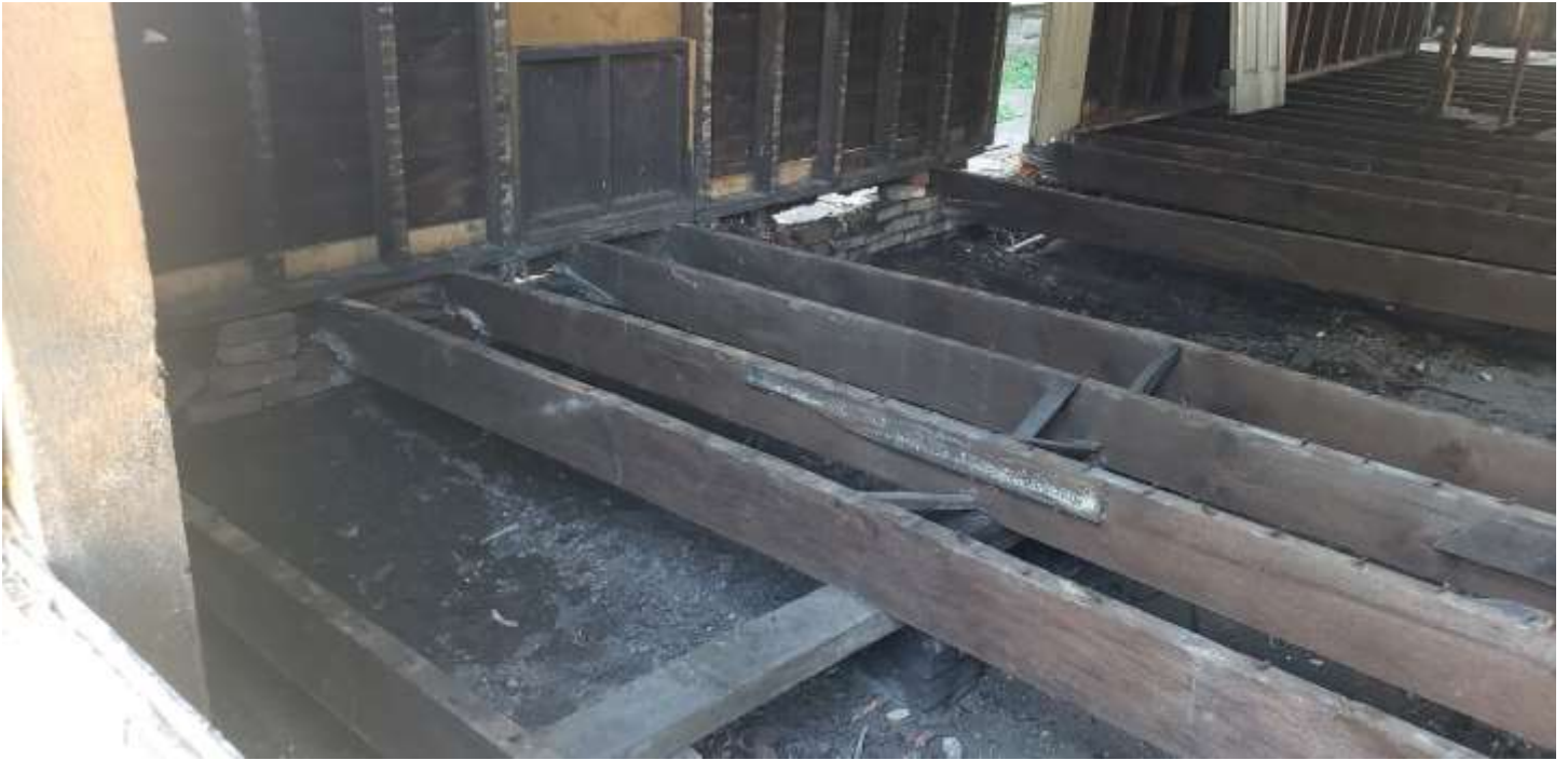
Interior photo of the existing building foundation.