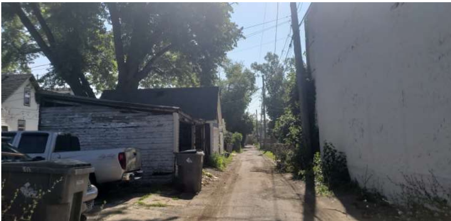
Photo of the alley south of the subject site.