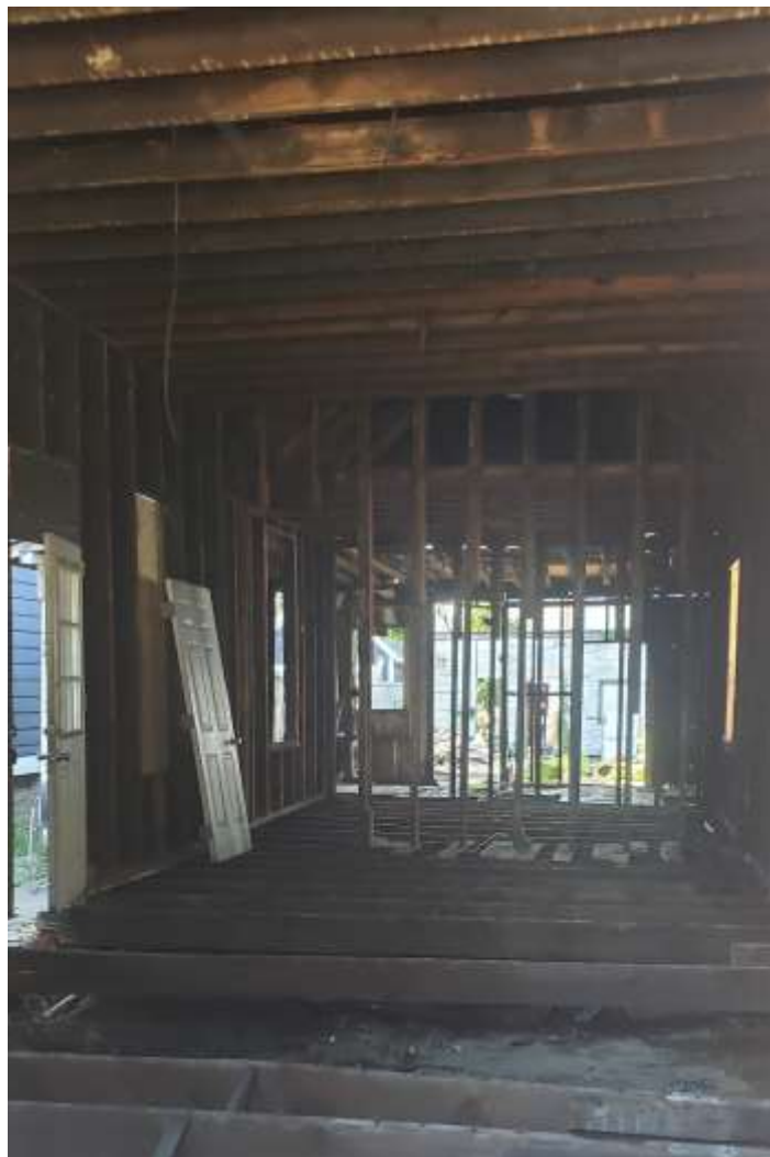
Interior photo of the existing building looking south.