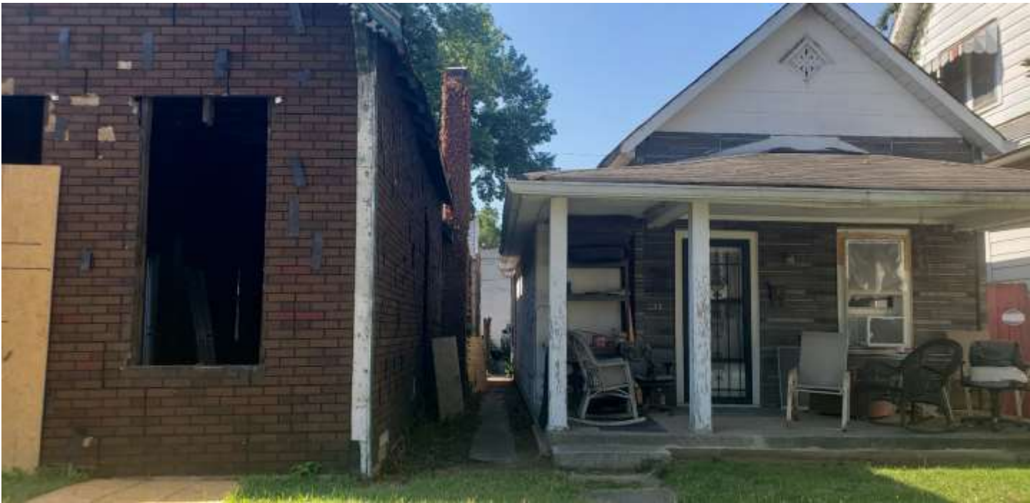
Photo of the existing west side setback.