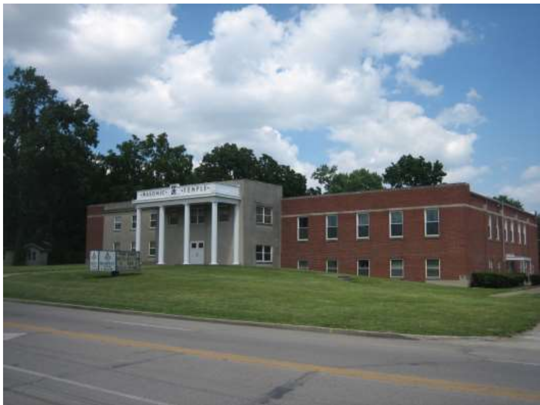
Adjacent fraternal organization use to the north of site, looking east.