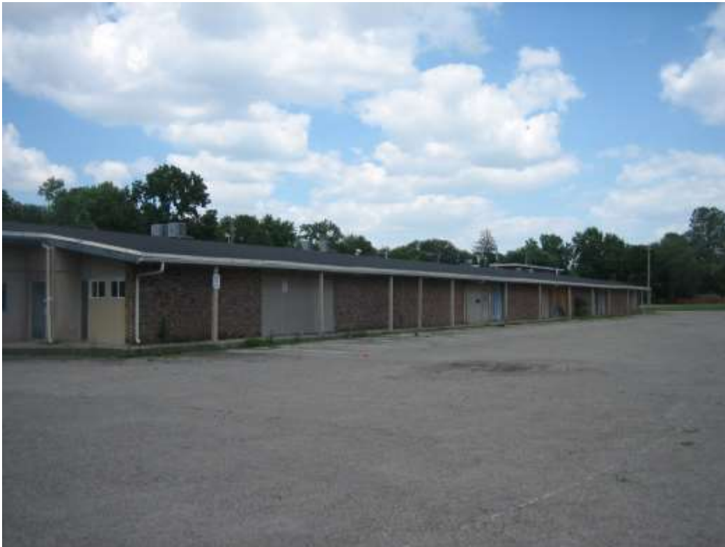
subject site looking northeast