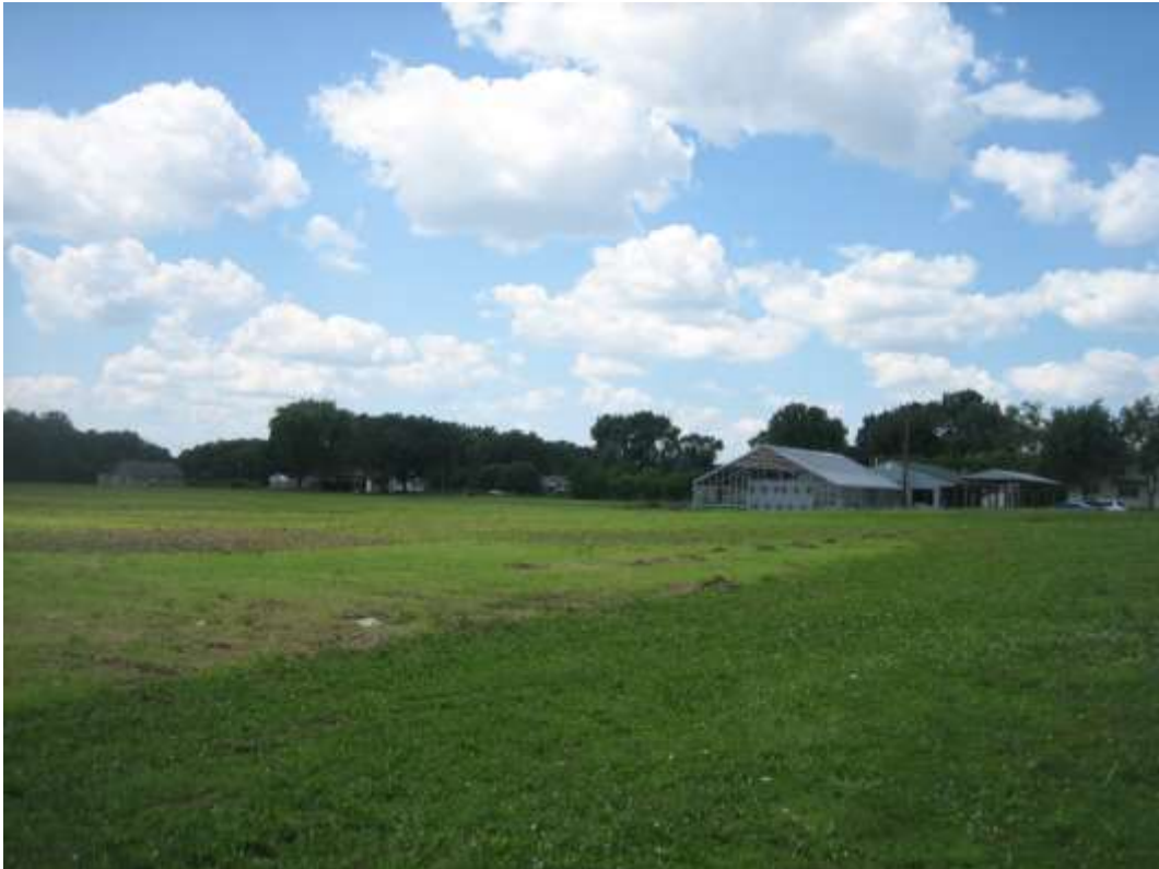
Adjacent agricultural use to the west of site, looking north.