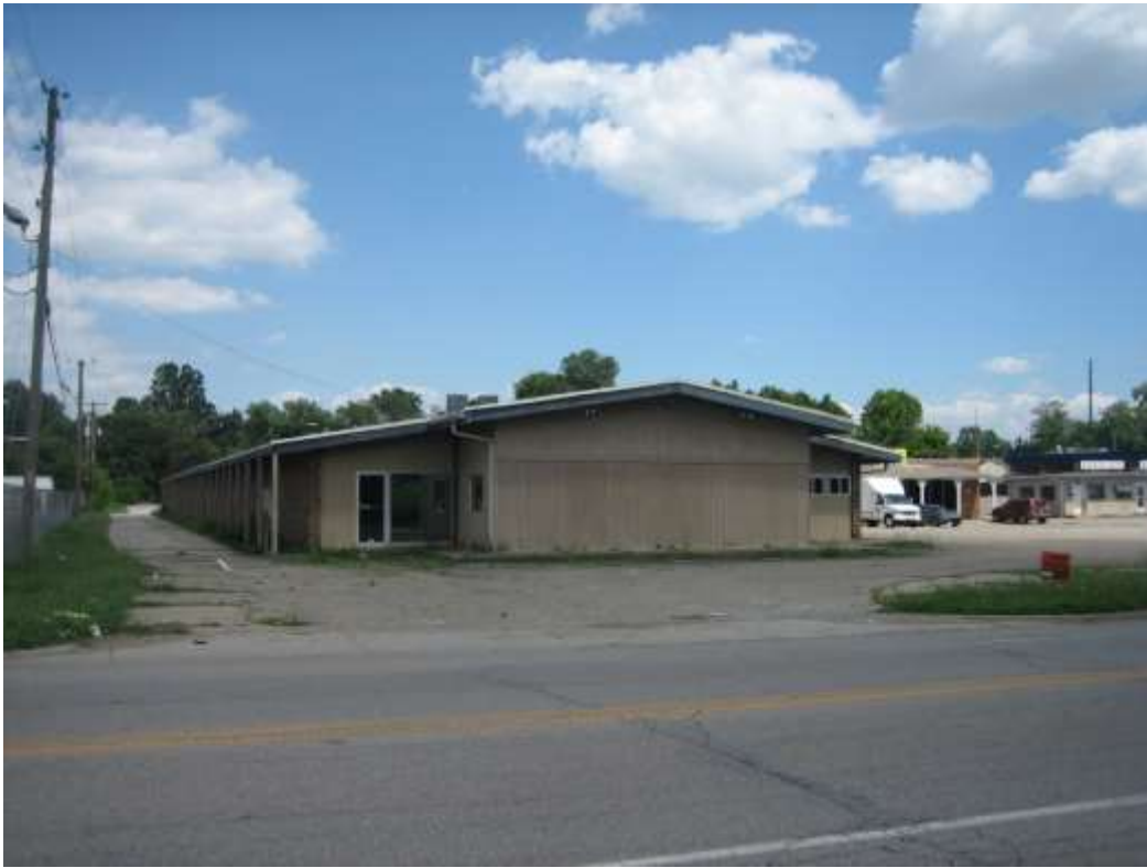
subject site looking east