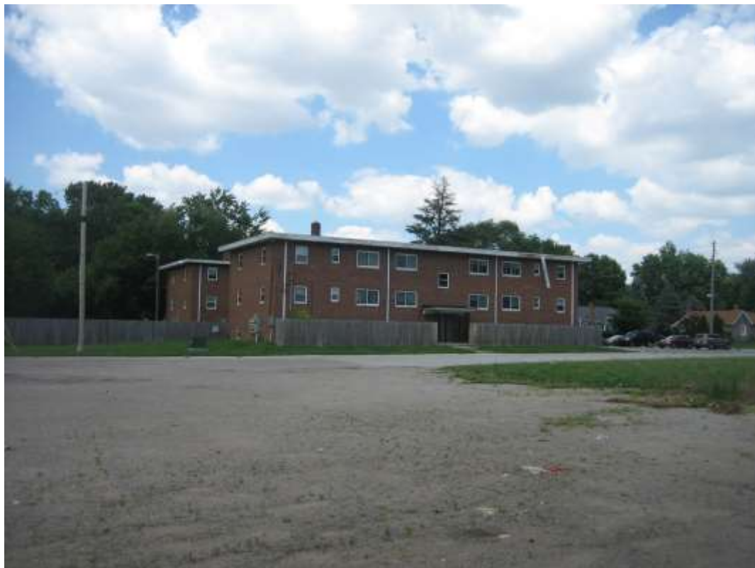
Adjacent multi-family dwellings to the northeast of proposed storage area.