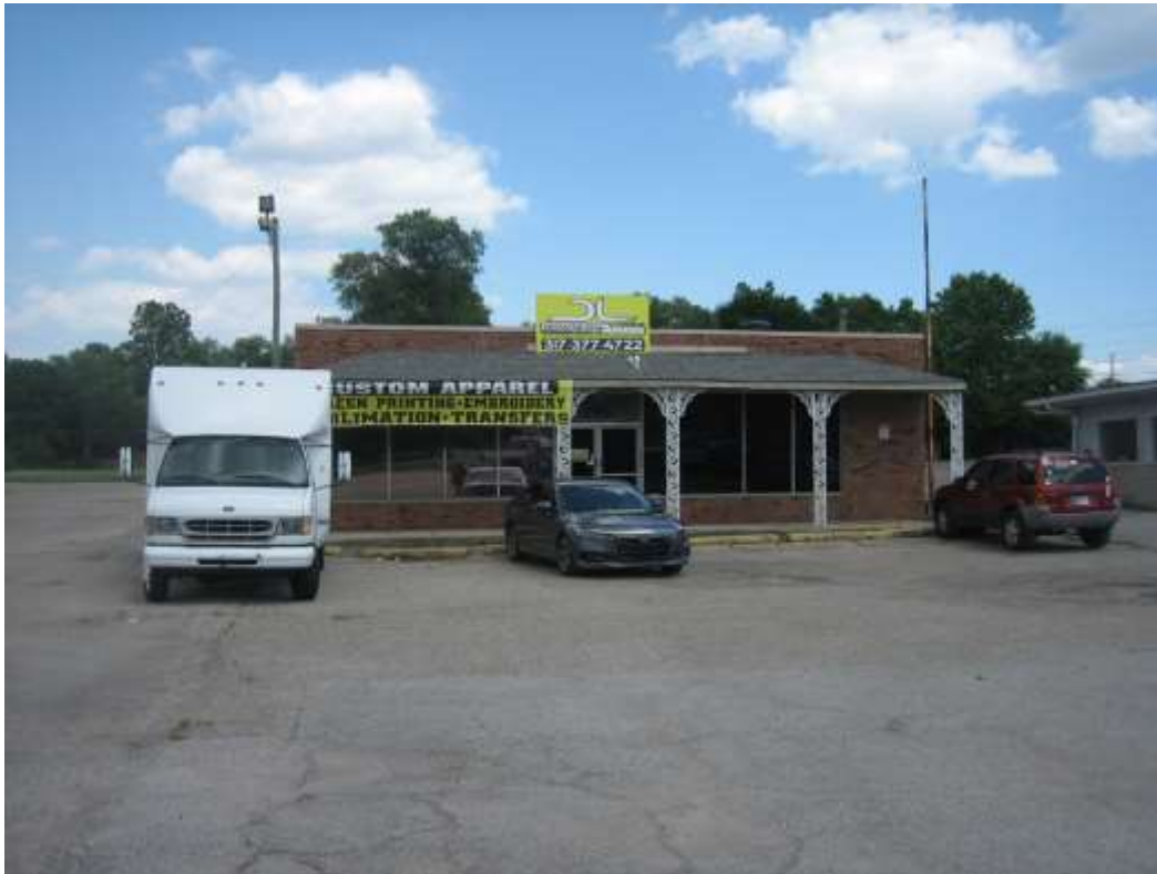
Adjacent commercial use to the south of site, looking east.