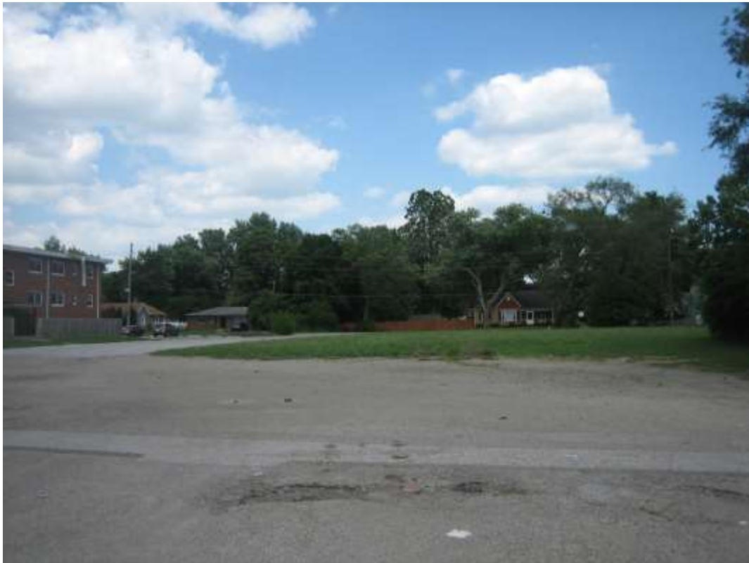
subject site proposed storage area, looking east