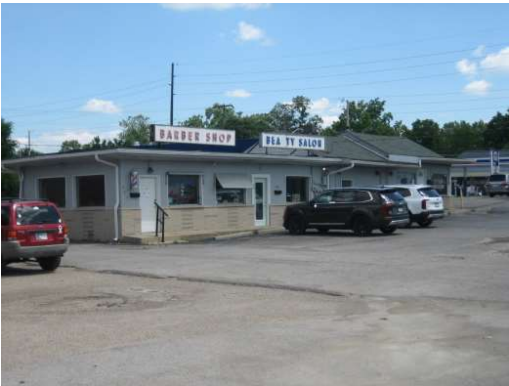
Adjacent commercial uses to the south of site.