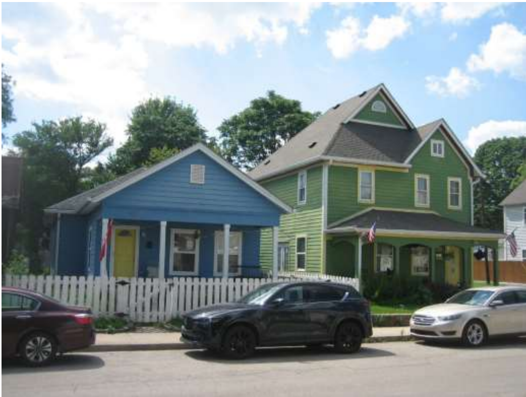
Adjacent properties to the north of subject site, looking west.