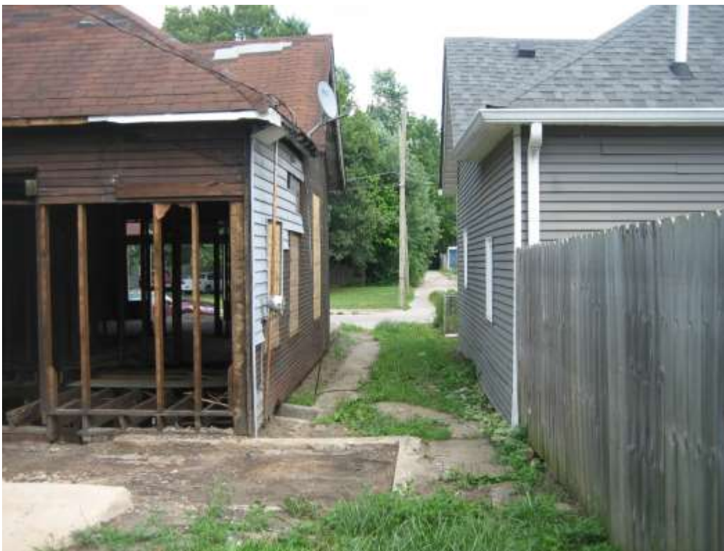
Subject site proposed area for sidewalk with a zero-foot side yard setback, looking east