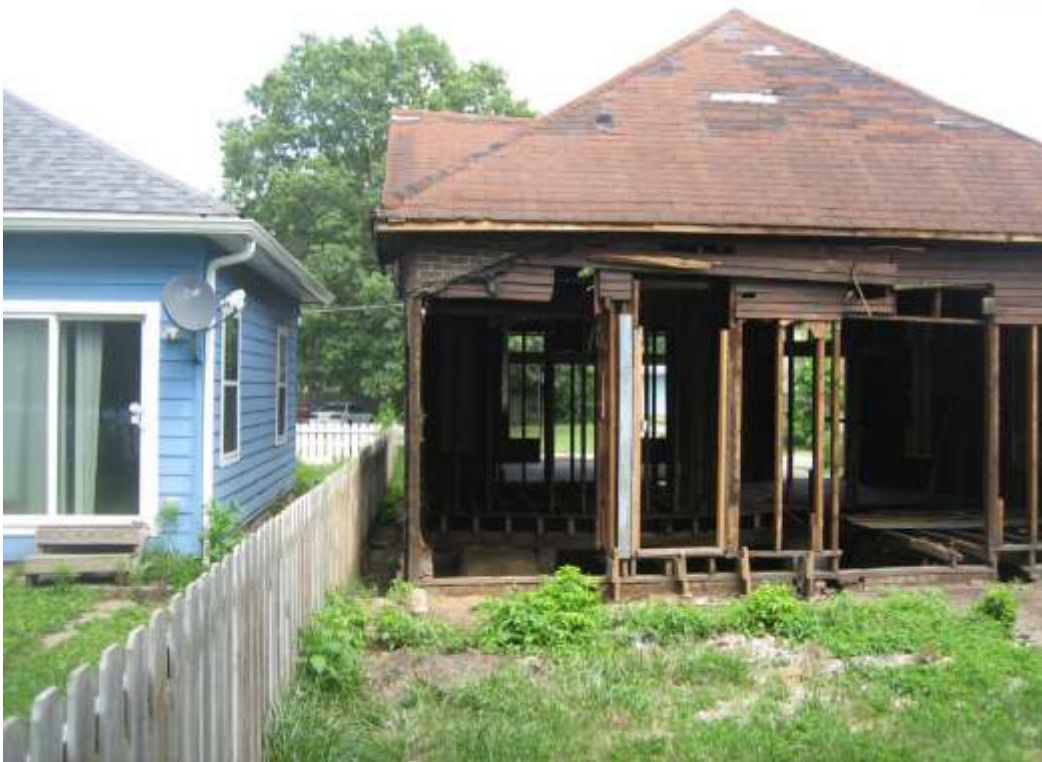
Subject site proposed area for addition with three-foot north side setback, looking east.