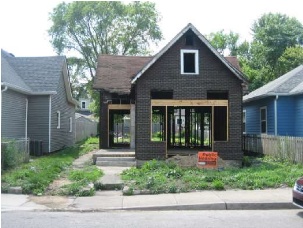
Subject site, looking west.