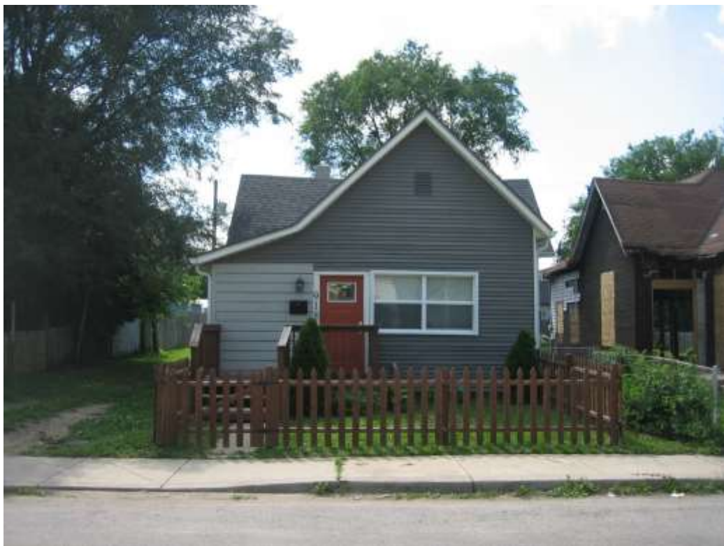
Adjacent property to the south of subject site, looking west.