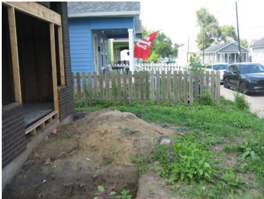
Subject site, proposed six-foot front setback, looking north.