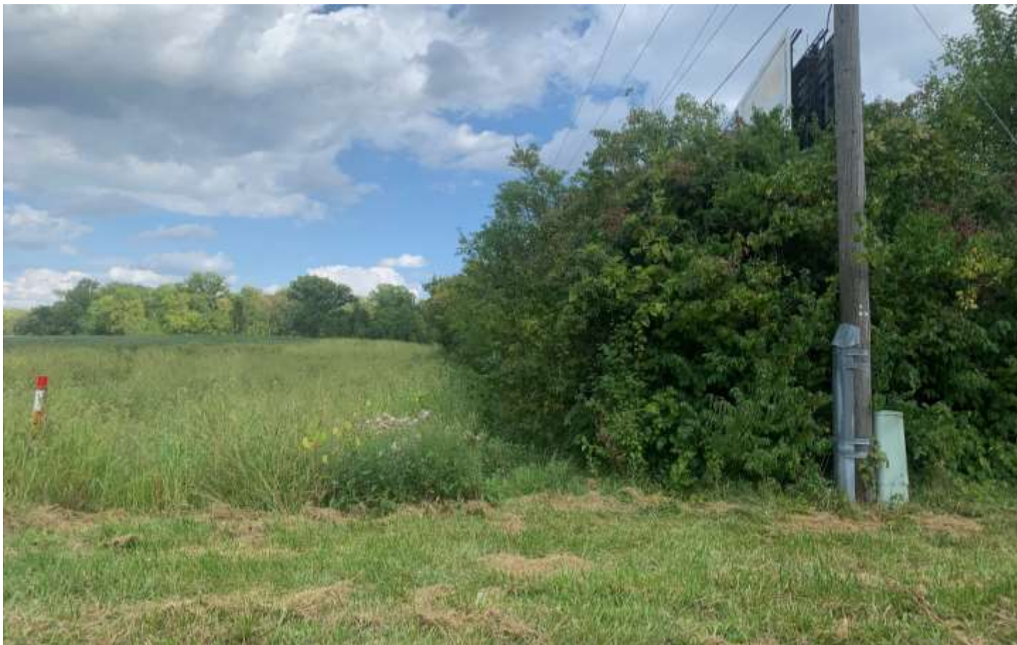
Photo of the southern property boundary.