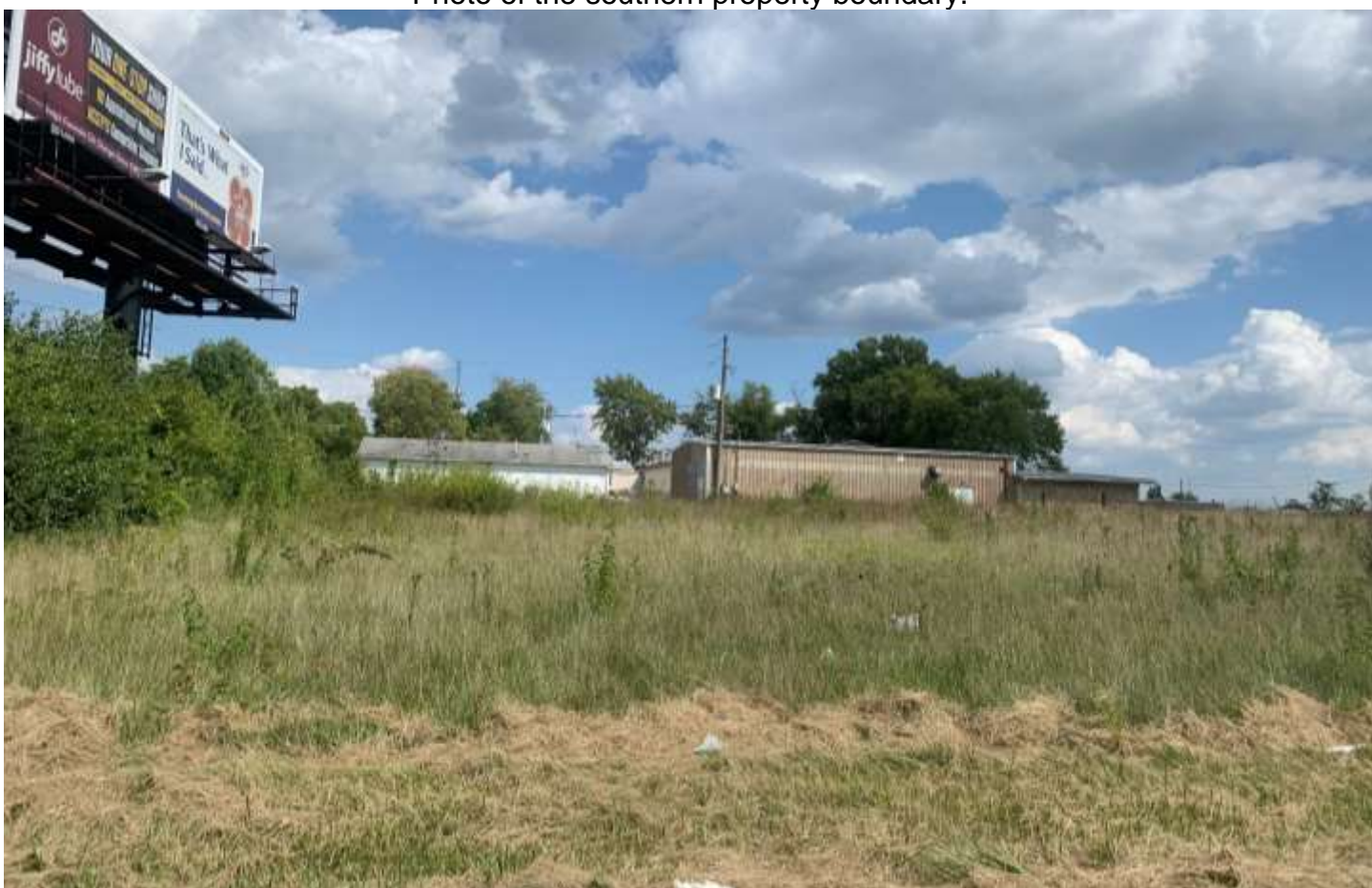
Photo of the undeveloped industrial lot.