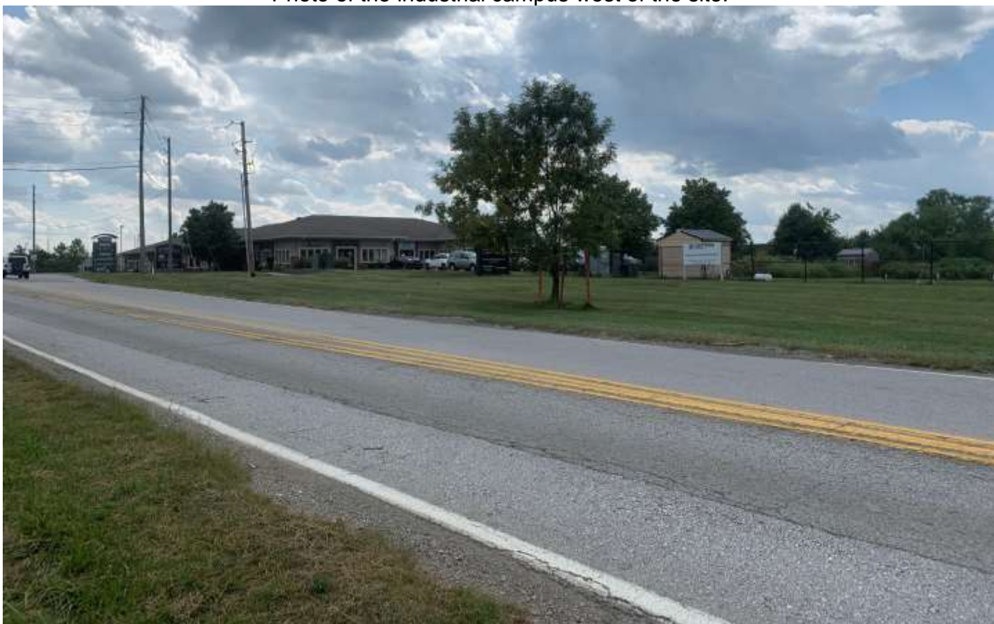
Photo of the commercial property southwest of the site.