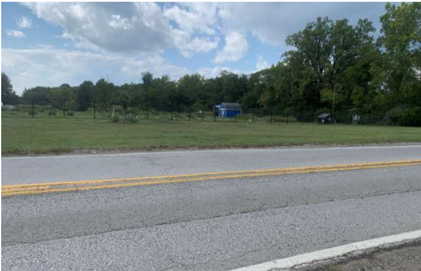
Photo of the industrial campus west of the site.