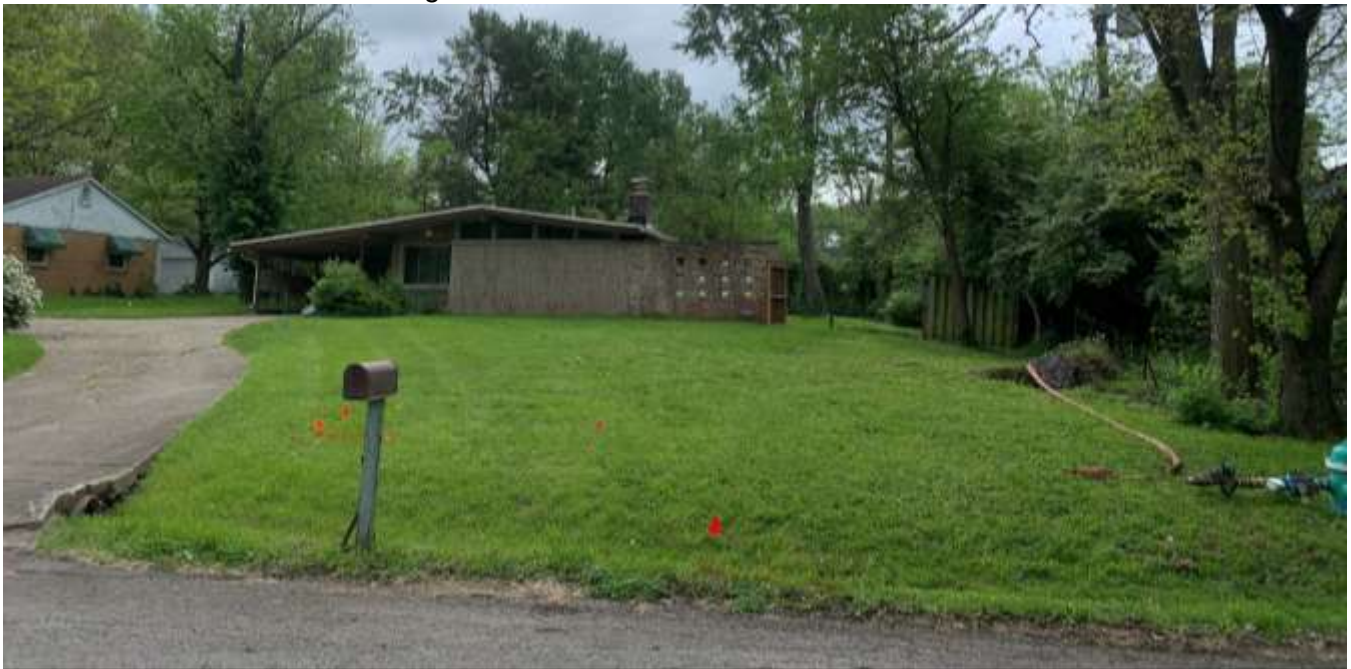
Photo of a single-family dwelling east of the site.