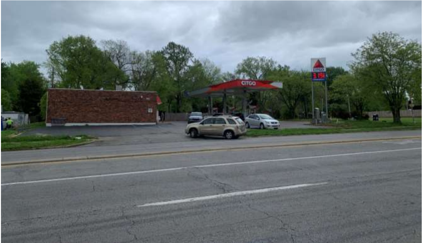
Photo of the gas station and convenience store south of the site.