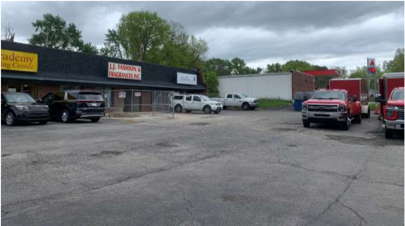
Photo of the rear tenant at the far south of the site.