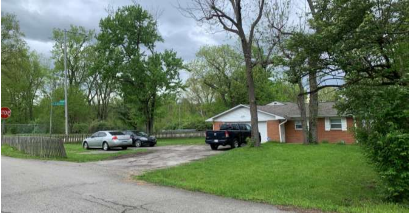
Photo of a single-family dwelling north of the site.