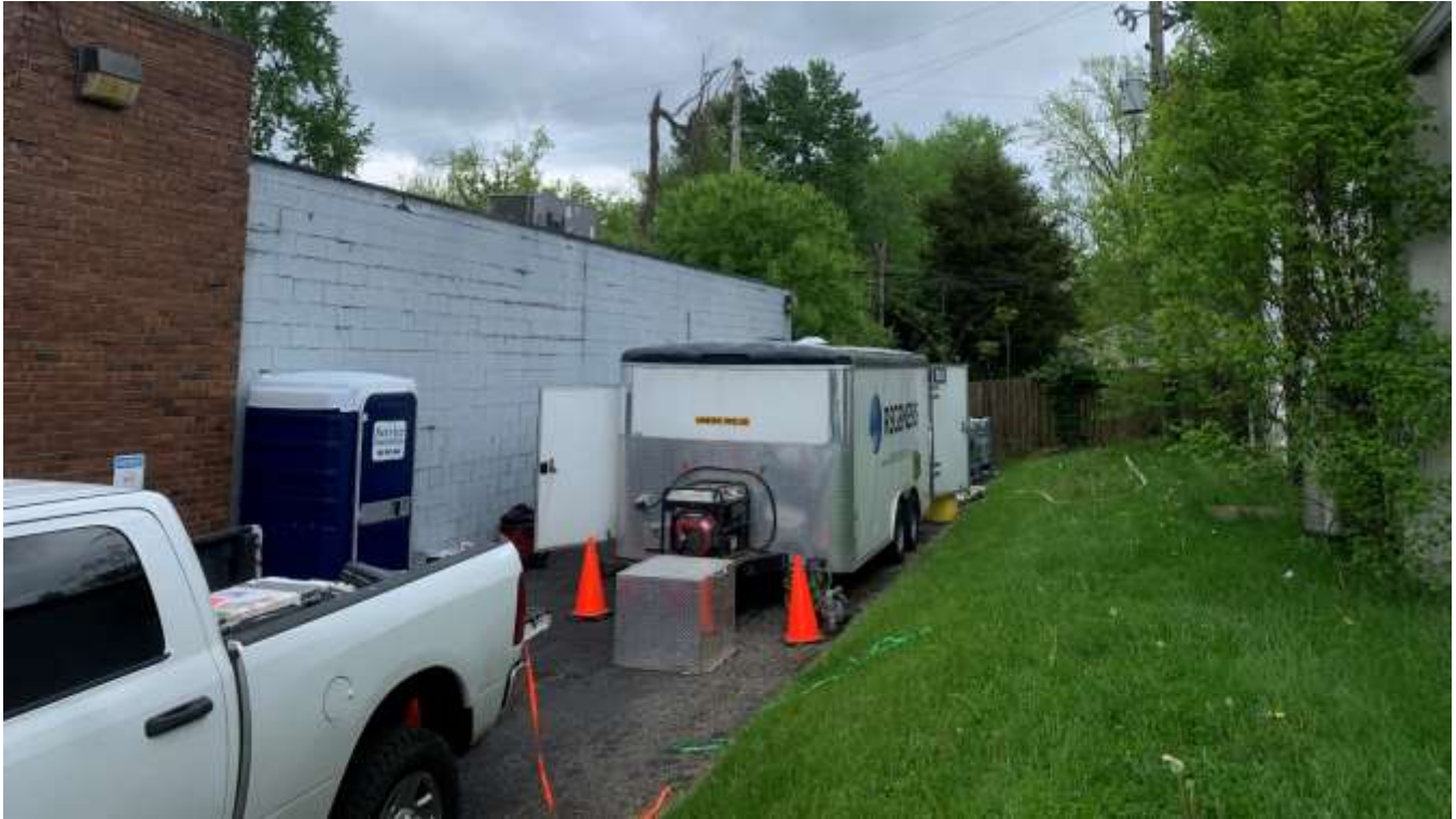
Photo of the southern building façade and southern property boundary.