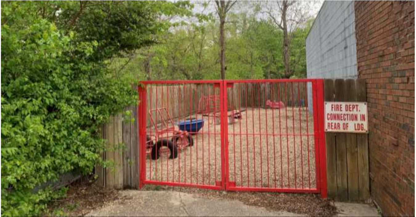
Photo of the outdoor play area for the day care center.