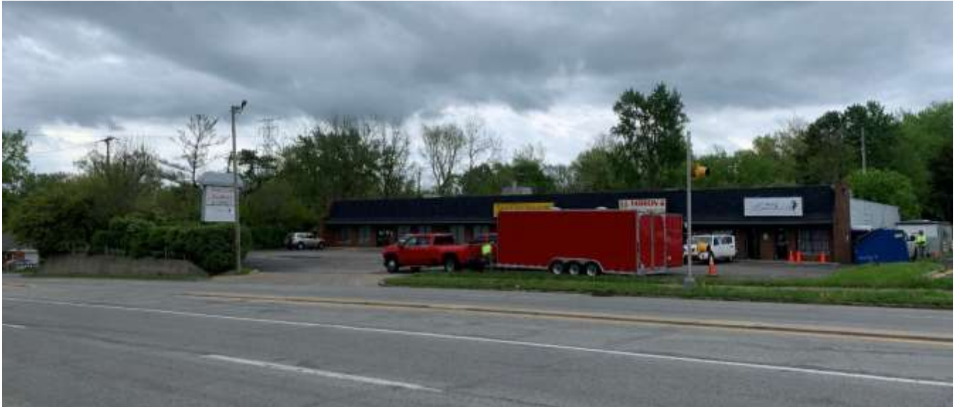
Photo of the subject site.