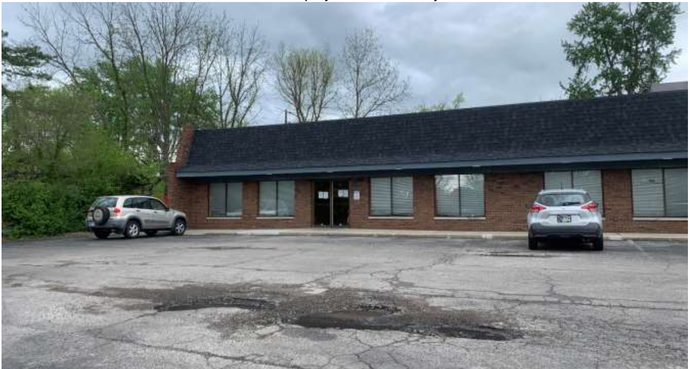
Photo of the day care center tenant.