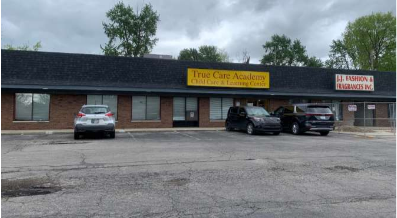
Photo of the middle tenants of the commercial strip center.