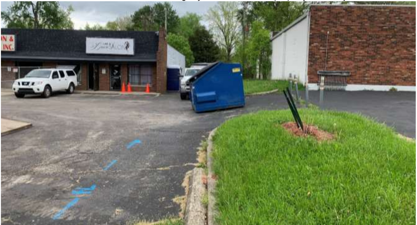
Photo of a dumpster on site that needs to be enclosed and relocated from the front yard.