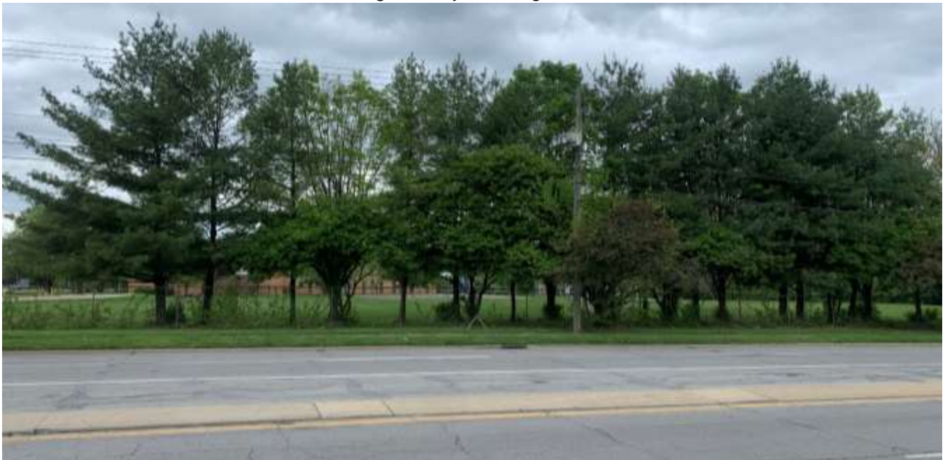
Photo of the school west of the site behind the tree line.