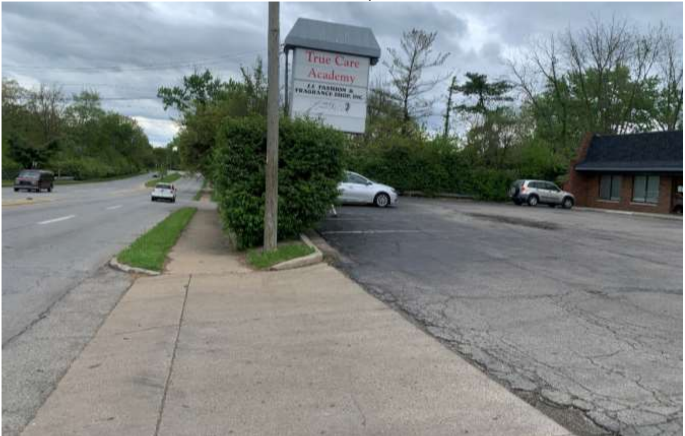
Photo of the street frontage of the site looking north.