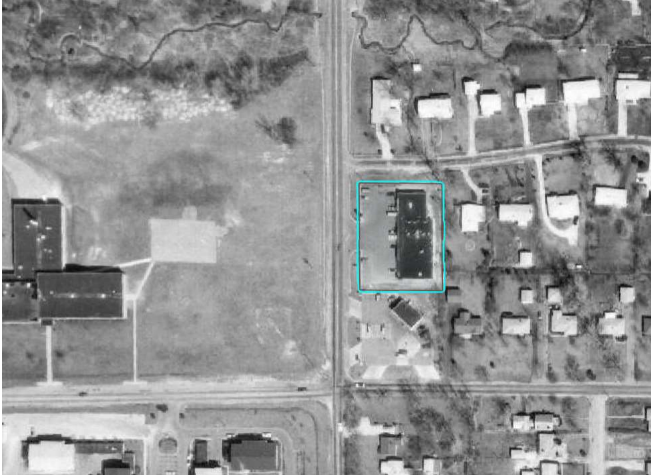
1972 Aerial Photo