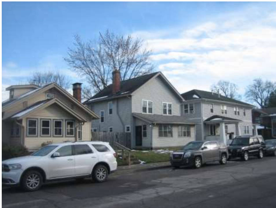
Adjacent dwellings to the south, looking southeast