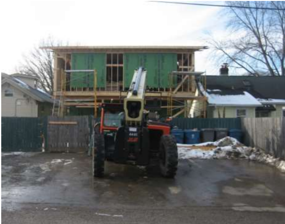
Subject site rear, looking west from adjacent rear alley.