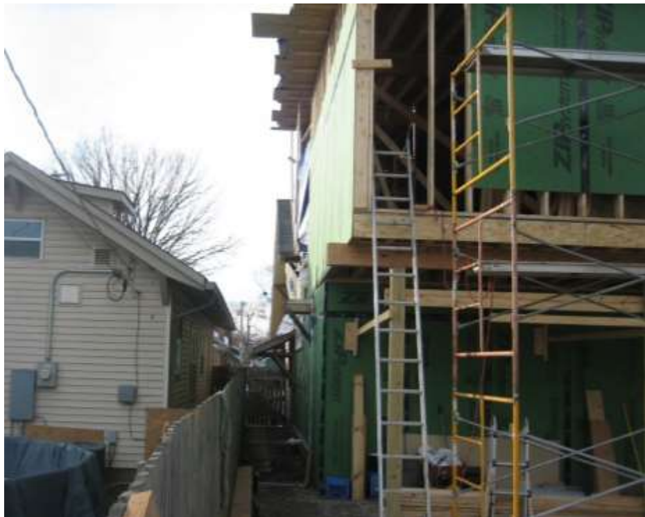
Subject site proposed south side setback under construction, looking west.