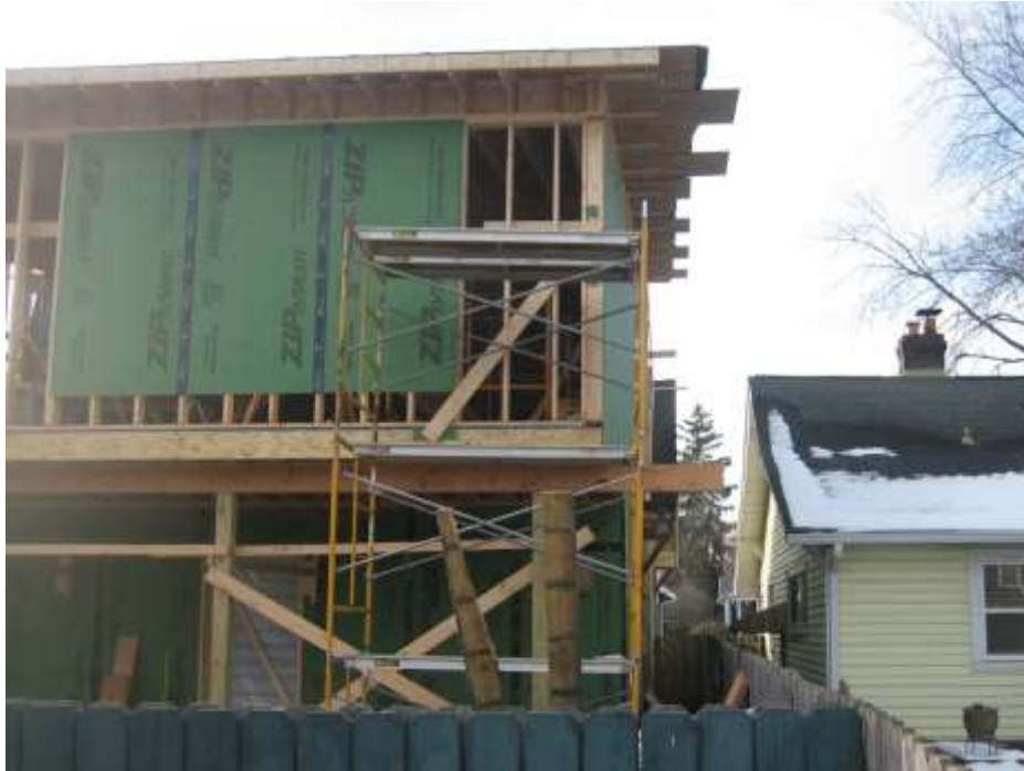
Subject site proposed north side setback under construction, looking west.