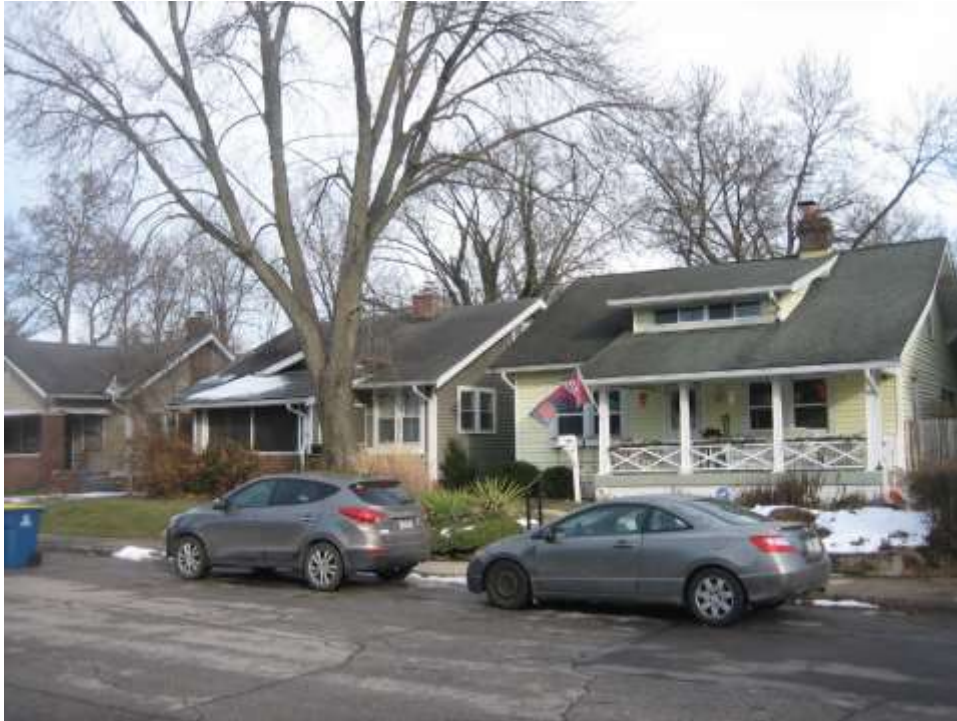
Adjacent dwellings to the north, looking northeast