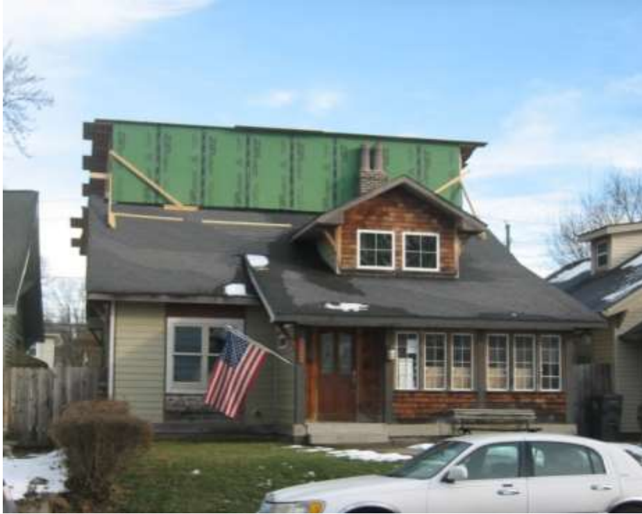
Subject site front, looking east from Broadway Street.