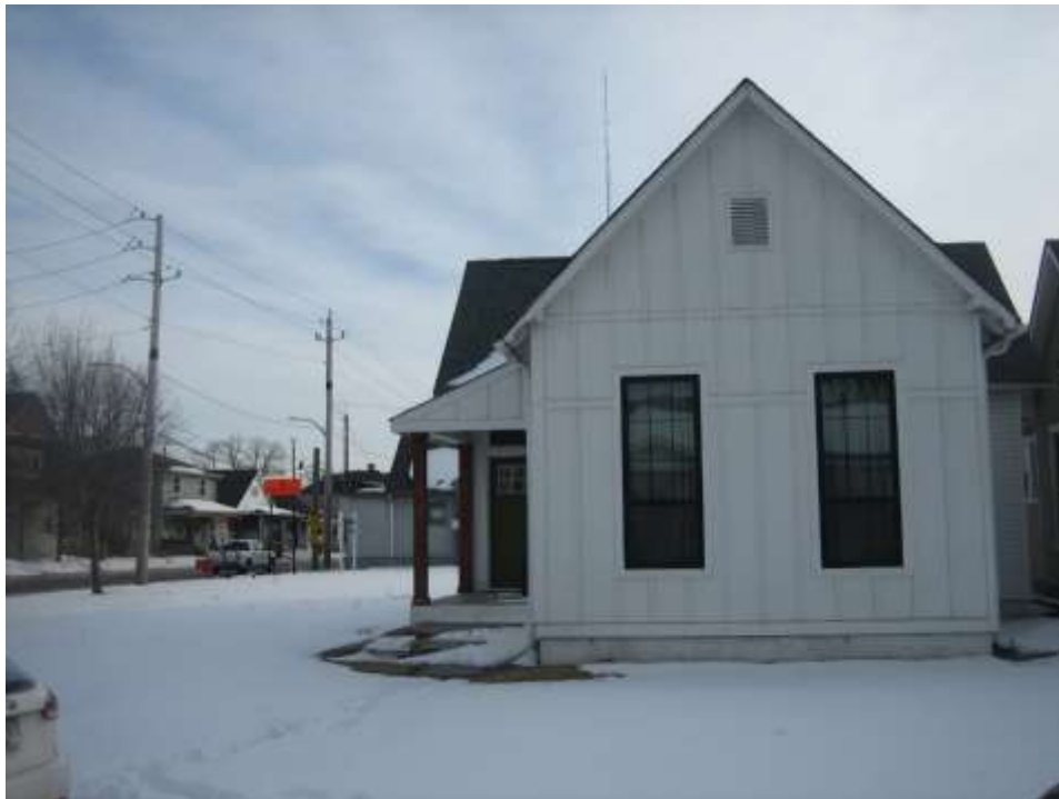
Photo 2 - Adjacent property to the west, looking south.