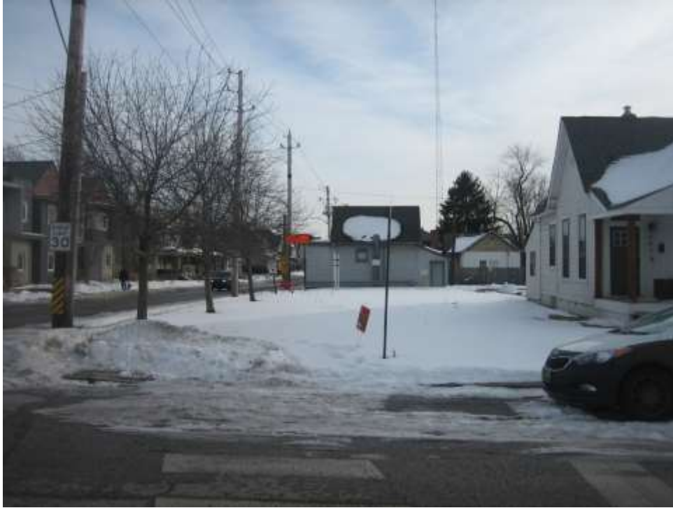
Photo 1 - Subject property looking south.