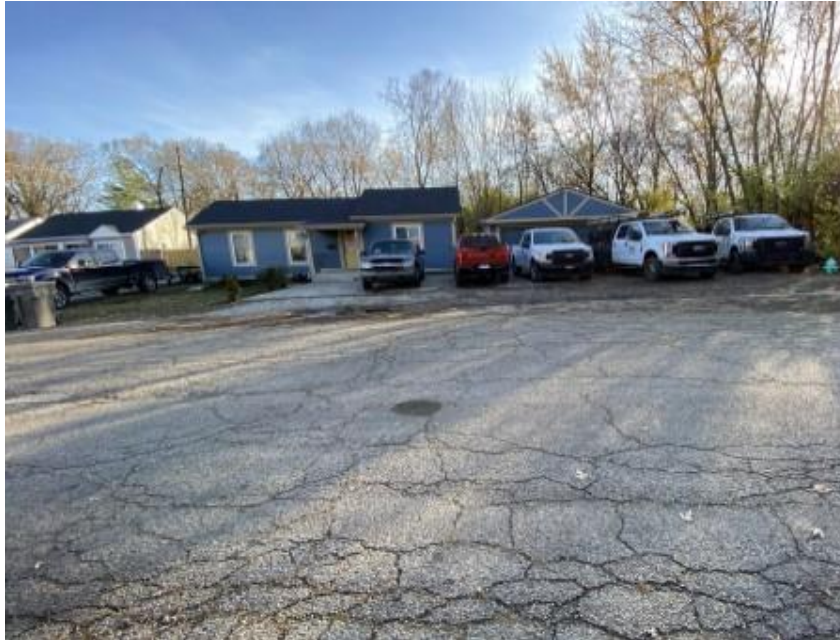
Photo 9: Commercial Vehicles within Front Yard Viewed from North (November 2025)