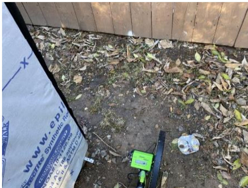
Photo 8: Separation Between Unpermitted Garage and Fence to East (November 2025)