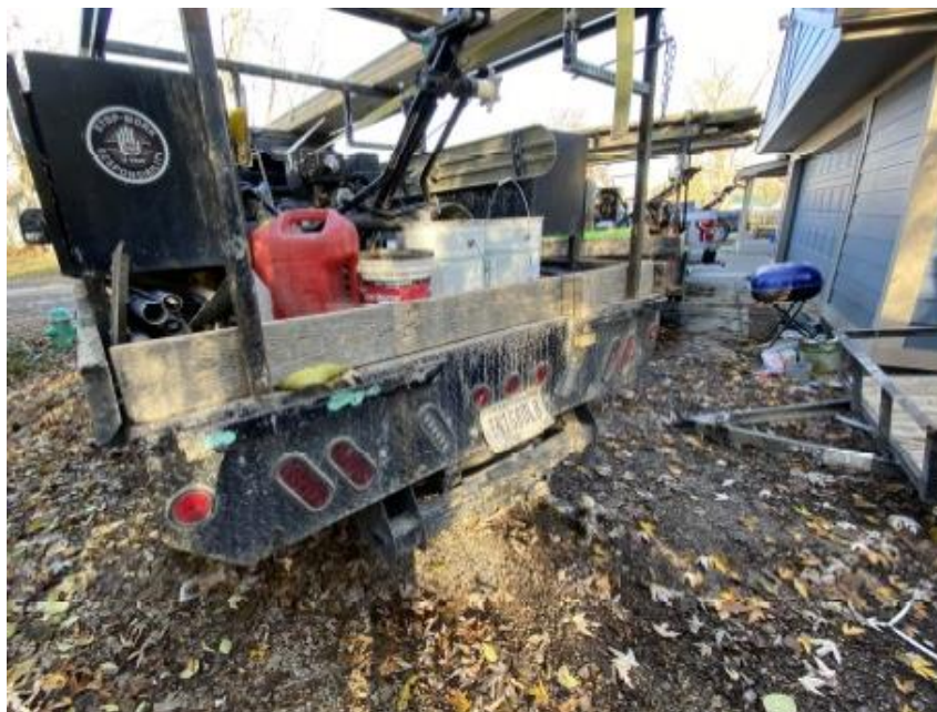
Photo 10: Commercial Vehicles within Front Yard Viewed from East (November 2025)