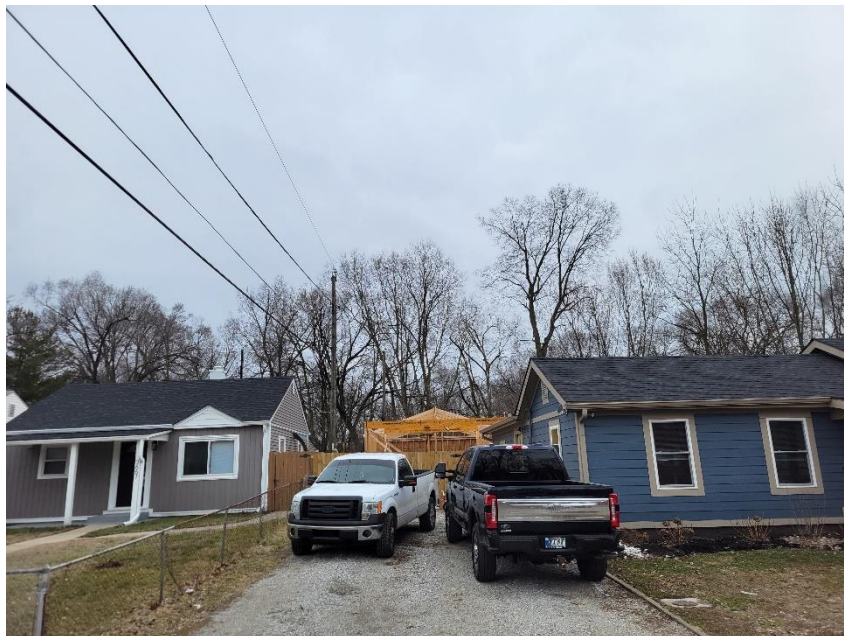
Photo 2: Unpermitted Driveway and Accessory Structure Viewed from North