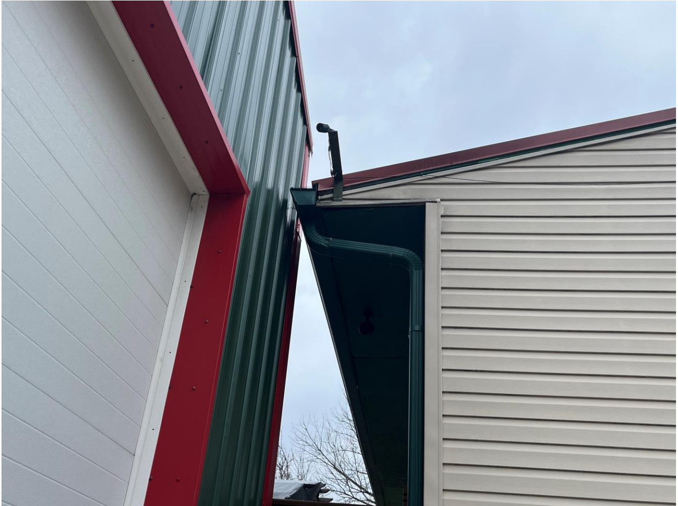
Photo 3: Highlighting that barn is detached accessory structure from primary dwelling