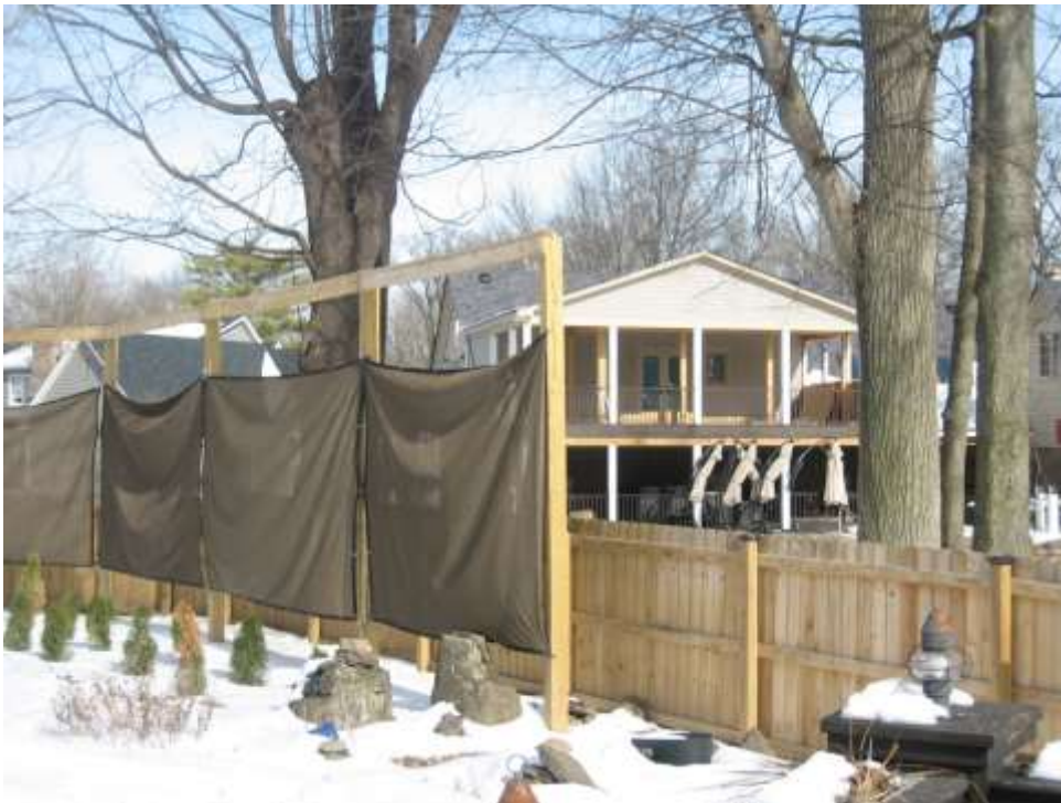
Subject property proposed fence looking north.