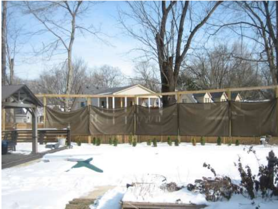
Subject property proposed fence looking northeast.