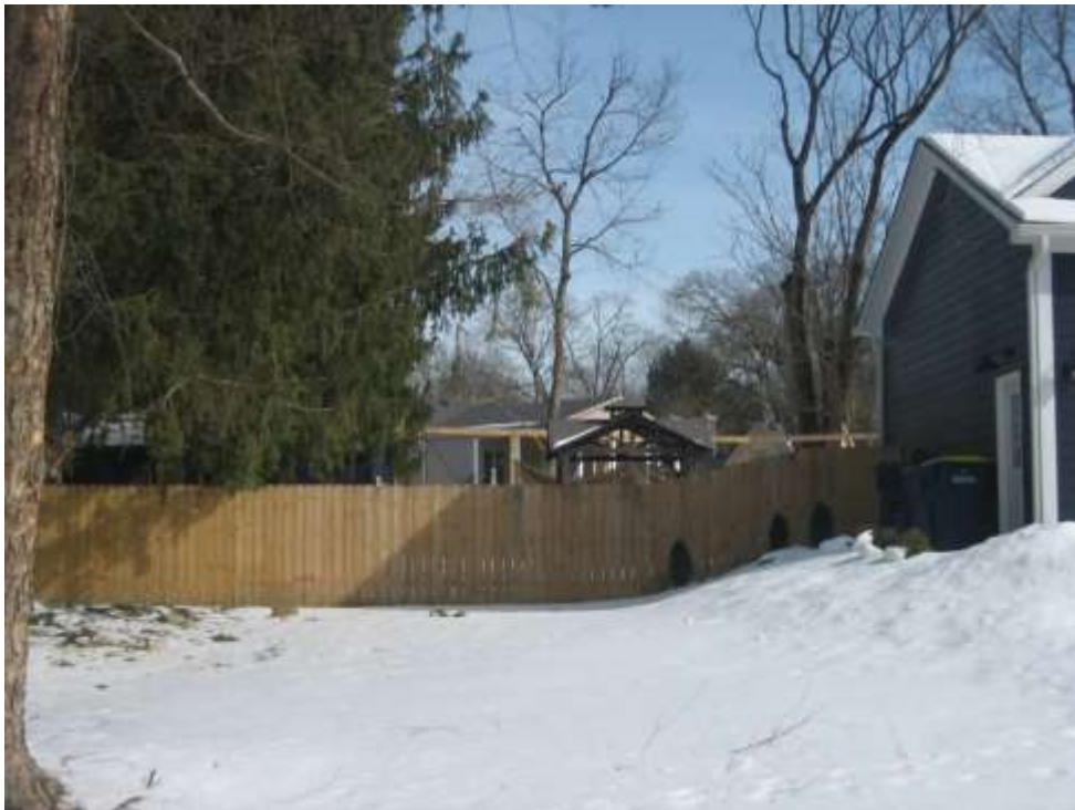
Subject property looking east from Olney Street.