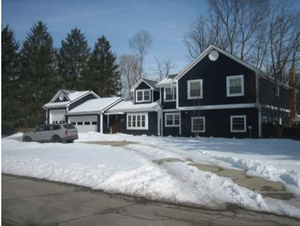
Subject property looking northeast.