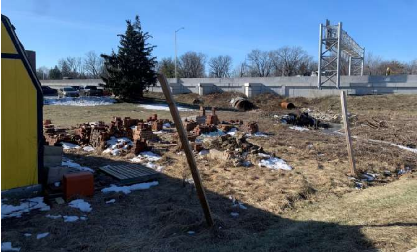
Photo of the existing outdoor storage of materials.