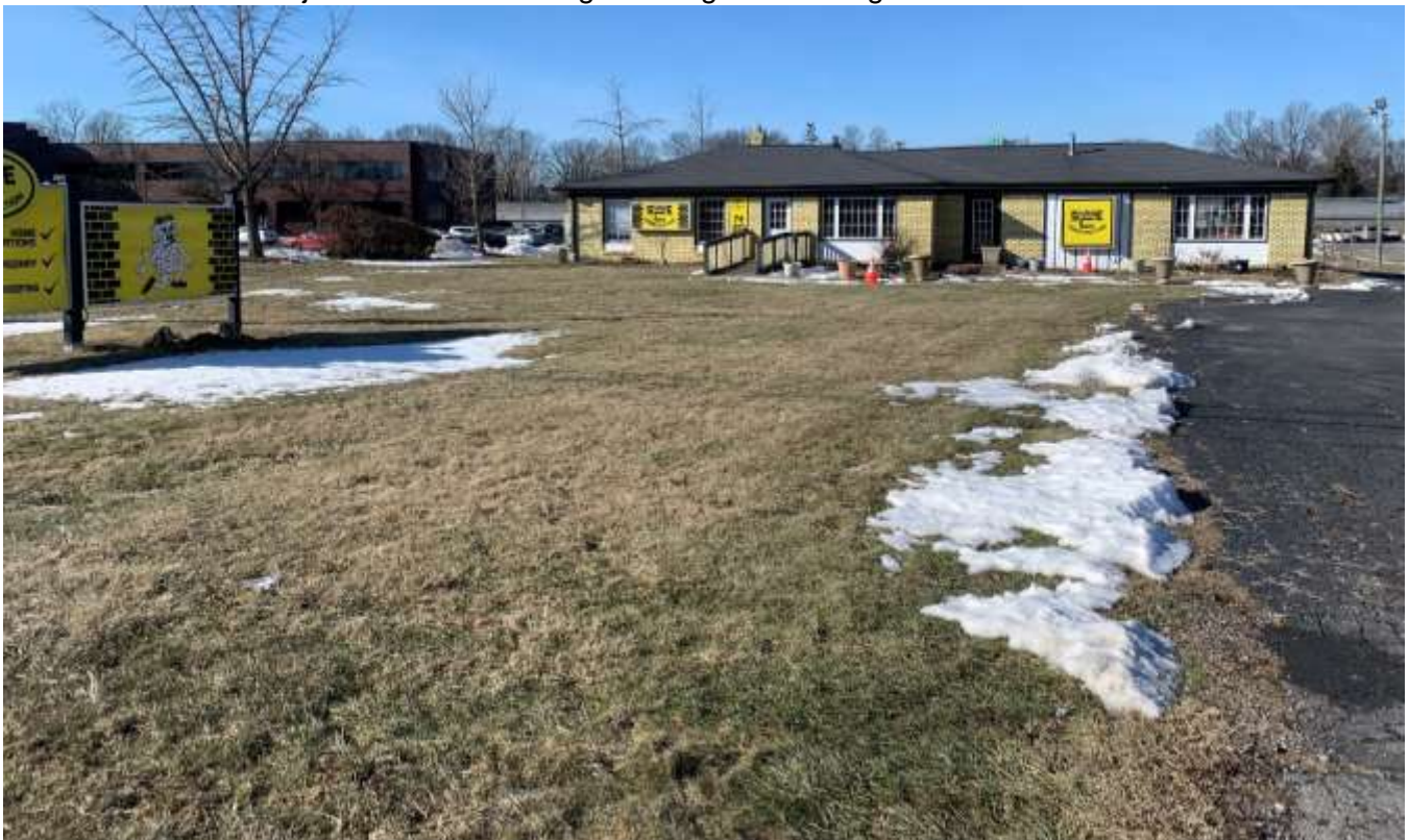
Photo of the subject site.