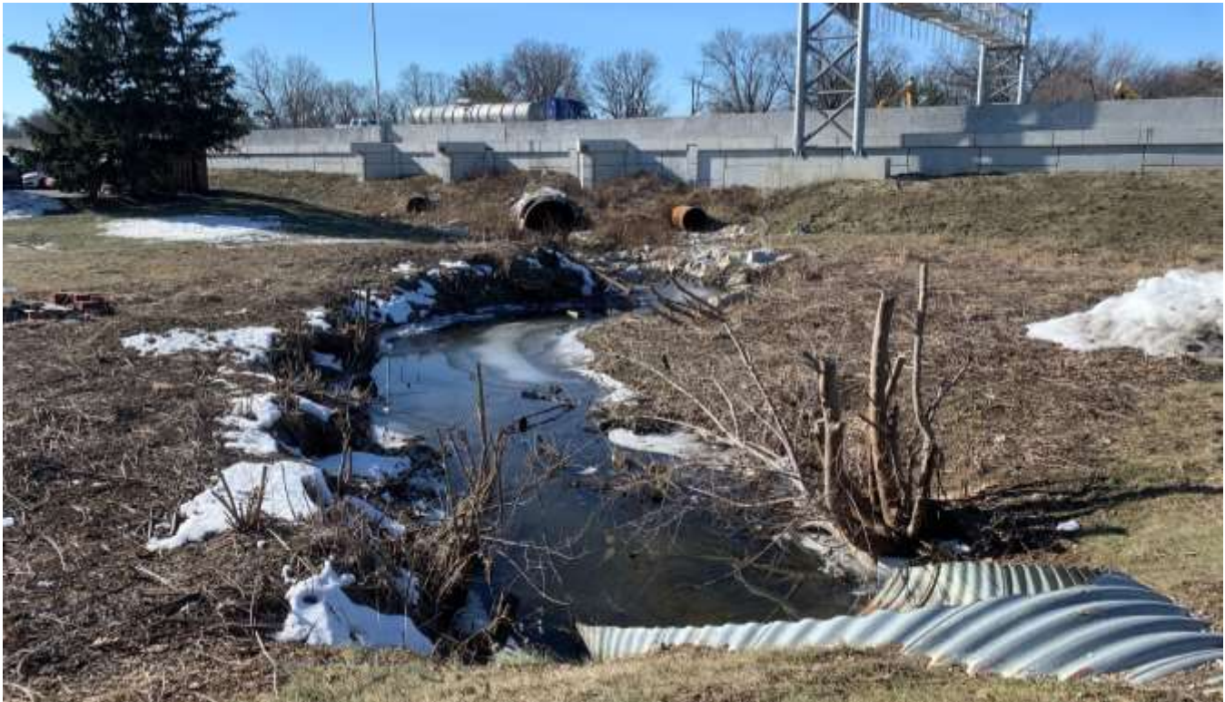
Photo of Blue Creek Stream and interstate in the background.