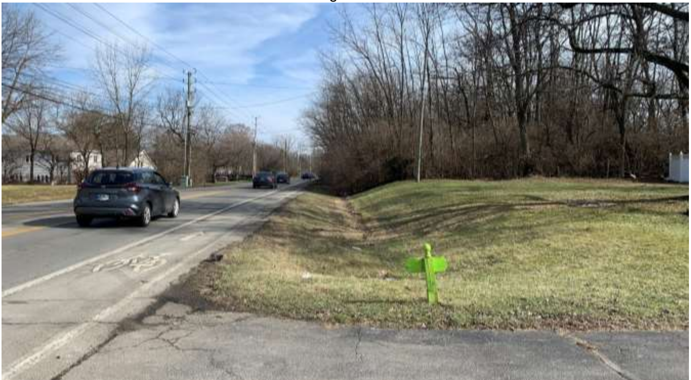
Photo of the street frontage east of the entrance drive.