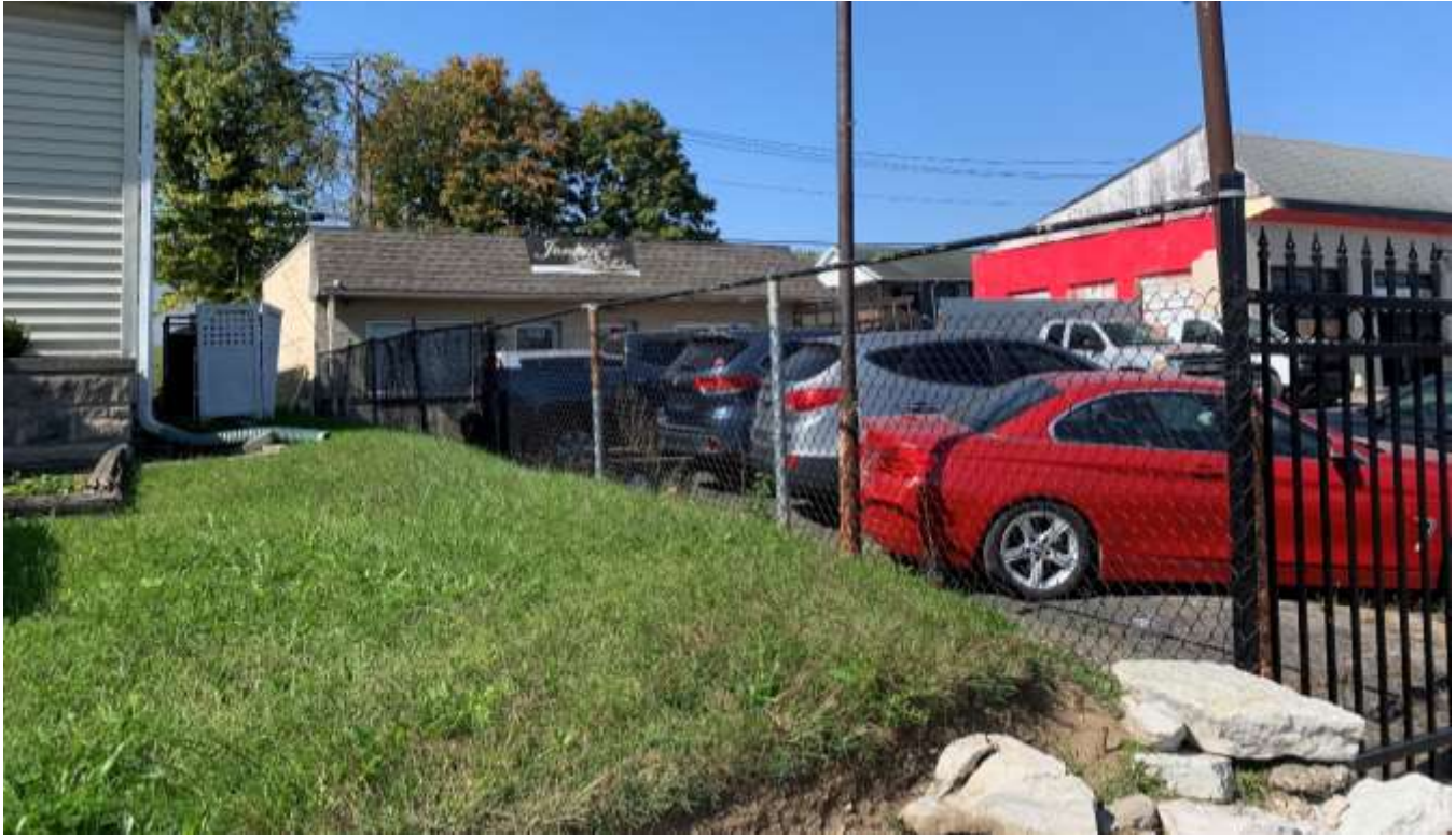
Photo of the subject site at 4460 North Keystone Avenue.