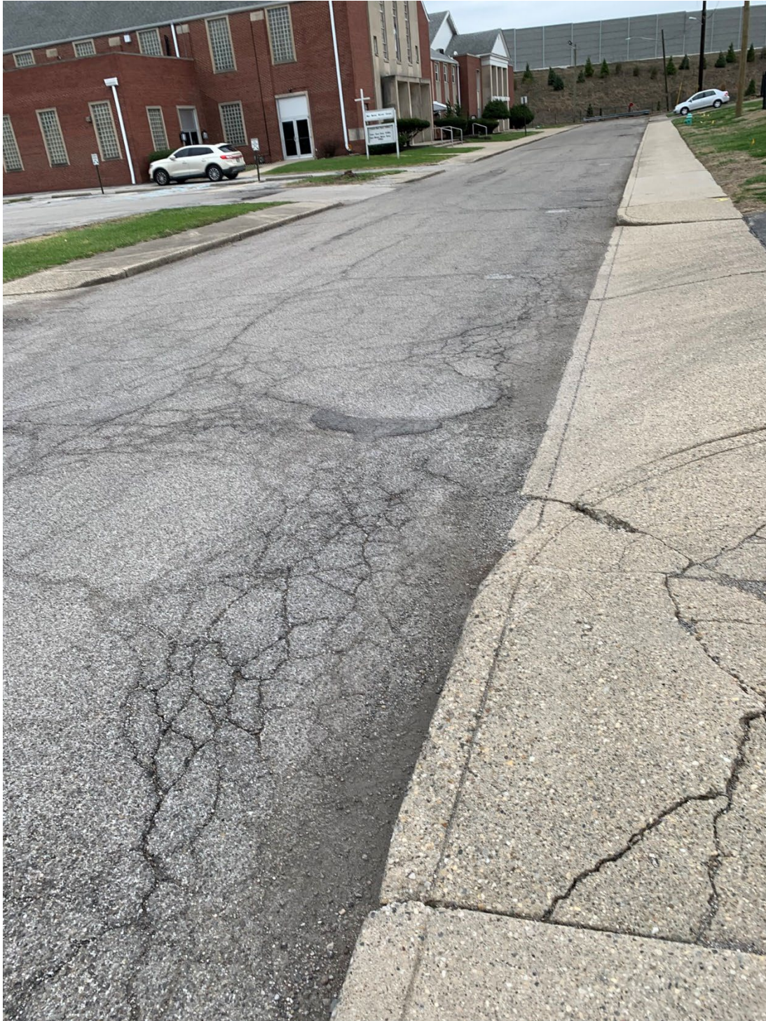
Photos of subject street and sidewalks