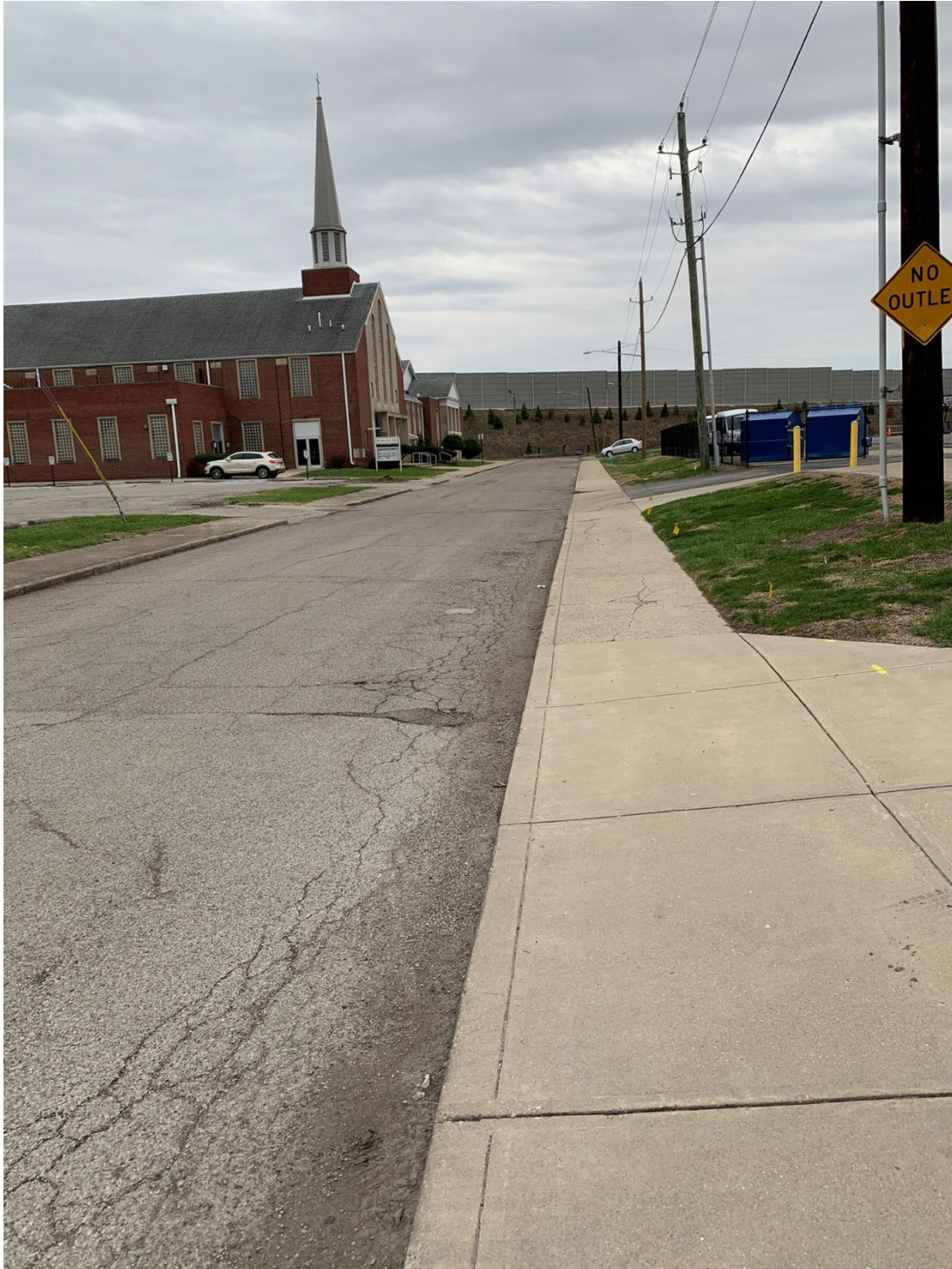
Photos of subject street and sidewalks