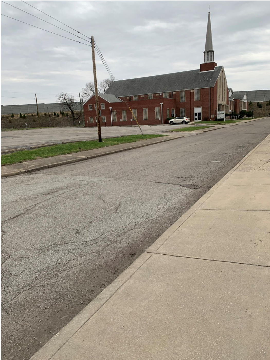
Photos of subject street and sidewalks